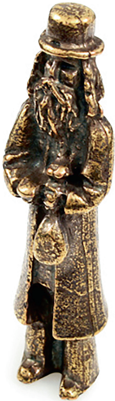
Fig. 1: Figurine of Jew with a Pouch, Symbol of Fortune [Jubileo.pl, Figurka Żyd z skaiewką. Symbol fortuny.]

Jews in today's Poland comprise but a minuscule share of the population—less than 0.01%. 2 Hence the great majority of Poles have never met a Jew in their life. Jews, however, occupy a significant space in the Polish institutional, cultural, as well as popular psyche, validating Diana Pinto's observation that “the larger