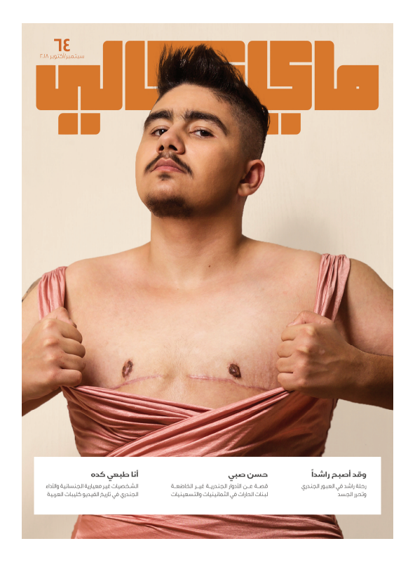
Fig. 1: My. Kali cover, featuring Rashed, no. 64 (Arabic version).

LGBTQIA+ experiences or memories, others are (self-)critical of the magazine's work, and some discuss academic concepts such as Joseph Massad's "Gay International" or Jasbir K. Puar's "Homonationalism"<sup>3</sup> – concepts which will be discussed at length below.