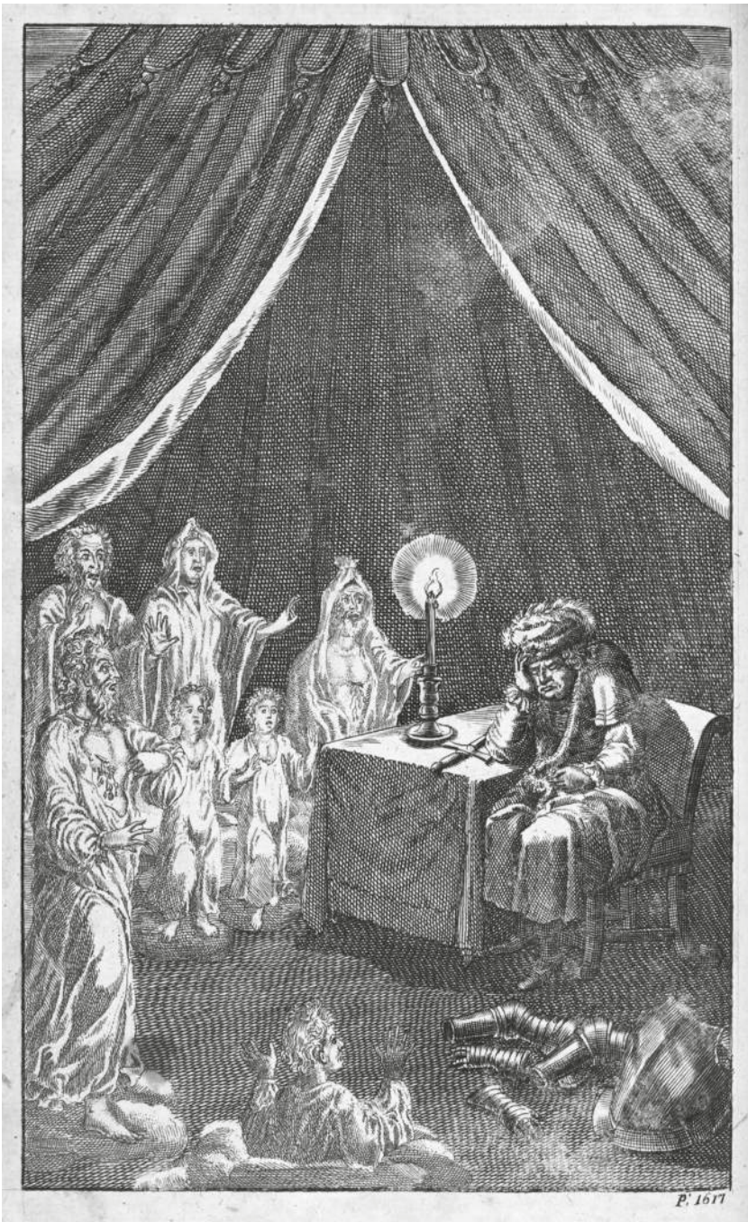
1. Frontispiece to Nicholas Rowe's Richard III (1709).