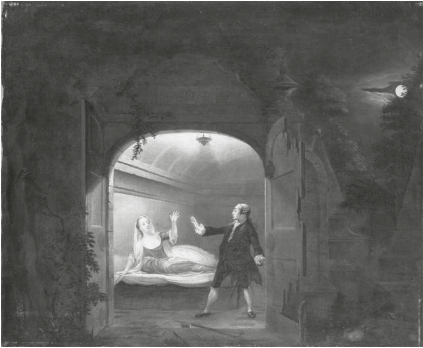
9. Benjamin Wilson, David Garrick and George Anne Bellamy in "Romeo and Juliet", Act V, Sc. 3 (1753).

self.) “When she finds that Romeo has overheard her” in the balcony scene, the critic explains, “the surprise, the sudden change of voice, and flutter of spirits so natural on that occasion, are finely represented by Miss Bellamy , while Mrs. Cibber continues to ring on her usual tone.” 63 Benjamin Wilson’s 1753 painting of the tomb scene (figure 9) immortalizes Bellamy’s performance and foregrounds her adherence to the sentimental style. Bathed in white light, Bellamy seems an innocent girl, her reclined posture and waving hand indicating the helplessness of the sentimental victim.