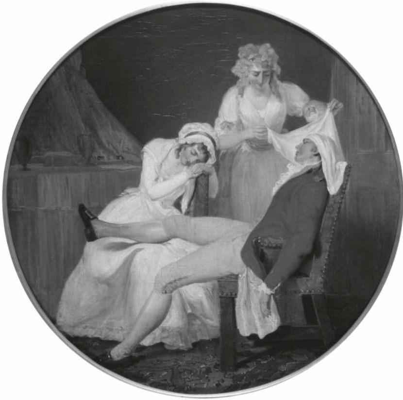
5. Francis Wheatley, Lady Easy's Steinkirk: A Scene from "The Careless Husband" by Colley Cibber (Act V, Sc. 5) (late eighteenth century).

its more masculine companions, Cibber prevents us from reading it as a clear or stable signifier, whether of femininity or of a nonnormative sexuality.