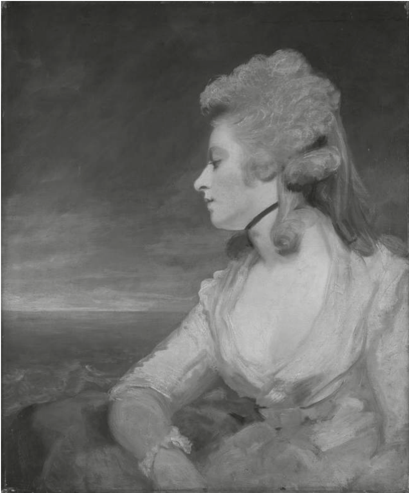
13. Sir Joshua Reynolds, Contemplation (1784).