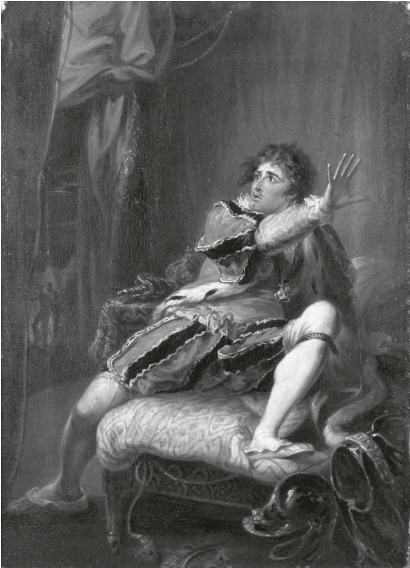
3. William Hamilton, John Phillip Kemble as Richard III (1790).