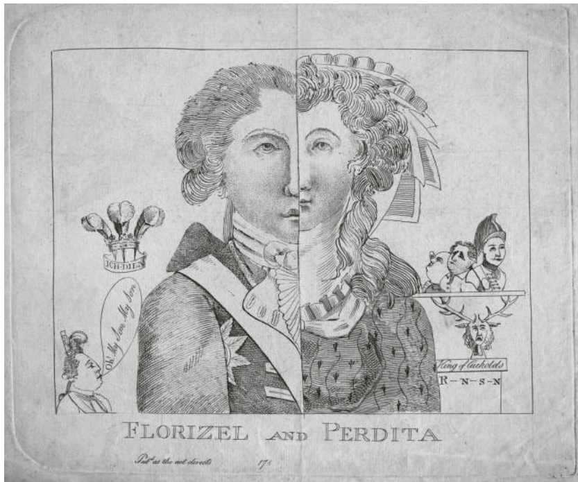
14. Florizel and Perdita (1783).

image of King George III, shouting “Oh! My Son My Son!” To the right of Robinson is a pedestal labeled “ King of Cuckolds ” and holding a bust of the actress’s husband, crowned with horns. The horns balance what looks like another pedestal or a platter holding the busts of three men also rumored to have had affairs with Mary Robinson: Tarleton, the politician Charles Fox, and Fox’s then-ally in Parliament, Lord North. The heart shape of the joined faces recalls the heart-shaped card that accompanied the prince’s picture and that promised Robinson that her paramour would remain “ Unalterable to my Perdita through life. ” 56 In many ways, then, the caricature allows Robinson’s spectators access to the very secrets that the interruptions in her Memoirs denied them—and ownership of the miniature picture that the prince is said to have given Robinson that night.