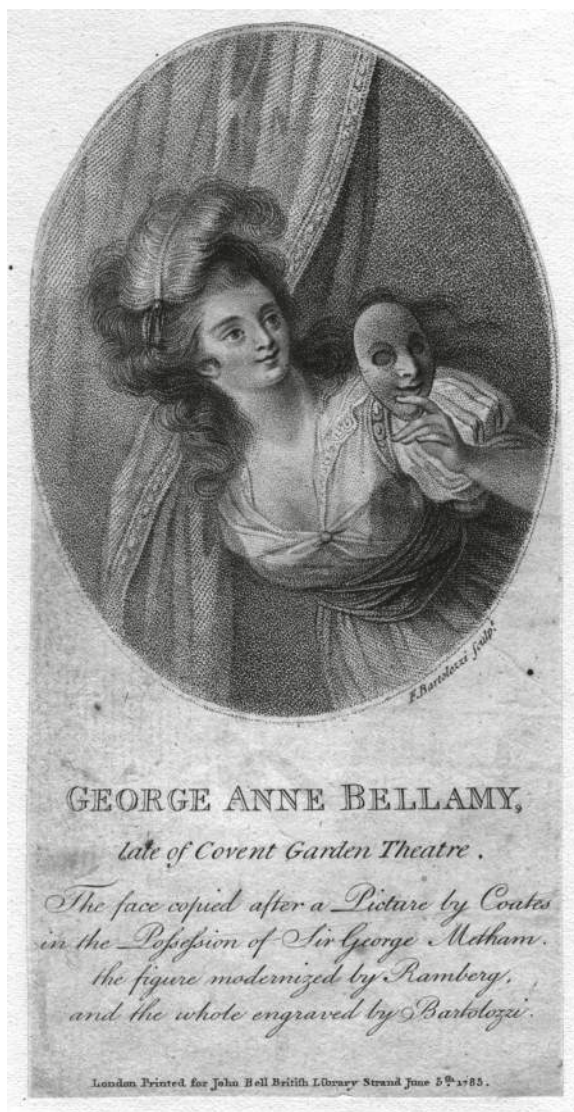
10. Frontispiece to An Apology for the Life of George Anne Bellamy, 4th ed. (1786).