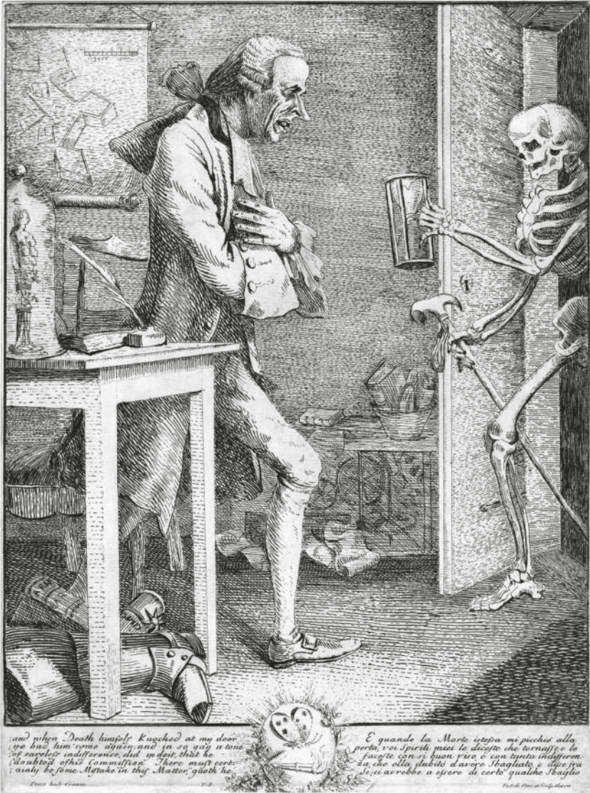
7. Thomas Patch, Sterne and Death (ca. 1768).