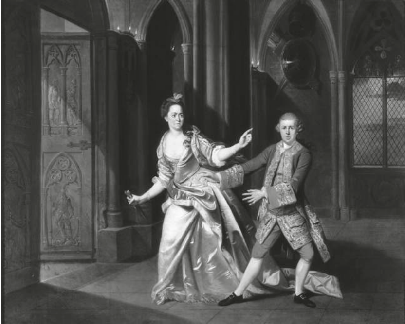
8. Johan Zoffany, David Garrick and Mrs. Pritchard in "Macbeth" (1768).