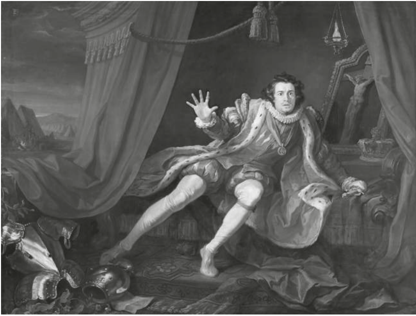
2. William Hogarth, David Garrick as Richard III (ca. 1745). © Courtesy National Museums Liverpool.

the actor head on, leaning on one arm but in a posture that may suggest readiness for battle as easily as it suggests weakness or deformity (figure 2). William Hamilton's later painting of John Phillip Kemble in the role (figure 3) works in much the same way.