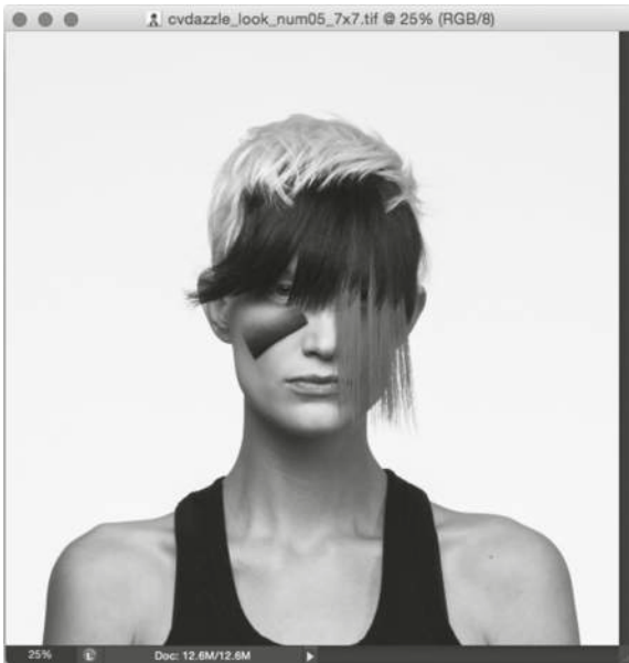
15. CV Dazzle by David Harvey (2010). Used with permission.

that work not by covering a model's face but by making that face appear so freakish as to be illegible to the cameras designed to recognize it (figure 15).