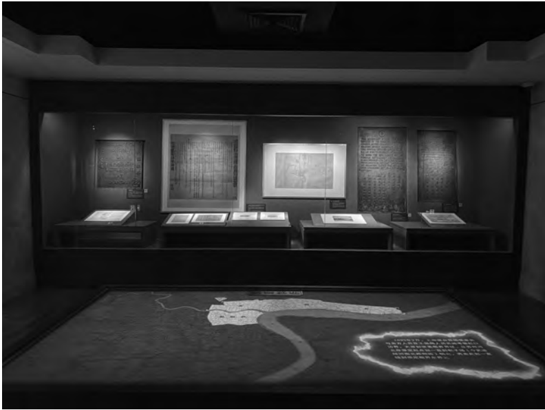
Figure 7.1 Shanghai History Museum, foreign settlements in modern Shanghai, exhibition room, 2021.

In demonstrating the invasive and destructive elements, we took as our starting point the conviction that the nature of colonialism has been to expand modern Western countries by aggressive means, looting the economy, politics, culture, and even territory from colonized countries and cities. As such, we view it as far from glorious. In Shanghai, Western colonial rulers took political control of the residents within the concessions through institutions including the Municipal Council (工部局), Shanghai Volunteer Corps (万国商团), Patrol House (巡捕房), Mixed Court (会审公廨(法庭)), and Customs (海关). These institutions were involved in severe violations of Chinese rights and made the concessions in Shanghai akin to 'nations within a nation'. Western colonial rulers controlled Shanghai's economy and benefited from raw materials, investment, and cheap labour. The exhibition at the Shanghai History Museum therefore reflects coercive aspects of colonialism, exemplified by Shanghai having been forced to open as a trading port, forced to establish concessions (see Figure 7.1), forced to be involved in unfair