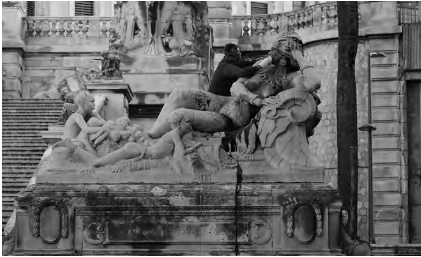
Figure 12.4 Mohammed Laouli, Les Sculptures N'Étaient Pas Blanches , 2020, video. Copyright Mohammed Laouli/ECHOES.

Mohammed Laouli: In Ex-Voto , I had made marble plaques on which I said, 'Thank you for colonization'. There, I am taking care of the colony. I am giving thanks. In Ex-Voto , I was starting from colonial facts and events such as the Berlin Conference. I found it interesting to make a Catholic ex-voto from a marble plaque. 9 It was conscious and intentional. There is an irony. A bitterness. There is the balance of power: you (the colonizer) consider me weak. I am the dominated one. So, I let you believe that you dominate me.