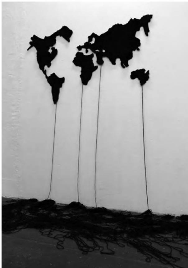
Figure 12.1 Badr El Hammami, Sans titre , 2012, wool, 180 x 140 cm, view of the exhibition Vie privée et familiale , Espace 29, Bordeaux, France, 2012.

Badr El Hammami: The installation Sans titre (2012) is made with wool and represents a world map. I chose to let the rest of the wool threads fall and