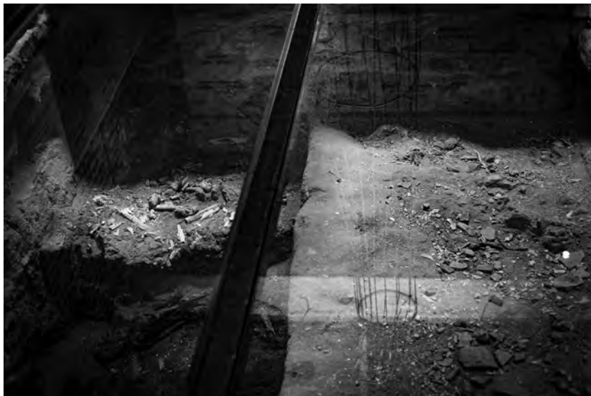
Figure 9.3 Pretos Novos Cemetery on 10 January 2021. Detail of the archaeological showcase displaying buried bodies.