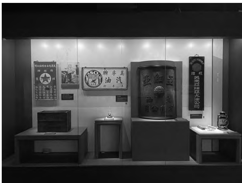
Figure 7.2 Shanghai History Museum, foreign business in modern Shanghai, exhibition room, 2021.

Western countries subsequently opened factories in Shanghai. By 1894, they had already set up 45 factories, including eight shipbuilding plants, six textile mills, and seven printing and packaging factories, which opened the doors to modern industrial development in Shanghai and provided employment for a growing community of industrial workers. Taken together, the opening of foreign banks, insurance companies, and securities companies facilitated the rise of Shanghai's financial industry. Driven and stimulated by the demands of Western capital, Chinese-funded industries, commerce, and finance also gradually emerged.