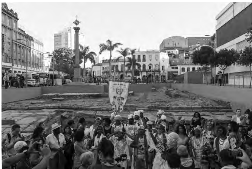
Figure 9.1 Valongo Wharf. World Heritage dossier submission ceremony on 10 July 2017.