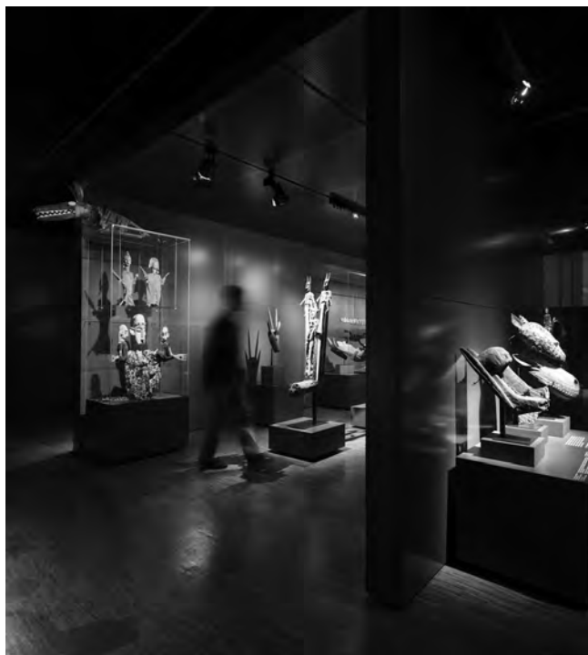
Figure 4.2 General view of African exhibition at National Museum of Ethnology. Courtesy of Fernando Guerra | FG+SG, 2014.

places of speech as possible, reflecting the diversity of protagonists it has had and that truth is neither singular nor unique. As Severo puts it: