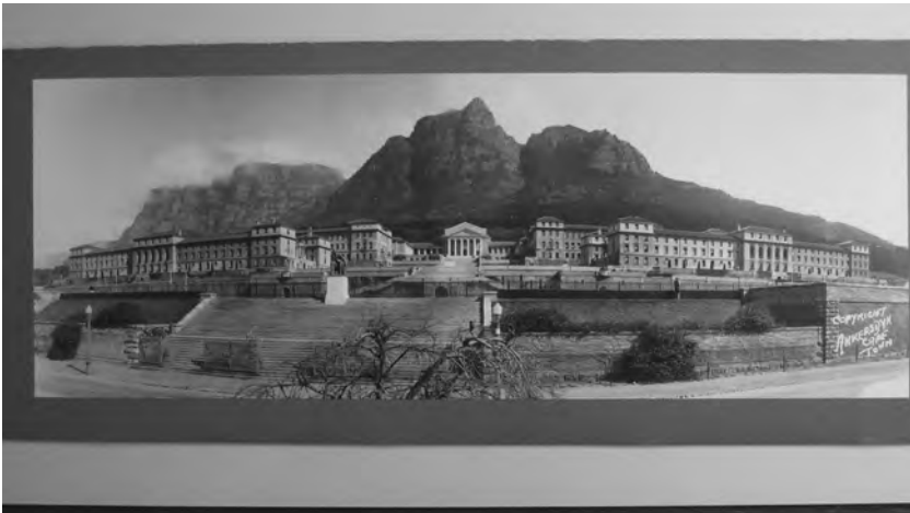
Figure 3.3 The University of Cape Town, with the Rhodes statue in its original position, slightly further down the slope. In the background, Devil's Peak.