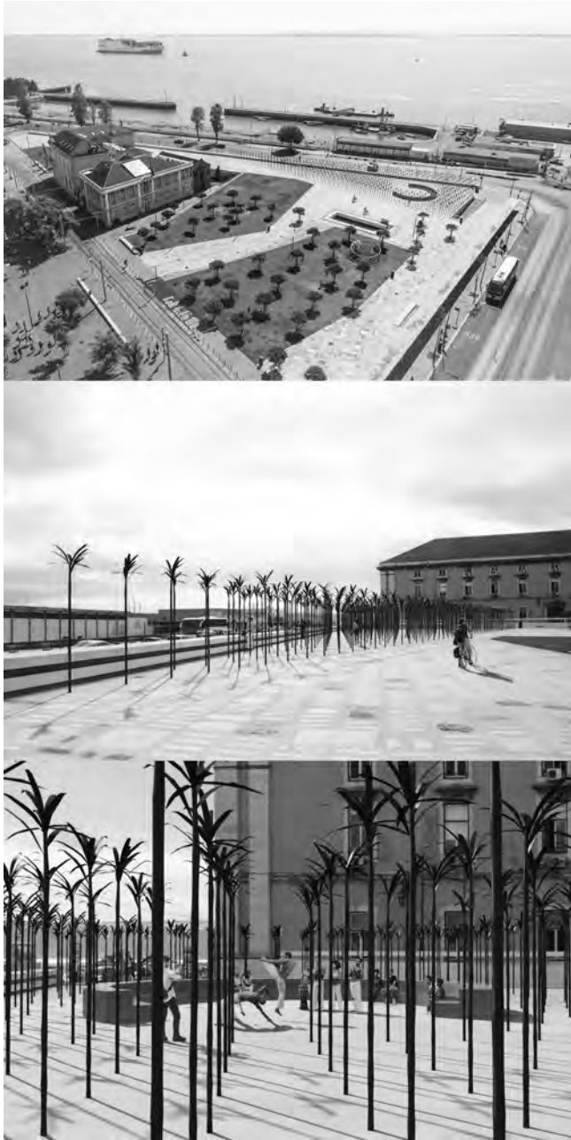
Figure 4.1 Memorial to Enslaved People, 3D model pictures: general view, detailed view, memorial future uses.