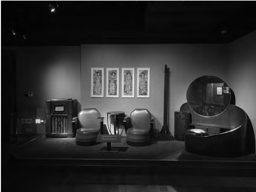
Figure 7.3 Shanghai History Museum, Art Deco furniture in modern Shanghai, exhibition room, 2021.

During these years, a diverse society comprised Chinese and foreigners of many nationalities expanded, influencing fashion, food, and forms of housing alongside language and other customs. This generated a new social scene in which local Chinese and Westerners mixed and old and new trends coexisted. Shanghai not only had a reputation for being the showcase of world-class buildings but also could claim to be the Chinese birthplace of Western-style clothing, Shanghai-style language, and a Western-influenced culinary culture (Figure 7.3).