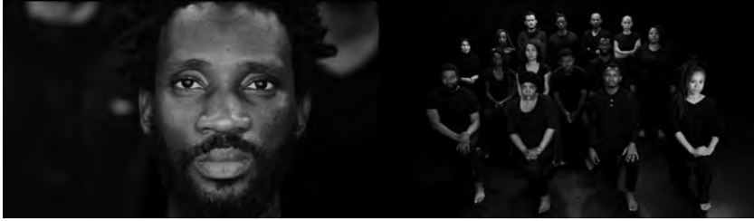
Figure 14.1 The Gaze , Jeannette Ehlers (2018). All performers are looking back at the hegemonic gaze to draw it into the field of vision. Film still from The Gaze . The image is acquired through VISDA, Visual Rights Denmark in 2021.

gaze. Either they are a visible protest against the inclination of the white gaze to ostracize, marginalize and subjugate the race-gender-religious-ethnic others who are performing the kneeling gesture. Or they are a direct challenge to this white gaze by simply looking back, dragging the gaze into the field of vision, thus being excluded from a safe space of voyeurism. In this way, the white gaze is doubly decolonized: through collective protests by black subjects claiming the right to visibility and exerting the right to challenge the dominance of the white gaze. The Gaze is also curated as an interactive work, with refugee asylum seekers from the infamous Danish deportation centre Sjølsmark as performers. In this way, the work is embodied by implicated subjects that take part in the distributed decolonizing enunciation of the whole work.