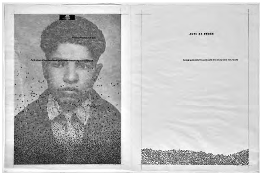
Figure 10.1 I have the pleasure... Drawing in black ink and soft pencil 0.05 mm on tissue paper, photograph. Papiers de soi(e) series. Format 50 x 32.9 cm, 2017.

what made my parents come to this country where they were neither awaited nor wanted. Thus, the method put to use here is (auto-)biographical and multi-vocal, presenting the testimonies of different family members whose experiences bear witness to everyday racism—past and present—through their own wordings and framings (Figure 10.1).