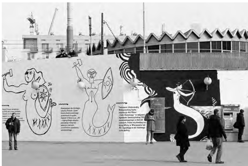
Figure 5.1 Pablo Picasso's Warsaw mermaid and Karol Radziszewski's Syren , reproductions next to Warsaw's central Metro underground station, as part of a large-scale mural advertisement of the Syrena herbem twym zwodnicza ( The beguiling siren is the crest ) exhibition at the Museum of Modern Art in Warsaw, March 2017.