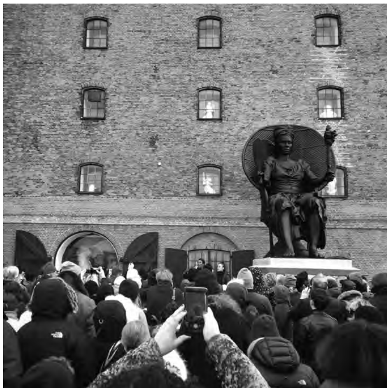
Figure 15.1 Inauguration of I Am Queen Mary by the former West India Warehouse, Copenhagen. Courtesy of La Vaughn Belle and Jeannette Ehlers.