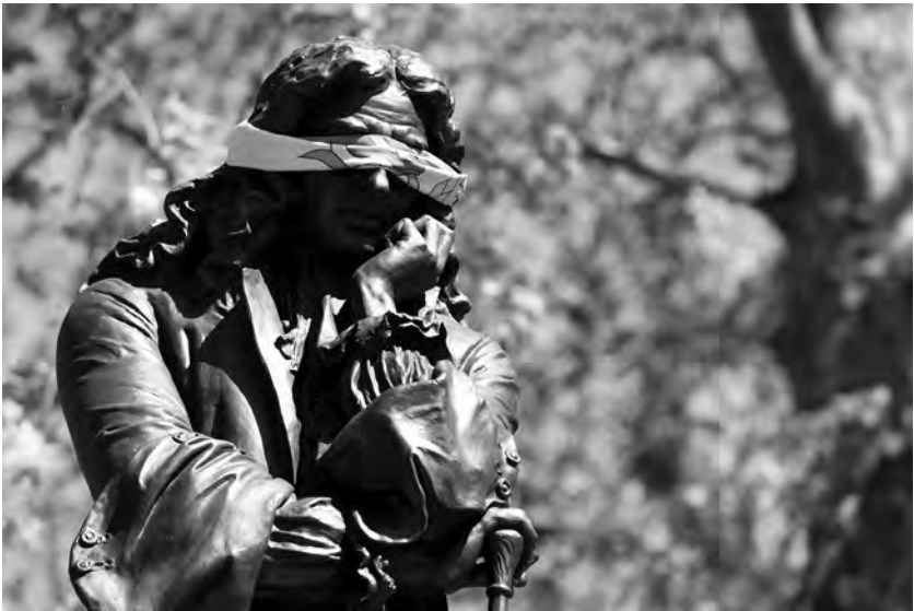
Figure 0.1 The statue of Edward Colston seen with a blindfold, 21 April 2020, in Bristol, United Kingdom.