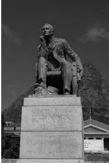
Figure 3.2 Marion Walgate's statue of Rhodes at the University of Cape Town. Photograph by Danie van der Merwe, used under Wikipedia Creative Commons licence. This file is licenced under the Creative Commons Attribution 2.0 Generic licence.

the legacies of colonialism and institutional racism at UCT and the call to 'decolonize' higher education (Nyamnjoh 2013). In the weeks that followed, #RMF protesters marched, picketed and held mass meetings. Numerous protest action focused on the statue itself, which was graffitied, covered over with black plastic bags, and became the site of spontaneous acts of defiance and disrespect. On 20 March, #RMF activists occupied the main administrative building of the university—Bremner Building—site of the Vice-Chancellor's office, which they renamed Azania House. During the occupation of Azania House, volunteers brought meals to the students, who conducted impromptu 'teach-ins'. It was during this period that student activists began to articulate the elements of #Fallist thinking. This draws from multiple sources, chief among them historical anticolonial and antiracist thinkers and activists, such as Frantz Fanon and Bantu Steven Biko, contemporary decolonial thinkers, such as Walter D. Mignolo, and feminist theories of intersectionality. At the centre of these different bodies of ideas are notions of race, gender and coloniality. In the years that followed, the student activists who were part of these protests would talk about the solidarity and