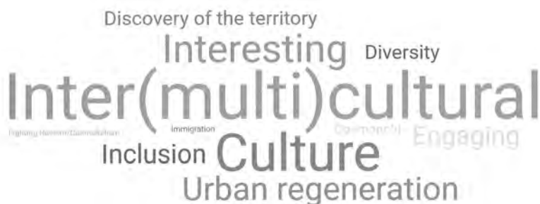
Figure 11.1 Cloud of words to characterize the festival or the relationship of the festival with the city.

Lisbon, makes the event and its manifestation in urban space an interesting phenomenon.