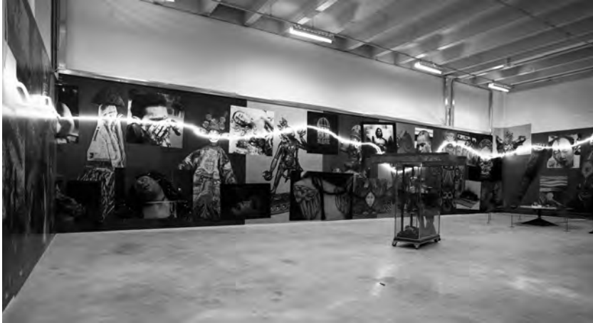
Figure 8.3 Sarkis, La frise des trésors de guerres ( The frieze of war treasures ), 2012, in Intense Proximity , Triennale, Paris, 2012.

of France are also responsible for its emphasis on cultural movement, shown in the way it values the idea of a ‘frontier space’ more than a ‘national space’. Consider the country, France, where La Triennale takes place. It is a ‘national space’ that has broadened or expanded over thousands of kilometres and now touches three oceans—Atlantic, Pacific, and Indian. The movement of this ‘national space’ in terms of ‘a physical place’ as opposed to a ‘frontier space’ that acquires ‘new contaminated morphologies (local, national, geographical, non-national) constantly’ (Enwezor 2011) can be brought to mind perhaps, using this very astute explanation, and considering the specific case of the French Caribbean Islands ( Les Antilles françaises ). In reality, with France’s overseas states (Martinique and Guadeloupe are nearly 7,000 kilometres from France) one can say that the ‘national space’ and the ‘frontier space’ are interchangeable, one and the same. While being completely beyond the border ( hors frontière ) geographically, they are connected politically, socially, and economically by an ongoing colonial history. However, its distinction is evident in a cultural perspective. It is the Creole language that weaves and preserves the links to memory, the history of slavery, the traces of violence and oppression, the poetry, the spoken and written word, the genealogy, the postcolonial, and the Utopia (Zabunyan 2012a, 2012b).