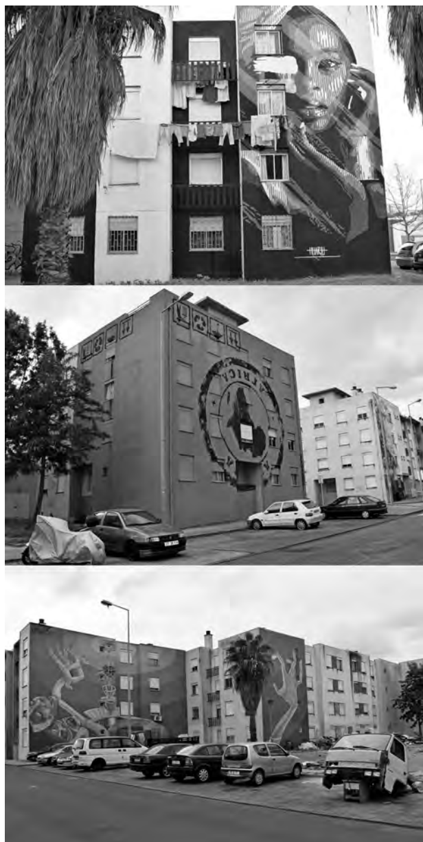
Figure 4.3 Composition of three photos with different works of art and perspectives of the Public Art Gallery at Quinta do Mocho. Picture 1: Reflex of an African Beauty (reflexo da uma beleza africana) by Huarriu (Portuguese artist); Picture 2: Worker Ghetto Box by MTO (French artist) and, on the right, Pop Art by Jo Di Bona (French artist); Picture 3: Untitled , inspired by the creativity of single child, by Utopia (Brazilian artist).