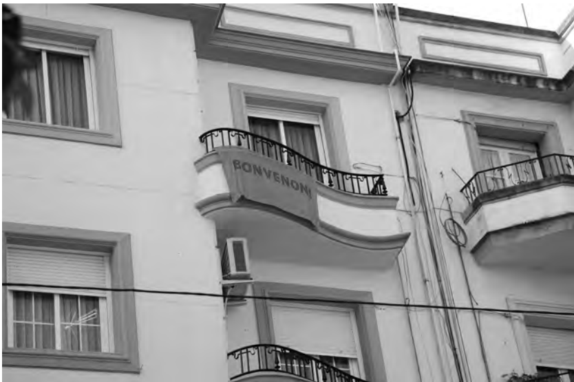
Figure 8.2 Renée Green, Bonvenon! , banner from Climates and Paradoxes , 2005.

Okwui Enwezor’s 2012 exhibition in Paris confirms this leitmotiv with the way he has created vital connections between near and far. The Triennial held at the Palais de Tokyo is entitled Intense Proximity . In the concept paper written in April 2011, one year before the opening of the artistic event, Enwezor brings together the contextual and conceptual approaches behind his vision for la Triennale. By inviting the idea of inhabiting, which becomes a way of thinking about the space one occupies, the distance that separates us from others, the displacement that affects us when existing in a situation in which we are striving to belong, adhering or not to the structures that govern our position as a citizen. The ‘measures of home’ to which Enwezor refers resemble what he first names in all caps, ‘THE BORDERS of France’. ‘THE BORDERS,’ he writes in his statement, ‘are the parts of the territory that present a duality of near and far’ (Enwezor 2011). This ‘near’ and ‘far’ are joined in the project’s title, Intense Proximity , and here one feels its tension. This is mostly due to the fact that it springs from an anecdote, mentioned in the opening paragraph of Enwezor’s piece, about that relatively evil incident of soup containing meat and pork that was distributed by extreme right-wing organizations to the homeless in 2006, and thereby discriminated against certain religions. Intensity could thus also be ‘intrusion’. But the ‘BORDERS’