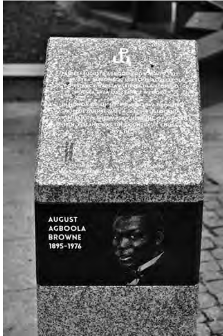
Figure 5.4 The commemorative monolith of August Agboola Browne at the intersection of Stefan 'Wiech' Wiechecki Passage and Chmielna Street, Warsaw.