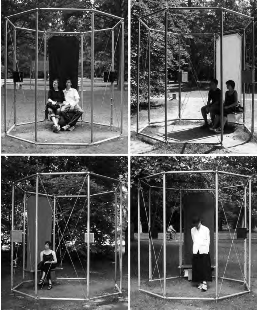
Figure 8.1 Renée Green, Standardized Octogonal Units for Imagined and Existing Systems , 2002, Documenta 11, Auepark, Kassel, 2002.

coexistence of proposals, whether they are plastic or filmic, whether they take the form of performance, installation or more traditional hanging, is a spatial parameter of existence. The curators of Documenta 11 selected 109 artists or collectives, a large majority of whom were from non-Western countries or were of non-Western origin but living in the Western world. It is through the pluriversity of perspectives and with these artists that contemporary political thought has been formed.