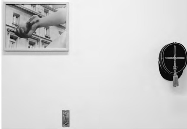
Figure 12.2 Mohammed Laouli, Ex-votos , 2018, Colonial kepi vs pompon (Installation), Untitled (photography) and Necklace (found object), view of the installation in the Friche de la Belle de Mai, Marseille, France.