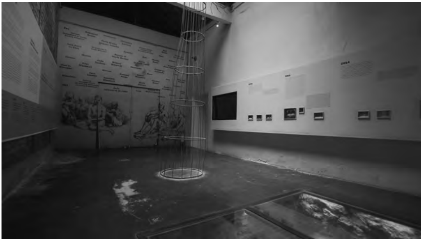
Figure 9.2 Pretos Novos Cemetery on 10 January 2021.