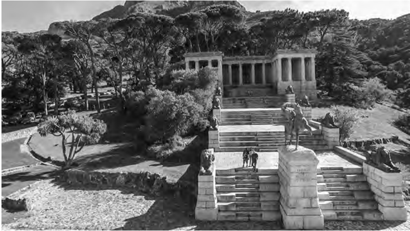
Figure 3.4 Rhodes Memorial, another temple on a hill.

House in designing Rhodes Memorial. Inside the temple is a bust of Rhodes in contemplative pose modelled by the sculptor J. M. Swan. Shortly after the removal of the Rhodes statue from the UCT campus the bust was modified: the nose was sawed off and an attempt was made to decapitate the bust by sawing through the neck from the back. Imposing steps lead down from the temple and form the second element of the design. At the base of the steps is the statue Physical Energy , the work of the Victorian allegorical artist George Watts. It shows an overscale nude male figure on horseback and manages to be both hyper-masculine and kitsch at the same time (Shepherd 2020). A second casting of Physical Energy now stands in Kensington gardens in London. A third replica was cast in 1957 for the British South Africa Company and unveiled by the Queen Mother in Lusaka, in the then Northern Rhodesia, in 1960. Following the independence of Zambia, a few years later it was taken to the Department of Antiquities in Salisbury, Southern Rhodesia (Harare, Zimbabwe) (Maylam 2002).