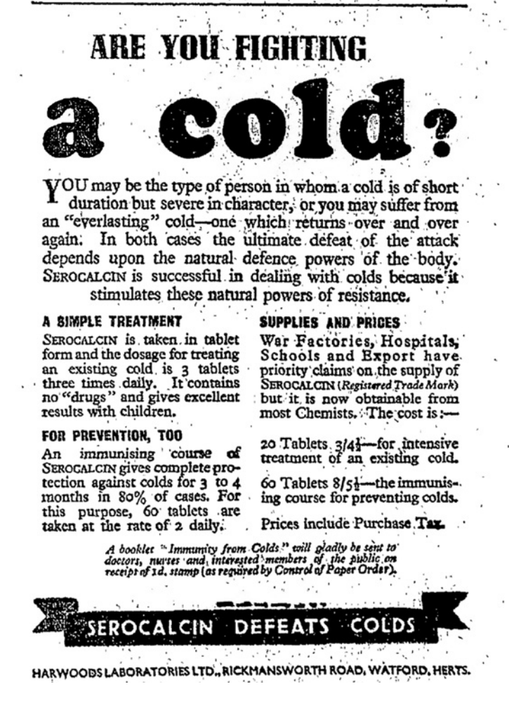
1.2 Advertisement from the Yorkshire Post (13 February 1943)

informed and thoughtful section of the community'. The enquiry was also to look at 'the patent medicine trade', where both the terms 'patent' and 'trade' would have been pejorative.<sup>77</sup> Among those consulted, 70 per cent said they were opposed to the patent trade, though it is clear from this and other surveys that many of these were taking patent medicines.<sup>78</sup> One complicating factor was