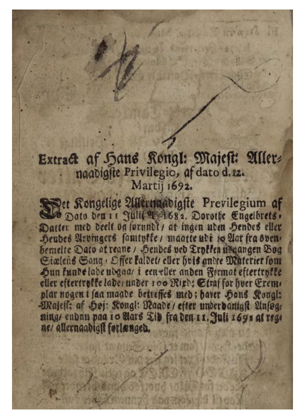
FIGURE 4.2 The Royal Letter allowing Dorothe to have a copyright on her work, 1682, revised 1692. The Norwegian National Library's digitized editions of Dorothe Engelbretsdatter's books, 1706 edition.

Interestingly, she uses the same argument Virginia Woolf based A Room of One's Own on around 250 years later: financial security is the key to the creative process. The King holds "my key to poetry/to open or lock". When he was graceful, "the rhyme-bag sprung open where before it was dormant". Like Woolf, Engelbretsdatter needs a certain sum of money and a room of her own: "The Ink-brush demands quiet".<sup>70</sup> She explicitly does not expect affluence, just