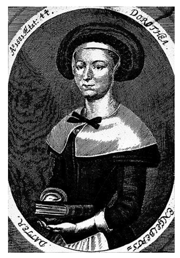
FIGURE 4.1 Portrait of Dorothe, 1681.

the Biblical material from a different angle. Her emphasis is not on the sinfulness of the prostitute at the feet of Jesus, which tended to fascinate the male authors, but instead on her redemption.<sup>10</sup>