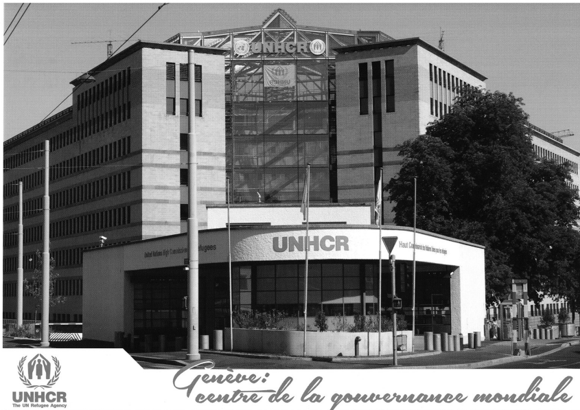
Figure 0.3 UNHCR headquarters in Geneva.