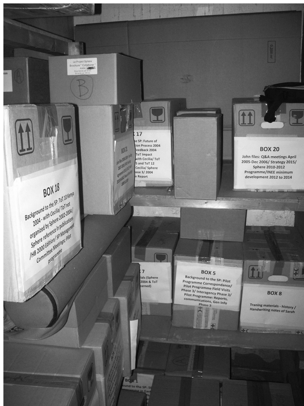
Figure 0.2 Sphere Archive in Geneva.