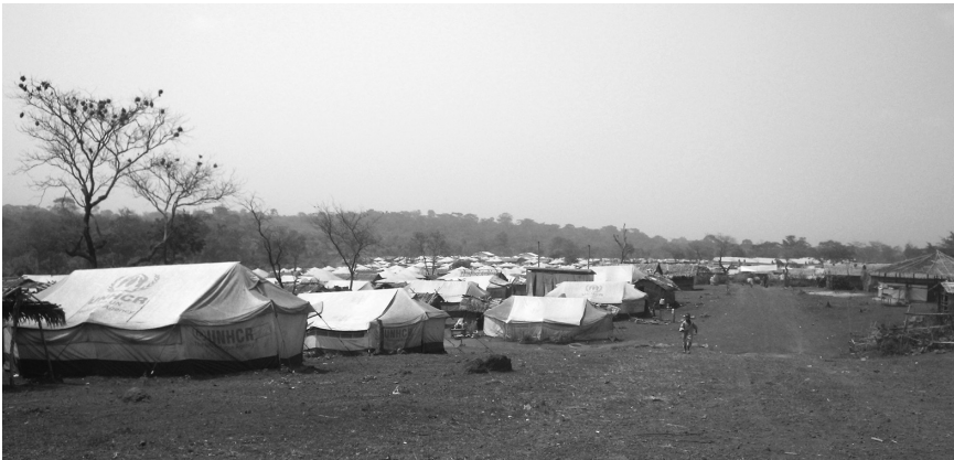
Figure 0.1 Lolo refugee camps in East Cameroon, 2014.

The third chapter adds a materialist dimension to the argument of the book. It explores a tool for the determination of acute malnutrition – MUAC (mid-upper arm circumference) tape. MUAC tape has become a signature tool in humanitarian aid: It is used to screen children, to map emergencies, and to prioritize interventions. This tool allows for exploration of the questions of triage, the medicalization of the definition of needs, the role of statistics in humanitarian controversies, and the iconic role of hunger in the moral economy of aid. Thus, this measuring tool is emblematic of a range of industrialized items used by the humanitarian apparatus (tents, food rations, kitchen sets, etc.) that entail a solidified definition of human needs and shape everyday humanitarian practices.