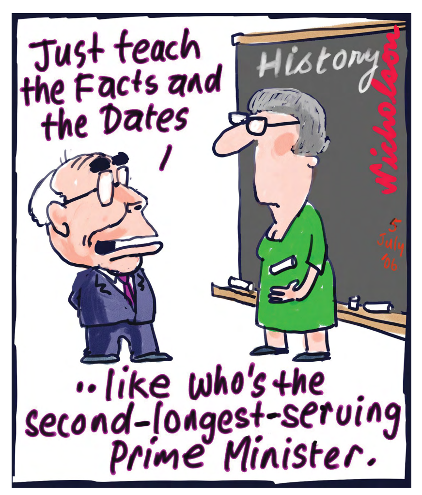
Figure 9. John Howard on history, facts and dates, 5 July 2006.

Source. © Peter Nicholson (Rubbery Figures Pty Ltd) 2006 (nicholsoncartoons.com.au/). Reproduced with permission.