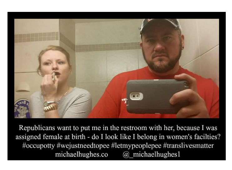
FIGURE 5.1 Tweet by Michael Hughes, used by permission.