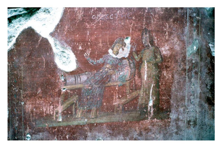
Figure 1: Mural fresco from the Terrace Houses in Ephesus.

Όρ. πόθεν ποτ ἦλθον δεῦρο; πῶς δ' ἀφικόμην; ἀμνημονῶ γάρ, τῶν πρὶν ἀπολειφθεὶς φρενῶν.