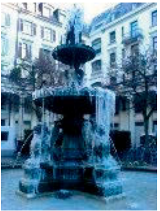
Figure 4: The picture on the left was explicitly taken for the research with the research participant's smartphone. The picture on the right is from another research participant's photo archive. (Publication permitted by research participants.)

of a colleague of mine, whose work ran parallel to my own in a project concerned with the use of public parks by youths (Landolt 2011), did not seem to work as well in this project. Even considering that factors such as age or technological skills and affinities may have played a role in some cases in which interviewees were reluctant to take pictures, the pattern of selecting images from archives rather than taking them in material everyday spaces was too prevalent to be explained by these reservations alone. At first, I doubted my communication skills, but upon closer inspection, the narratives delivered about the images suggested that the alleged misinterpretations of the task were in fact deliberate. The original task was overruled by the relevance of imagined spaces in interviewees' everyday lives - distant places and people, and past times -, which could not be photographed in the given framework of the research. The urgency to include these imagined spaces in a collection of pictures showing "places important to you in your everyday life" became particularly evident in cases in which pictures of pictures, or pictures of computers (representing cyberspace, especially Skype) were taken. In other words: Participants worked against the grain of the method in order to represent what needed to be represented despite its literal physical absence.