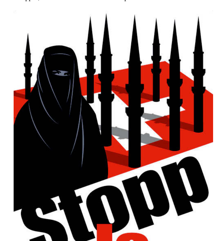
Figure 2: Campaign poster for banning minarets in Switzerland: "Stopp – Ja zum Minarett-Verbot" – "Stop – Yes to the ban on minarets"

widespread campaign posters and could be seen in public spaces all over Switzerland. In the form of black missile-like minaret symbols on the Swiss flag, it depicts Islam as threatening, aggressive, expansive, and territory-grabbing. The main threat, however, is placed in the foreground and comes in the form of the veiled Muslim woman. The figure insinuates that the arrival of Muslim women poses a threat to women's rights in Switzerland, erasing home-made misogyny and fueling generalizing notions of Muslim women as powerless victims of their heteropatriarchal societies.