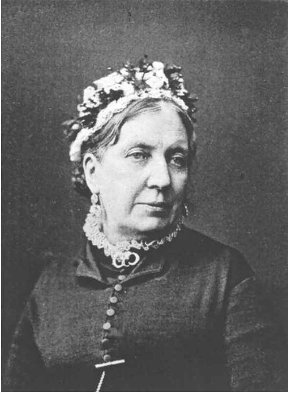
3.1 Portrait Louisa Lowe (1820–1901)

1872/73, parliamentary proceedings from 1877, Lowe's newly discovered memoirs from 1888, and several essays and press reports. 27 The medical files from the asylums and her own notes taken there have survived only in fragments or gone missing altogether. These absent sources – classified reports, intercepted letters and occult messages – have fuelled the disputed discourses of knowledge on Lowe's case ever since. Given the limited sources, going beyond the established paths in telling her story is no easy task, which is yet another argument in favour of a comparative analysis.