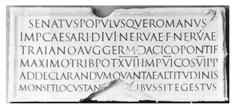
Fig. 1.2 The surviving inscription on the base of Trajan's Column.

Smaller versions of these letters were used when writing books. However, towards the end of the eighth century AD, a simplified version of this alphabet, nowadays known as the "Carolingian minuscule," was introduced across the Holy Roman Empire as a standard handwritten script for rendering the Vulgate Bible in Latin. This incorporated strokes that extended above or below the main body of each letter but