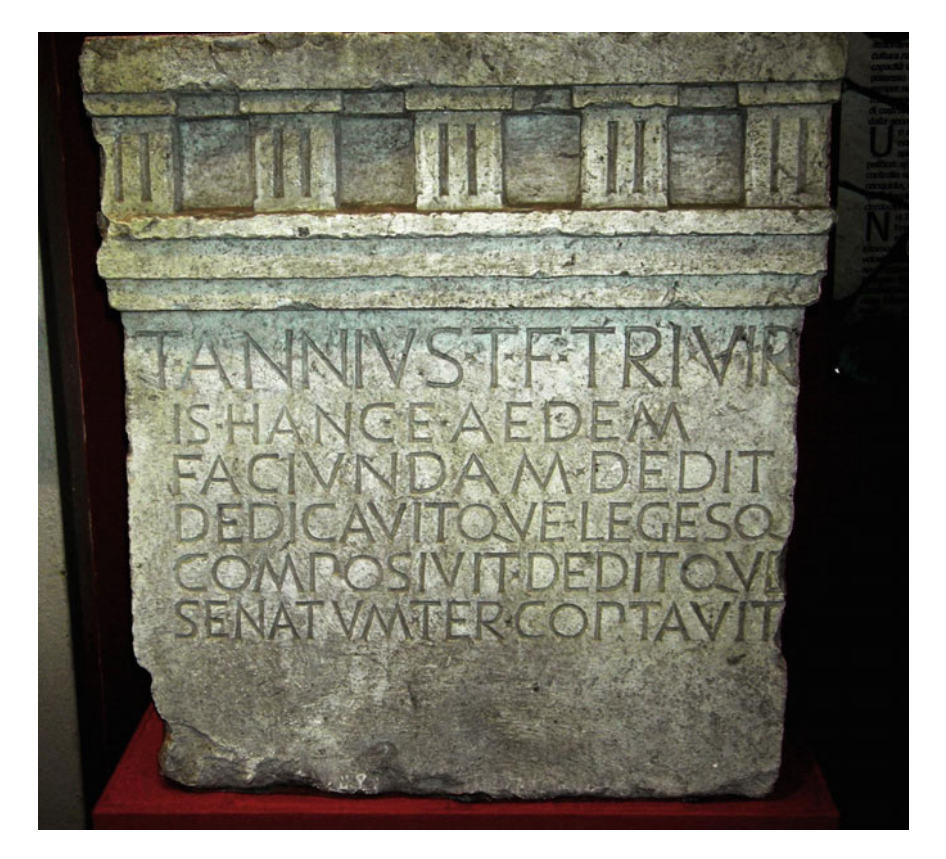
Fig. 1.3 An inscription in honour of Titus Annius Luscus.

Early Greek and Etruscan inscriptions routinely employed a sans serif style (Mosley, 1999, p. 17), and they were widely adopted during the Roman Republic (from 509 to 27 BC) (Bringhurst, 2019, p. 261). In contrast to serif inscriptions, relatively few examples survive today (Lightfoot, 2009), partly because of the poorer quality of the material in which they were inscribed (wood or local stone, rather than marble) and partly because from time to time the Republican authorities discouraged the construction of inscribed monuments. Nevertheless, the National Archeological Museum in Aquileia in north-eastern Italy contains many Republican inscriptions using sans serif capital letters (Clough, 2015), and about 150 of these are displayed in the online Lupa database (http://lupa.at). Figure 1.3 shows an inscription dating from the middle of the second century BC that was discovered in the area of the Roman forum in Aquileia in 1995. It came from a monument (now lost) to Titus Annius Luscus, who was elected as praetor in 156 and consul in 153 BC. Clough