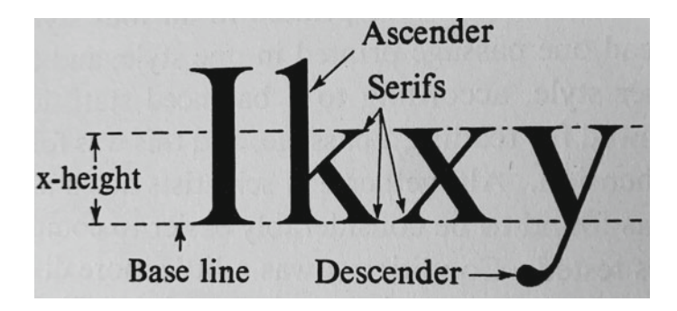
Fig. 2.1 Key concepts in the measurement of typefaces. From Effects of printing types and formats on the comprehension of scientific journals (Applied Psychology Unit Report No. 346), by E. C. Poulton, 1959. UK Medical Research Council, Applied Psychology Unit. Used by kind permission of the Medical Research Council, as part of UK Research and Innovation

of lowercase letters. Some lowercase letters have features that extend above their main parts (e.g., b and d); these are called ascenders . Others have features that extend below their main parts (e.g., p and q); these are called descenders . The x -height of a typeface is the height of lowercase letters that do not have either ascenders or descenders (such as the letter x itself). Finally, the cap -height of a typeface is the height of capital (or uppercase) letters, which may or may not be the same as the height of ascenders. Key concepts in the measurement of typefaces are summarised in Fig. 2.1.