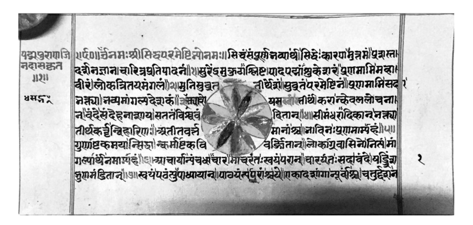
Figure 1.1 Folio 1, Jinadāsa's Padmapurāṇa. Dated to 1855 CE. From the Āmer Śāstra Bhaṇḍāra, Jaipur. Veṣṭan number 4155.