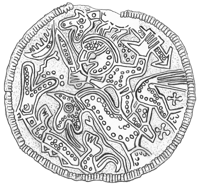
FIGURE 1.2 Bracteate from Gudbrandsdalen, Oppland, Norway [after Hauck 1985, 1,3, 77, 65b], ©2019 Drawing by Nina Zerkich.

times.<sup>98</sup> Surely such occasions often involved ceremony and heroic exposition. If ever we would expect monster stories to have been current in Germanic Europe, it would have been then. To the period of production and circulation of the D-bracteates, therefore, it is possible to look for the origin of the Beowulf poem.<sup>99</sup> Chadwick thought Beowulf derived from "stories … preserved by recitation in a more or less fixed form of words" that were "acquired [by the poet] before the end of the sixth century."<sup>100</sup>