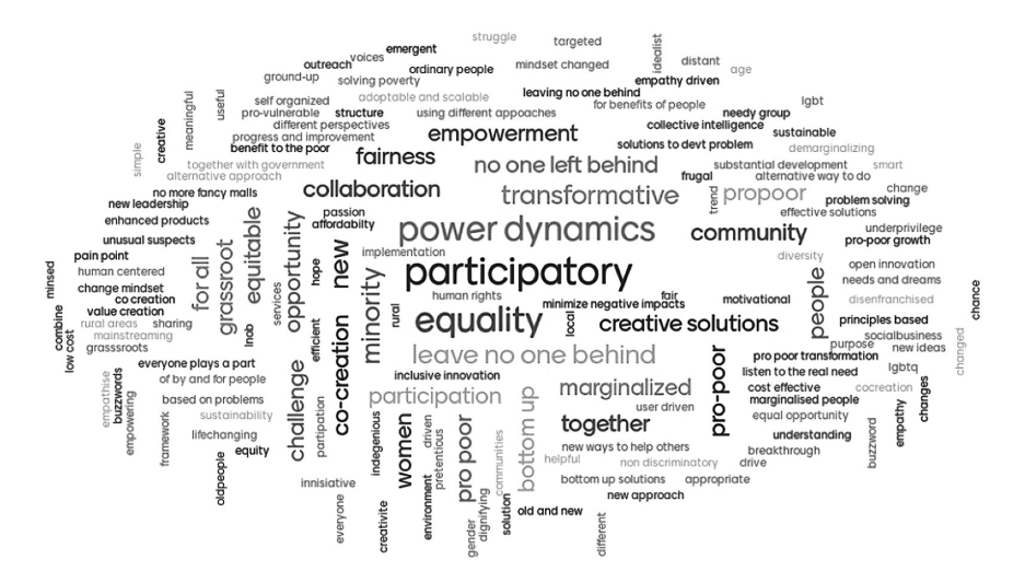
Figure 1.3 ASEAN Symposium (2019) inclusive innovation word cloud

The second question we asked was, "Which of the three dimensions of Inclusive Innovation (direction, participation, or governance) in the framework is most significant in your context?" The follow-up question was, "Why do you think this dimension of inclusive innovation is most significant in your context?" One of the most prominent themes that emerged in the 25 responses received was the idea that inclusive innovation needs to focus on genuinely being inclusive. The understanding of "who" to include focused on the vulnerable and marginalized, those living in poverty, rural farmers, and youth. Several respondents mentioned how important it is to consider power