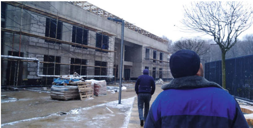
Fig. 5.1 A posrednik is showing around a newly arrived Uzbek migrant his new workplace in a construction site outside Moscow

a deal between migrants and clients or employers. Some posredniks are multifunctional and operate within the labor market, as part of the migrant documentation, legalization and accommodation markets, offering a variety of services such as finding a job for migrants for a specific fee, assisting with buying fake documents or helping migrants with housing issues (Reeves, 2016; Urinboyev & Polese, 2016). These individuals are often experienced migrants, some of whom have already secured Russian citizenship or permanent residence and who have a network of connections in their area of specialization. Some migrants who worked in one place for years and earned their employer's trust can also easily become a posrednik . When there is a need for another migrant worker, posredniks can bring people from their village or people they know in search of jobs to the workplace. In return, posredniks receive a specific proportion of the new workers' salaries on a monthly basis as payment for their services. Some nimble posredniks go further and try to find jobs for other people among their connections. While this is not a regular income for a posrednik , they may occasionally expect additional earnings. Predatory posredniks also operate in the documentation business, individuals whose only income comes from their services (Fig. 5.1).