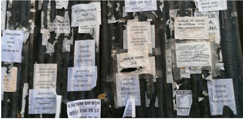
Fig. 3.4 Job and accommodation advertisements targeting Uzbek migrants

turnover of tenants in shared apartments is rather dynamic in the sense that different tenants might rent a place to sleep in bunk beds on different days of the week or even different times of the day. For example, many Uzbek migrants living in other parts of Istanbul, particularly Uzbek female domestic workers who usually get one day off during weekends, come to Kumkapi to socialize, dine at Uzbek cafés, shop and send clothes to Uzbekistan through cargo companies. After which, they usually stay overnight at Kumkapi, paying about US$2 per night for a bed in one of the shared apartments.