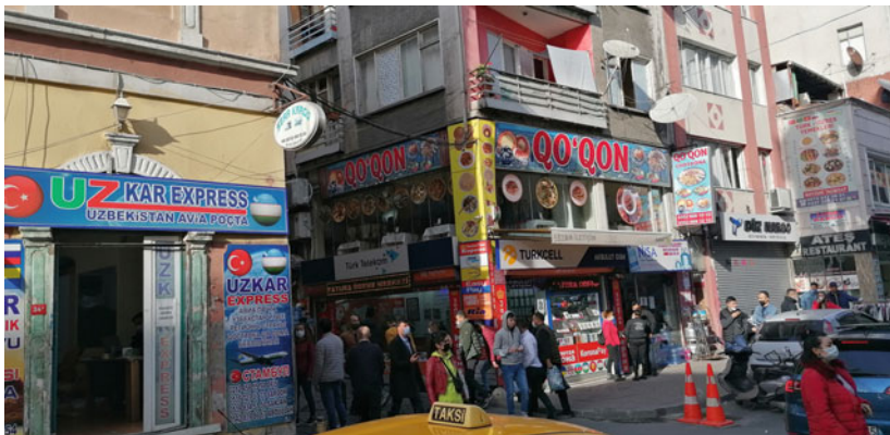
Fig. 3.3 Kumkapi—Uzbek ethnic enclave in Istanbul’s Fatih district

During our fieldwork in Istanbul, we primarily focused on a number of Uzbek migrant hotspots in Kumkapi, where it is possible to find a large number of Uzbeks. Although there are many Uzbek dining places