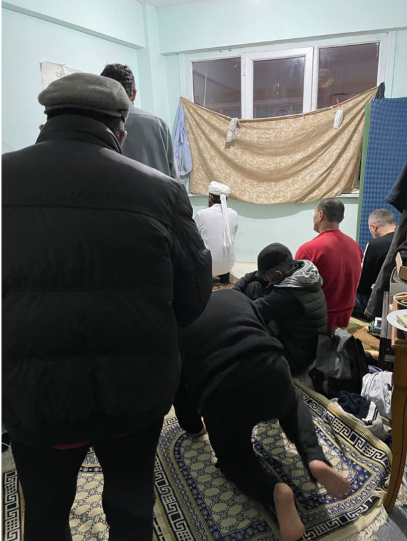
Fig. 3.5 An informal prayer room in Kumkapi where Uzbek migrants pray and get religious healing services