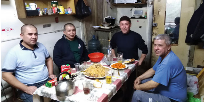
Fig. 3.2 Villagers meet for a plov once a month in a garage turned into a temporary accommodation. Zelenograd, Moscow province

difficult situations. In an effort to avoid social pressures, villagers often try to help members of their family, kinship group or mahalla . 1