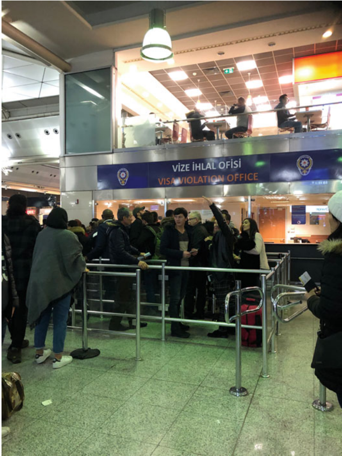
Fig. 4.2 Uzbek migrants are waiting in line to pay visa violation fines at Istanbul Airport

you. But if you pay ceza parasi , you can come back in 15 days. (Mukhtor, male migrant from Uzbekistan, 33)