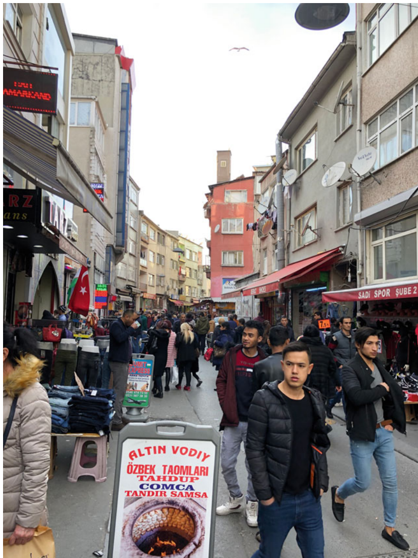
Fig. 1.1 Daily life in Kumkapi – Uzbek Mahalla