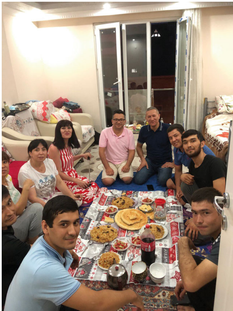
Fig. 1.3 Group interview with Uzbek migrants in Istanbul