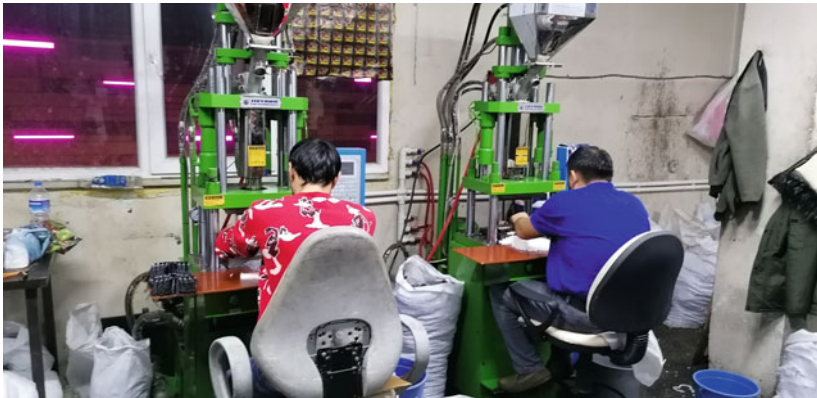
Fig. 5.2 Uzbek migrants in a sweatshop in Istanbul's Bayrampaşa district

It is not rare that difficult working conditions lead to occupational diseases and even accidents. Interviewees in both Russia and Turkey