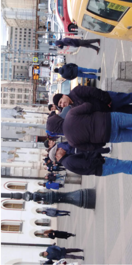
Fig. 4.1 Document intermediaries in Moscow's Kazansky railway station