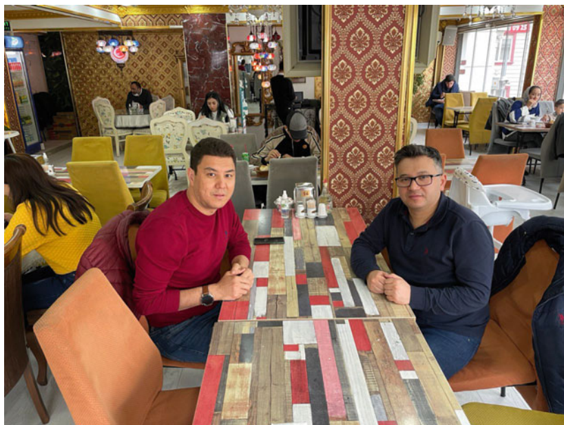
Fig. 1.2 Authors waiting for the arrival of Uzbek migrants (informants) at the O'zbekim restaurant in Kumkapi—one of the key hotspots for Uzbek migrants in Istanbul

In Moscow, we conducted 10 focus group interview discussions and 130 semi-structured interviews with Central Asian (Kyrgyz, Tajik and Uzbek) migrant workers. The interviews and observations were carried out at construction sites, bazaars, dachas (cottages), farms, dormitories, shared apartments, cafés, railway stations and on the streets of Moscow, where Uzbek and other Central Asian migrants work, live and socialize. In Istanbul, we collected rich empirical data through observations, 10 focus group discussions and 85 semi-structured interviews with Central Asian migrants (Kyrgyz, Turkmens, Uzbeks and Uzbeks from northern Afghanistan). Our interviews and observations took place at cafés, bars, shared apartments, sweatshops, hotels, shopping centers and on the streets of Istanbul. Unlike in Moscow where migrants are dispersed across different parts of the city, in Istanbul, Central Asian migrants have their own enclave in the Kumkapi neighborhood. Therefore, as a part