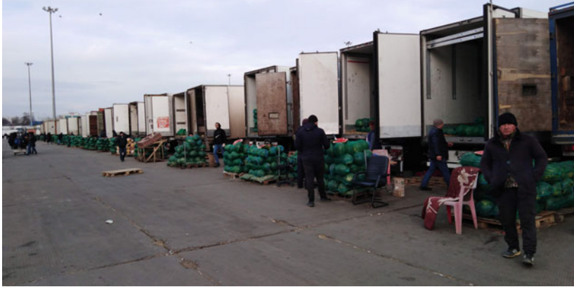
Fig. 3.1 Food City—Moscow’s “little Uzbekistan” where it is possible to spot a large number of Uzbek migrants

migrants in Moscow and their left-behind families in Uzbekistan, there is an everyday information exchange between migrants and villagers. Since most village residents have sons or close relatives working in Russia, daily conversations in migrants’ home villages revolve around the interpersonal relations of migrants in Russia, remittances, deportations and entry bans. One of key features of these social relations is the informal social control exercised by mahallas , local community-based organizations which can be found in all regions of Uzbekistan. As explained earlier, due to the inability of the Uzbek state to provide sufficient employment opportunities and social protection, villagers frequently rely on social safety nets and mutual aid practices that take place within the realm of their family, kinship group and mahalla . Villagers meet one another on a daily basis to discuss and arrange mutual aid practices, which, in turn, produce reciprocity, affection, shared responsibilities and obligations among villagers. These reciprocal relationships produce economic and social interdependency between villagers, generating an expectation that villagers should help and support one another, particularly when they are in vulnerable situations. Thus, social pressure and sanctions can be applied to a village member or their family and kinship group if s/he (or they) is (are) not acting fairly or not helping neighbors or village members who encounter