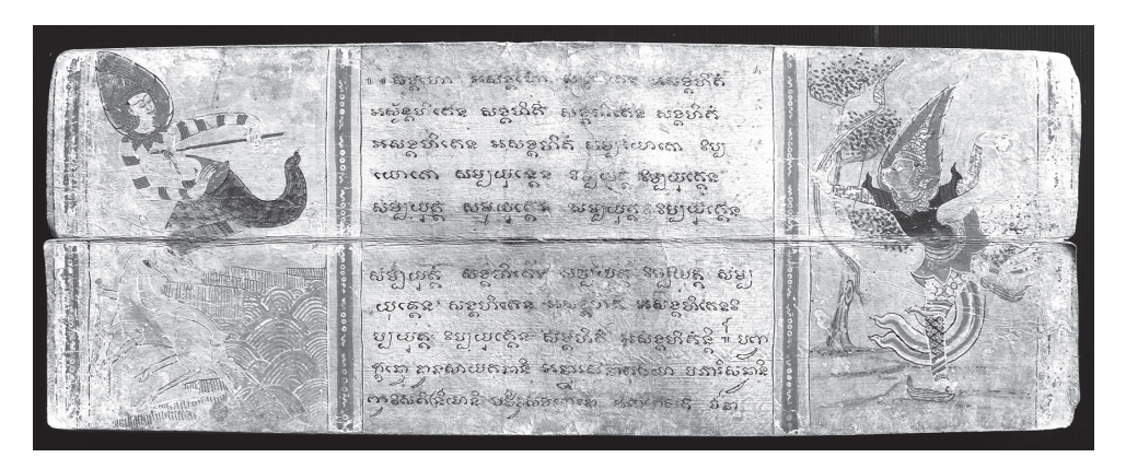
Figure 20.2 Spread of a late eighteenth–early nineteenth-century leporello manuscript held in Wat Khao Yi San, Samut Songkhram province, Thailand. (Wat Museum run jointly with Silpakorn University.) The text displayed here is the Dhātukathā mātikā; the flanking images are of the Suvaṇṇasāma Jātaka.

comments on this type of eighteenth- to nineteenth-century Thai leporello with jātaka imagery is illustrated in the 2008 volume cited earlier with a manuscript now held in the Asian Art Museum of San Francisco; they apply equally to the more modest manuscript of Figure 20.2, still held in a monastery setting. The jātaka paintings appear "in two vertical bands that flank the text. ... The accompanying text is not however that of the jātakas " (Skilling 2008: 72; see also image p. 73). For Skilling (2008: p. 72), this presentation of the jātaka demonstrates that the paintings "exist in their own right, as amplifications of the power and perfections of the Buddha." This is a somewhat strange formulation: they exist in their own right, yet they do so as amplifications of something else. The first clause distinguishes the painted jātaka scenes from mere illustrations of a text; the second affirms that they are nonetheless integral to something greater than themselves. In this description, the manuscript is thoroughly analogous to the monumental stūpa and the anthropomorphic Buddha statue in which the jātaka participate in the iconization of the Dharma.