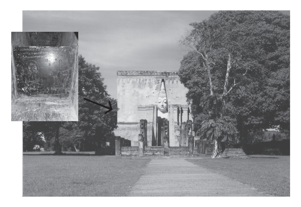
Figure 20.3 Wat Si Chum, Sukhothai, Thailand: mondop preceded by pillared vihāra terrace and one of the one hundred engraved stone jātaka plaques from the staired passageway inside the mondop wall spiraling around the colossal Buddha image. This plaque represents in condensed form the Maghadeva Jātaka; it is pictured here in situ on the ceiling of the passageway inside the mondop's southern wall; the next plaque can be seen above. Mondop photograph by author. Jātaka plaque photograph courtesy Thanaphat Limhasanaikul.

allowed access into the latter. The Wat Si Chum mondop is unusual in the context of other mondop structures at Sukhothai for a number of other reasons including its massive size and relatively unadorned exterior.