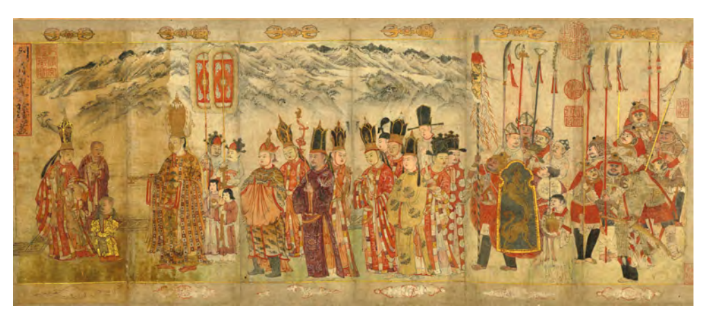
FIGURE 4.2 Duan Zhixing and retinue, Painting of Buddhist Images