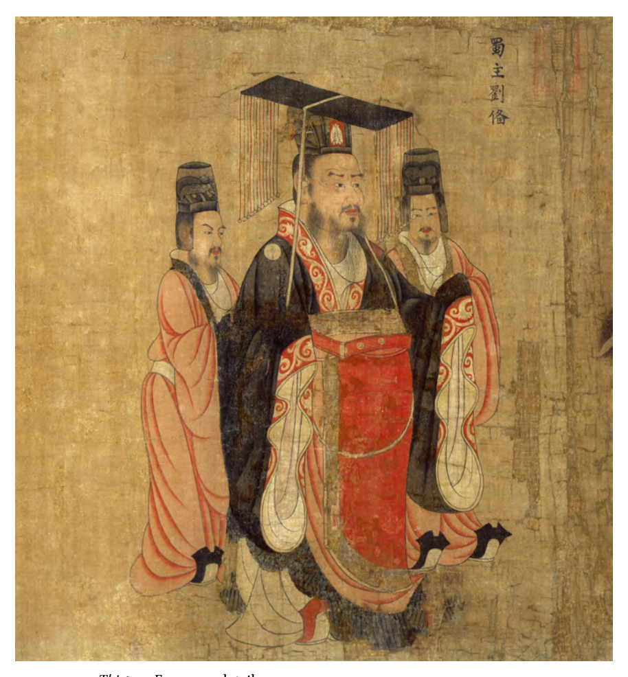
FIGURE 4.6 Thirteen Emperors, detail

\it King 's list, Soper identifies the second from the right as a Chinese ruler based on his attire. ^{72}