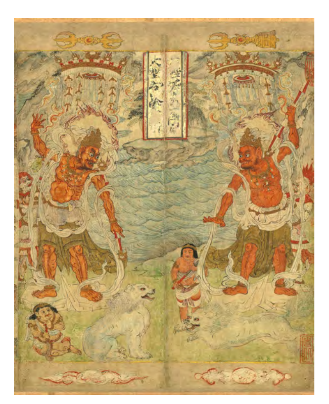
FIGURE 4.3 Vajra beings, Painting of Buddhist Images Collection of the national palace museum