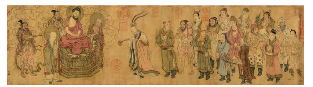
FIGURE 4.7 Image of Barbarian Kings Worshiping the Buddha, detail

imperial status; in the Painting of Buddhist Images , it is Duan Zhixing, and not the Chinese ruler at the end of the painting, who wears these insignia.<sup>73</sup> Another analogous genre is that of foreign dignitaries paying tribute to the Chinese emperor, but this genre emphasizes the exotic animals and goods being offered to the Chinese emperor, elements that do not appear in the Painting of Buddhist Images .<sup>74</sup>