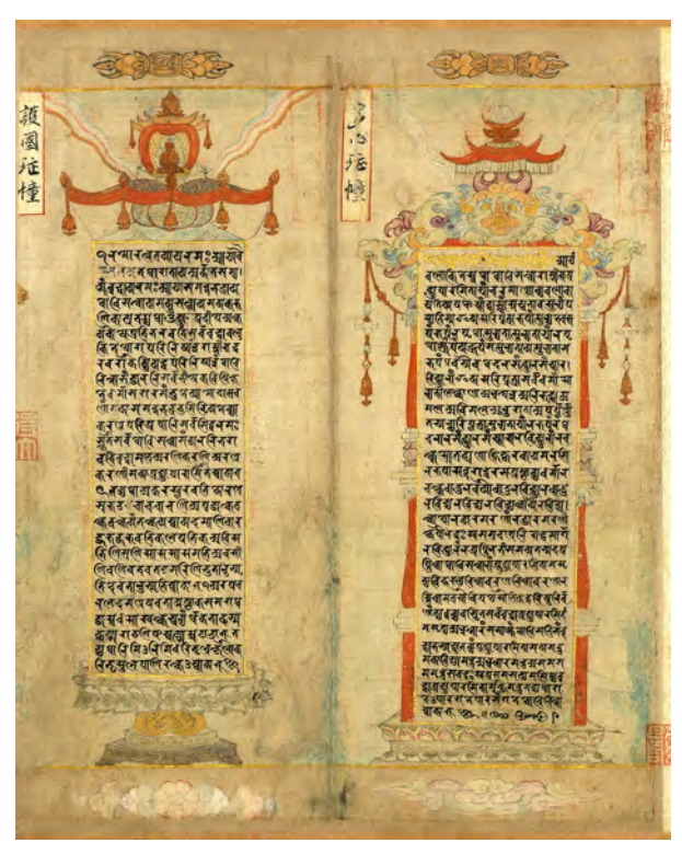
FIGURE 4.5 Dhāraṇī pillars, Painting of Buddhist Images COLLECTION OF THE NATIONAL PALACE MUSEUM

light shines up diagonally from the middle of the stūpa. The text of the dhāraṇī is black, unlike the red lettering used for Sanskrit characters in most Dali manuscripts. I am unaware of any other Sanskrit versions of this dh\bar{a}raṇ\bar{\iota} , making this image (along with the abbreviated version in the Invitation Rituals ) valuable for making sense of its many Sinitic transcriptions. This version closely matches Hatta Yukio's reconstruction, but appears to differ in certain areas. ^{64}