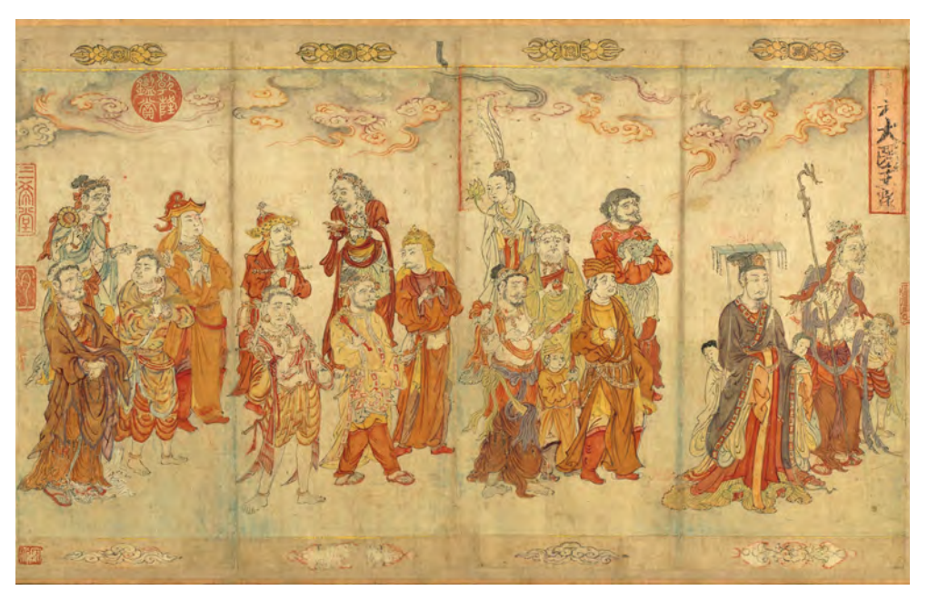
FIGURE 4.4 Kings of Sixteen Great States, Painting of Buddhist Images COLLECTION OF THE NATIONAL PALACE MUSEUM

preceded by two frames, each with a painted dhāraṇī pillar (Figure 4.5): the pillar on the left is the "Precious State-Protection Pillar" ( huguo\,baochuang 護國琦瞳); the one on the right is the "Precious [Prajñāpārami] tā Heart Pillar" ( duo\,xin\,baochuang\, 多心時幢), which features an error-filled Siddham text of the Heart\,S\bar{u}tra.^{61} In addition to these direct references to the Scripture\,for\,Humane\,Kings , several frames depict Nanzhao kings, tutelary deities tied to the Duan family, and cakravartins surrounded by the seven precious things. ^{62}