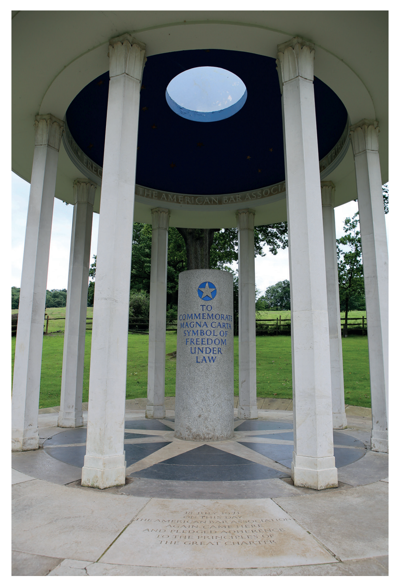
Magna Carta: history, context and influence