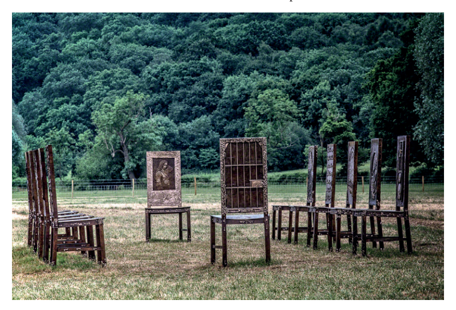
Figure 1.1. 'The Jurors' by Huw Lock at Runnymede, Surrey, commissioned by Surrey County Council and the National Trust to commemorate the 800th anniversary of Magna Carta in 2015. The twelve chairs represent the historical and ongoing struggle for justice and equal rights.

in the previous days of allegedly corrupt officials from the governing body of world football, FIFA. In a country not famed for its devotion to soccer, the American authorities had done what no government in Europe had dared to do despite all the evidence of misappropriation and malfeasance by FIFA officials. Magna Carta had secured the rights of the innocent and mandated due process under the law: many clapped and cheered Lynch for ensuring that the rule of law would extend to the administration of 'the beautiful game' across the world.<sup>8</sup>