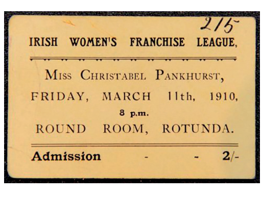
Figure 1. Poster and admission ticket for Christabel Pankhurst's lecture at the Rotunda, Dublin, 11 March 1910 © National Library of Ireland.

in both Irish and more broadly liberal British terms.