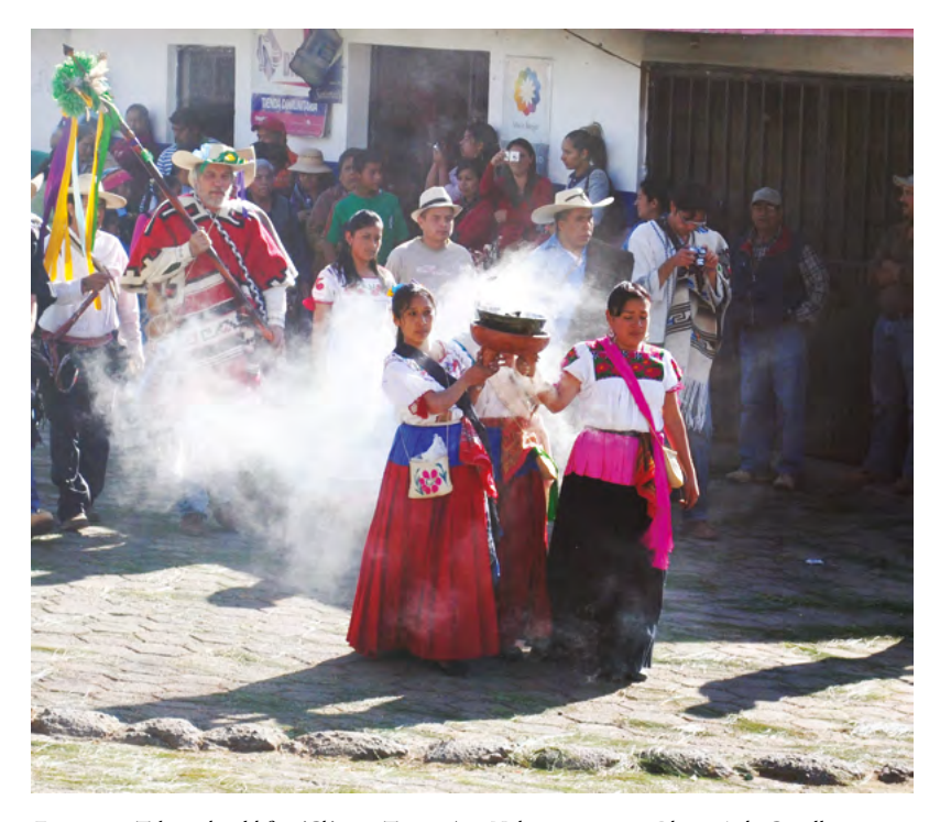
Figure 9.3. Taking the old fire (Ch'upiri Tamapu) to Nahuatzen, 2013.

there is also a popular secular emphasis on ethnic revitalisation and a subaltern critique of the dominant capitalist Western and mestizo Mexican societies.