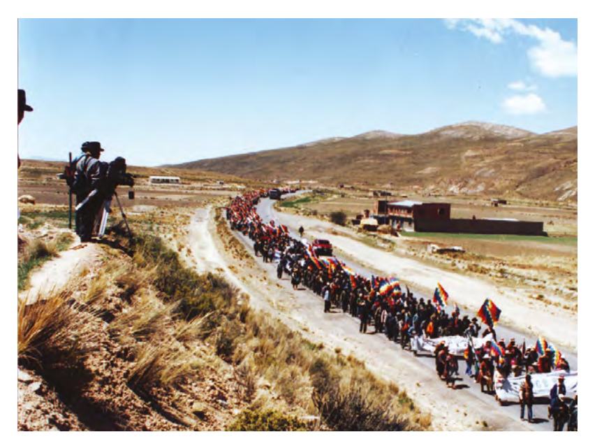
Figure 4.1. CAIB communicators shooting an indigenous march in the Bolivian Highlands, 2003.

After briefly summarising the Plan Nacional's history and method, this chapter will discuss three main aspects of media production: i) the ways in which films resist or reproduce the existing visual repertoire, which often draws on discriminatory or essentialising stereotypes of indigeneity; ii) how indigenous mediamakers emerge as spokespersons, and how their authority is mediated by their interaction with diverse audiences and by distribution politics; and iii) the kinds of tensions these mediamakers experience in relation to issues such as collective authorship, property, status and recognition of their work.