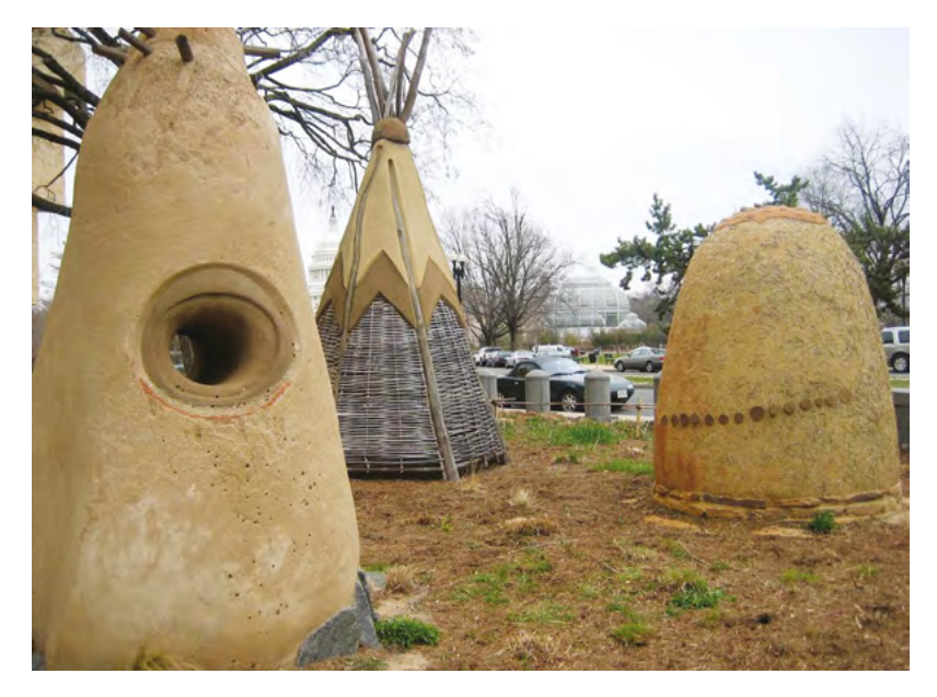
Figure 5.1. View of 'Always Becoming', 2009.