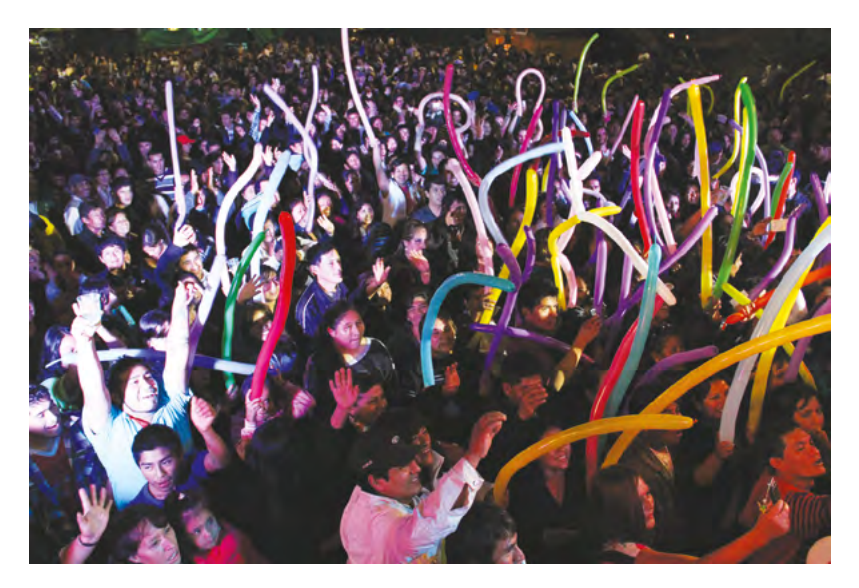
Figure 7.3. Spectators at huayno concert in Chorrillos, Lima, June 2012.