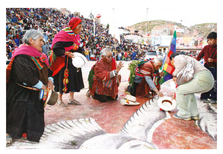
Figure 3.2. Elders performing libation rites on Oruro's main festive stage in preparation for the Anata Andina, 2008.

into a larger sense of community with internal structures and a common origin emerging, particularly among the Aymara.