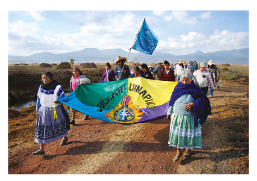
Figure 9.2. P'urhépecha flag on pilgrimage from Xaracuaro to Konguripu 2012.