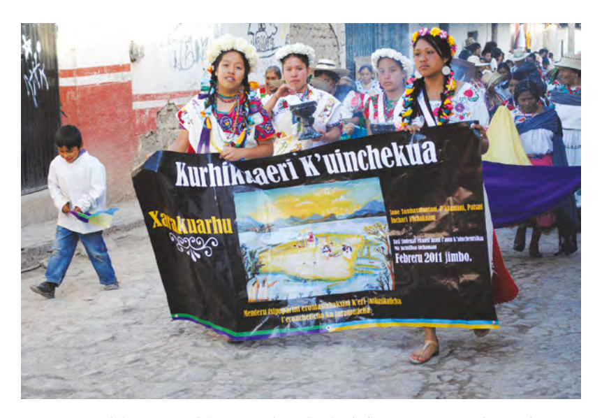
Figure 9.1. Kurhikaueri K'uinchekua – parade on the island of Xaracuaro, 2011.