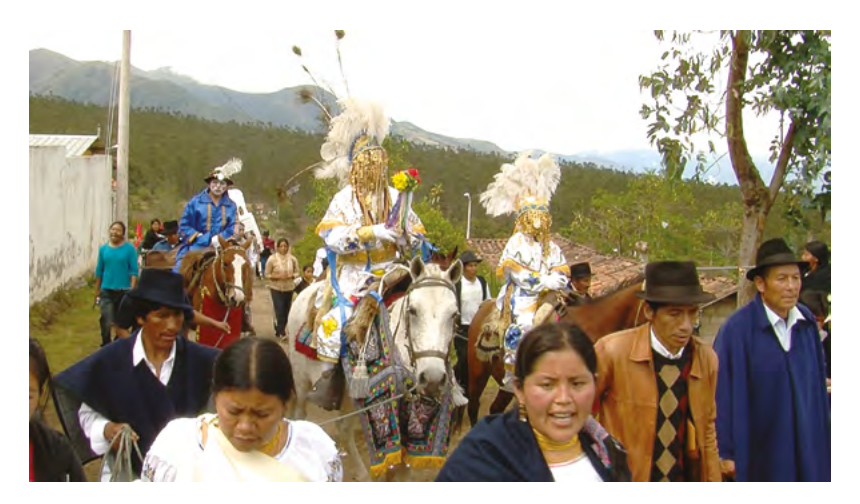
Figure 10.3. The coraza arriving at the community of El Cercado, 25 September 2011.

in the field. In contrast to the non-indígenas in San Rafael, who engaged in brash behaviour, binge drinking and group singing, the indígenas were more subdued, dancing in circles as is traditional and following sharing rituals when drinking.