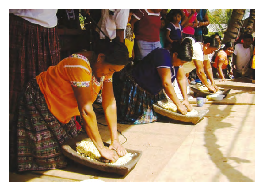
Figure 8.4. Corn-grinding competition - Maya Day 2012.

particularly children and young people, climbed up and crowded together on the stage to get closer to the action (figure 8.4).