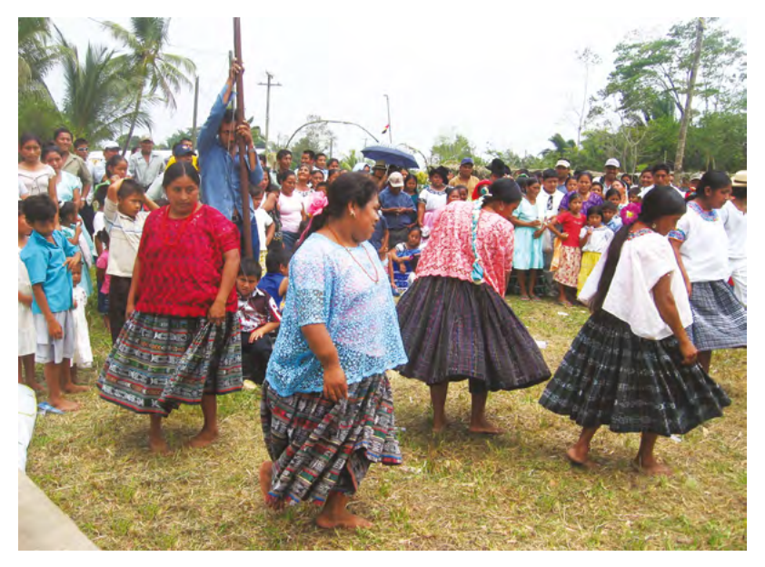
Figure 8.3. Harp dancing competition, Maya Day 2007.

like tortilla-making took place on a low wooden platform placed on the margins of a green field in the middle of TK's school compound. Spectators were able to inspect the competition closely and thus participate quite directly by encouraging and/or criticising the competitors. In the early stages of the festival, even harp dancing competitors performed at ground level (see figure 8.3). Later, in 2009, festival organisers decided to locate the platforms higher up, creating a stage that dominated the main green of the compound and which became a venue for some competitions.