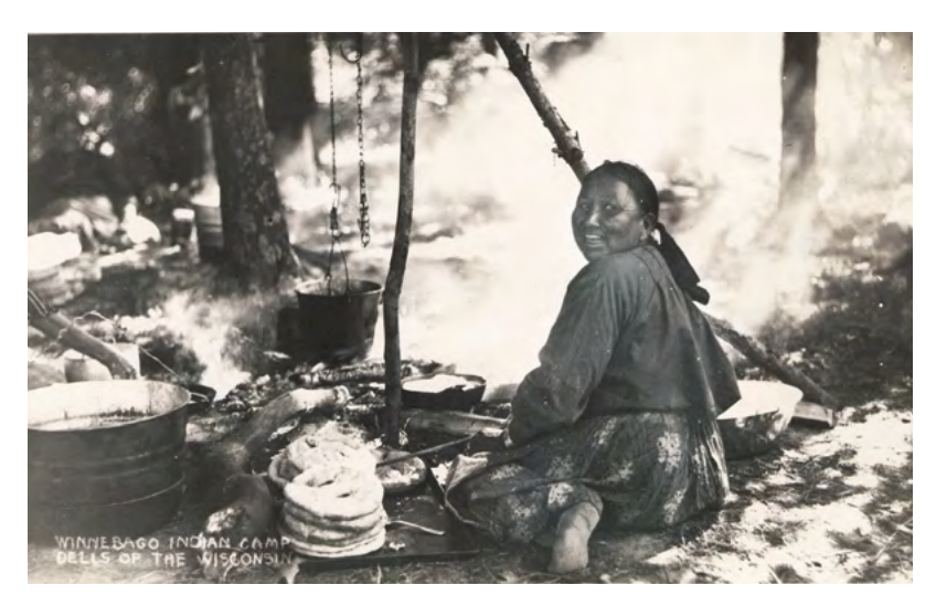
Figure 6.1. H.H. Bennett. 'Winnebago Indian Camp Dells of the Wisconsin'. Postcard c. 1940. Wisconsin State Historical Society Collection.

the early and middle decades of the 20th century. No longer necessary for their ability to reflect reality, postcards became quintessential, dramatically composed, consumable markers of the tourist experience.