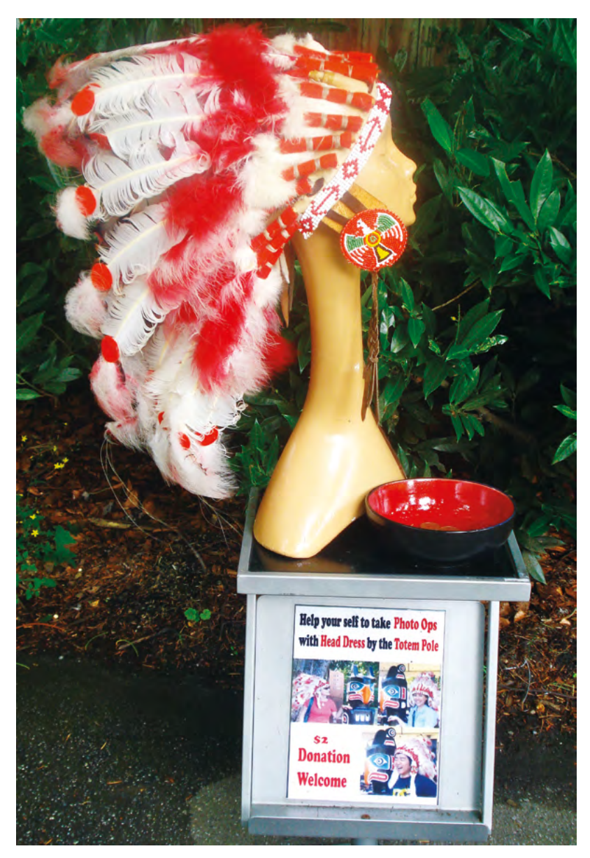
Figure 13.1. 'Indian' headdress at Klahowya Village tourist performance.