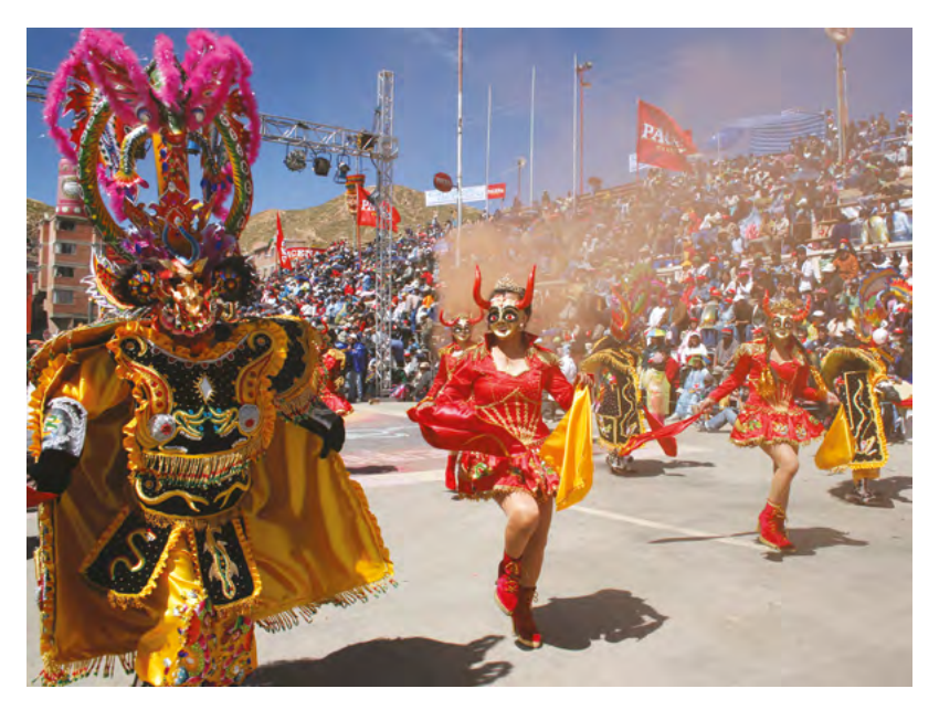
Figure 3.1. Oruro Carnival parade, 2008.

– for a short period of time – transformed from being a quiet trading town, with little resonance in the collective memory of Bolivians, to being a 'centre of national imagination', to borrow Arjun Appadurai's term (2008, p. 212). Oruro has fulfilled this role since 1970, when the city was named the 'capital of folklore' by presidential decree. Subsequently, the Carnival has become the focus of Bolivia's official repertoire of memory and heritage; Bolivians look to the celebration as a way of remembering their past and traditions, and to locate a sense of national identity.