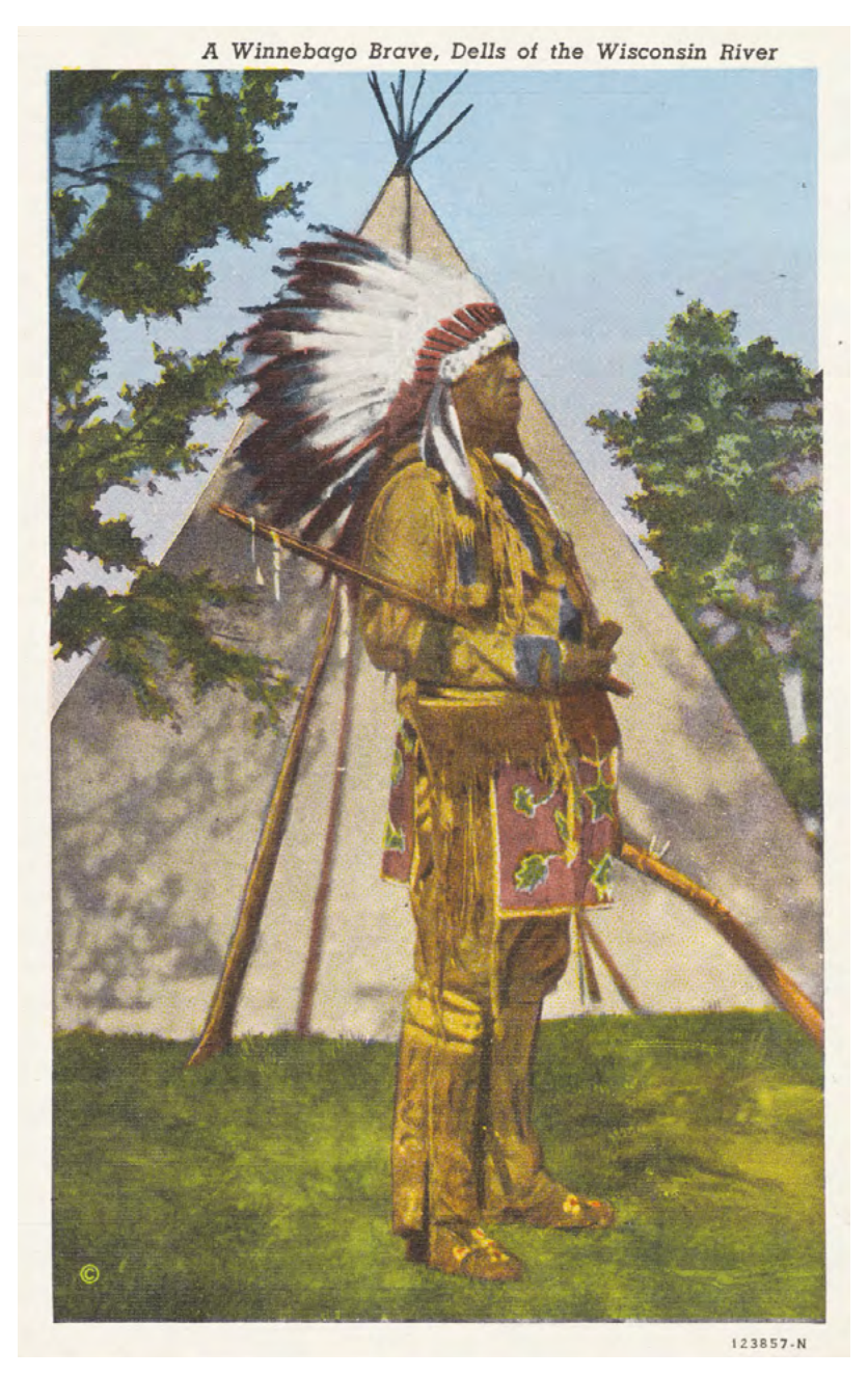
Figure 6.3. 'A Winnebago Brave, Dells of the Wisconsin River'. Postcard c. 1929–30.