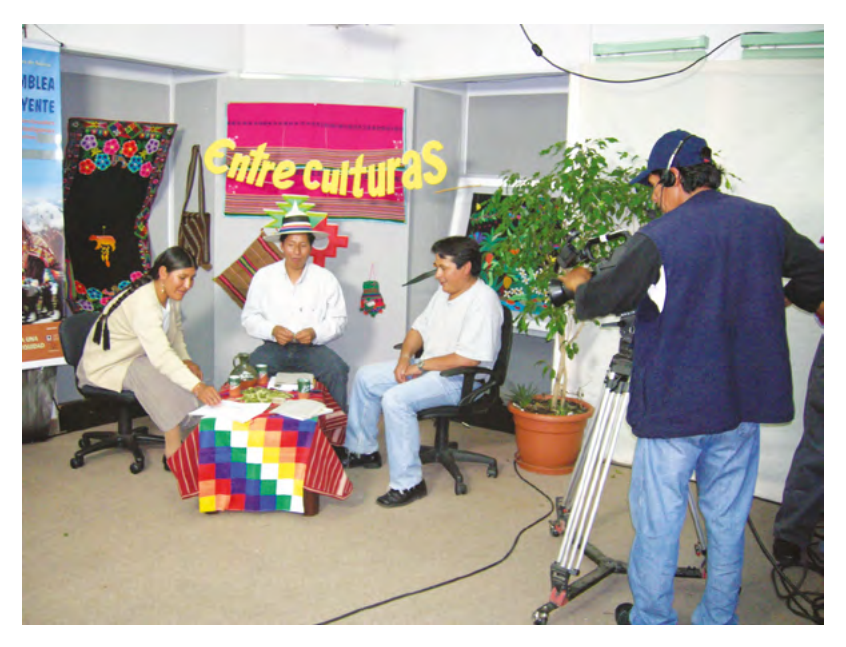
Figure 4.2. Production of Bolivia Constituyente television programme, Sucre, 2006.

mediamakers, organisation representatives, trainers and professionals who participate in the Plan Nacional. The latter's permanent collaboration with national indigenous and peasant confederations, together with the fact that indigenous peoples in Bolivia constitute a demographic majority of over 60 per cent of the population, allows for a unique national scope, unlike other indigenous media projects based in Latin America, such as those developed in Mexico - especially those derived from the Transference of Audiovisual Media to Indigenous Communities and Organisations Programme, created by the Instituto Nacional Indigenista (National Indigenista Institute - INI) around 1989 in Mexico (Wortham, 2002), and the Video in the Villages project created in Brazil in 1987 as part of the Centre for Indigenous Advocacy (Centro de Trabalho Indigenista) (Turner, 2002; see also Aufderheide, 1995). Although these projects have achieved significant expansion and original, good-quality production, their regional developments within larger countries, and the fact that indigenous populations constitute a demographic minority in these nations, limit their potential to broker nationwide alliances and augment their reach.