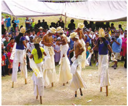
Figure 8.1. Stilt dancer – image from the Madrid Codex. Source: Vail and Hernández, 2011. Figure 8.2. Stilt dancers' performance – Maya Day 2012. Video still: Genner Llanes-Ortiz.