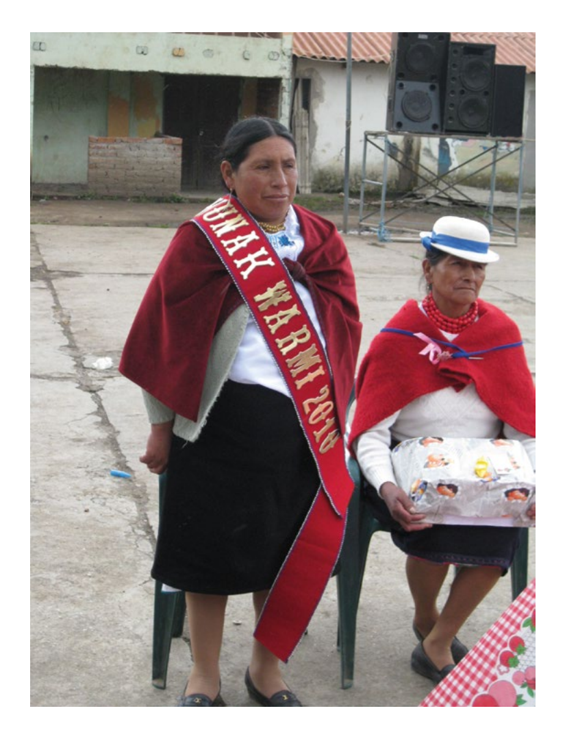
Figure 8.1: Kunak Warmi/knowledgeable woman, Quimiag parish, central Andes, Ecuador, International Women's Day 2010 (author's photo)