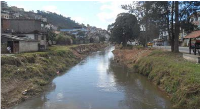
Figure 1: Looking north, the straightened River Bengalas in Nova Friburgo, 2013, with the homes of Rua Ferroviária on its western bank.

It can thus be argued that, rather than the homes of the Rua Ferroviária lying too close to the river – thus placing them at high risk of serious flood – the inverse is true: the river now lies too close to the homes. While repeated canalisation and alteration of the river course had been taking place in Nova Friburgo's centre since the early days of the settlement, its meanders through this northern end of the city were not removed until the Vargas regime of the 1940s, when it was redirected into a purpose-built canal through the centre of the valley, with the railway (and accompanying houses) to its west (see Figure 1). Industrial and road development followed, with the river eventually pushed close enough to the Rua Ferroviária for its residents to be deemed directly 'at risk'.