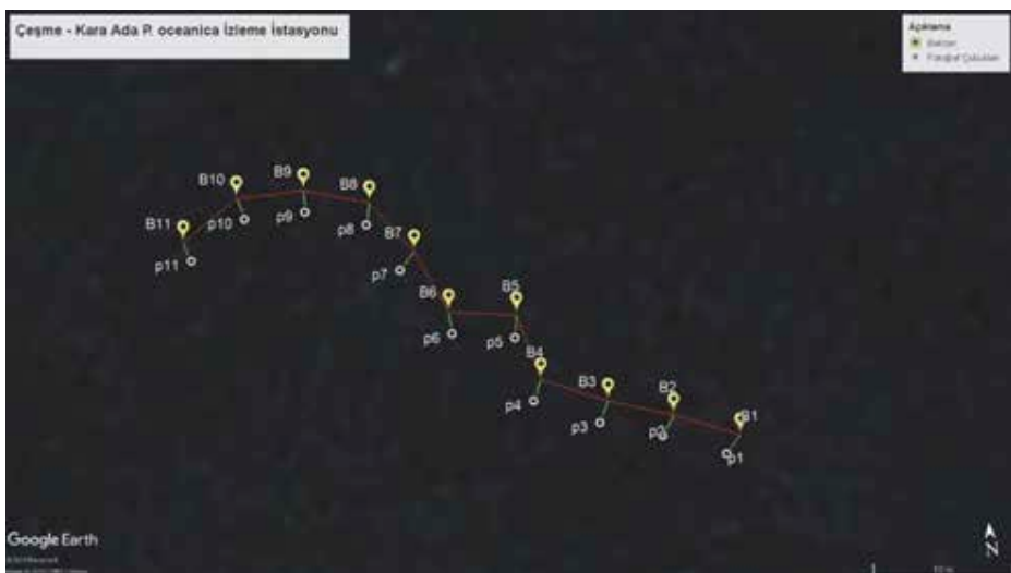
Figure 3 - Position of the markers and the photo-stakes in Kara Ada (İzmir, Aegean coasts of Turkey) (B: marker, P: photo-stakes).