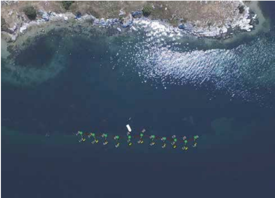
Figure 2 - Position of the markers and the photo-stakes in the Ildır Bay (İzmir, Aegean coasts of Turkey) (B: marker, P: photo-stakes).