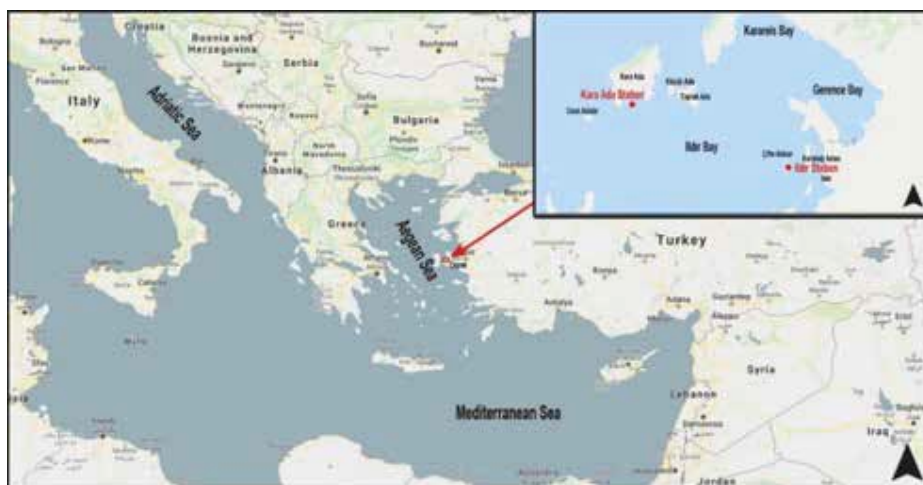
Figure 1 - Monitoring stations (Ildır Bay and Kara Ada) in the Aegean Sea (Izmir, Turkey).

The materials were collected by a quadrat (60 cm x 60 cm) divided into 9 quadrats (20 cm x 20 cm) per station for lepidochronological and phenological measurements [19], and samples were preserved in 2÷5 % formaldehyde in sea water, and later it was measured in the laboratory.