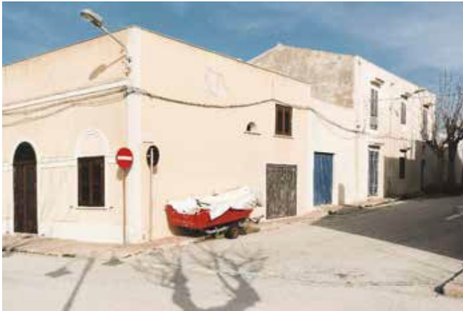
Figure 9 - Torretta Granitola, Trapani. 2018, © Mauro Fontana.

In this "contemporary grand tour", the tonnare only were a small part of the journey, scattered points throughout the territory and the landscape. And the new photographic and topographic project tells about the territories close to them, territories of passage, the areas in the middle between heritage and nature, between the landscape and the built environment.