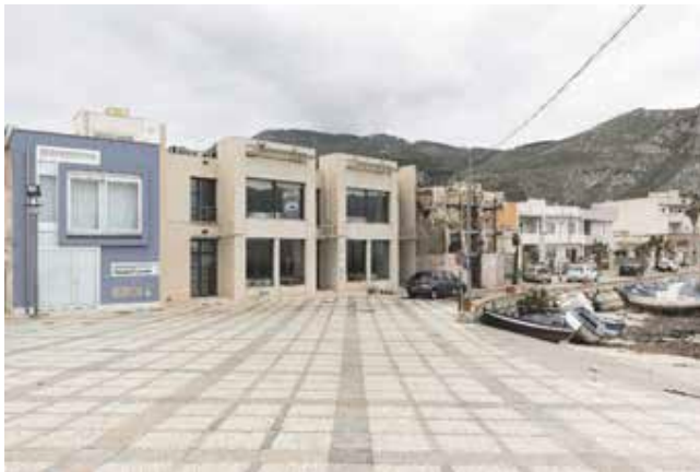
Figure 6 - Bonagia, Trapani. 2018.

For this reason, it was necessary to interpret a broader context in order to identify those landscapes that tell a familiar and invisible world along the coast, close to everyone and removed from the common eye. Talking about landscape, however, does not mean enlarging the field of observation to embrace wider portions of territory 2 , but it just must be a different way of looking at the same things. It is also necessary to assume the awareness that contemporary landscape is a “hybrid landscape”, heterogeneous, generated by contrast and juxtaposition of different elements.