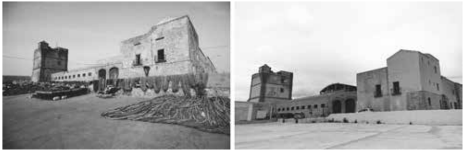
Figure 4 - Tonnara of Bonagia, diachronic comparison. On the left: 1987, © Ernesto Scevoli/Studio Camera. On the right: 2018, © Mauro Fontana.

In fact, photography always chooses what to show, sometimes forcing some views and preferring them over other ones. If in 1987 it was right to focus only on the divestiture in progress in a "romantic" way, today we must give photography a different role: it must become a language to discover, know, represent and understand the complexity of reality without constraints and aesthetic-formal obsessions, without hiding or removing parts.