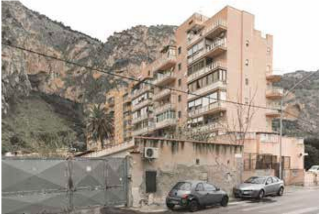
Figure 7 - Vergine Maria, Palermo. 2018

"Another Sicily" was born from the need for a new interpretative and critical reading of the landscapes around the tonnare along the Sicilian western coast. The photos of Another Sicily don't tell the story of tonnare and their traditions, but the present status of the coast today, its accesses to the sea, its infrastructure, the casual use of many fringes, the low-quality architecture that invades the territories, the distance from essential services, and the social-spatial fragility, trying to establish a relationship between heritage and landscape.