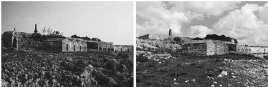
Figure 5 - Tonnara of San Vito Lo Capo, diachronic comparison. On the left: 1987, © Ernesto Scevoli/Studio Camera. On the right: 2018, © Mauro Fontana.