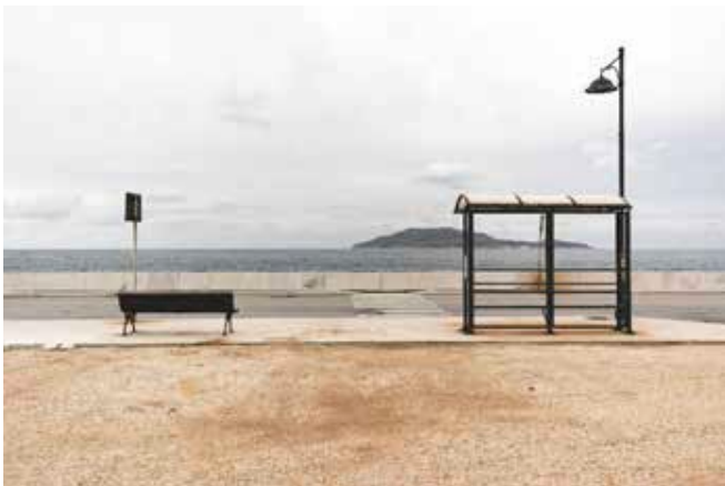
Figure 10 - Favignana, Trapani. 2018, © Mauro Fontana.