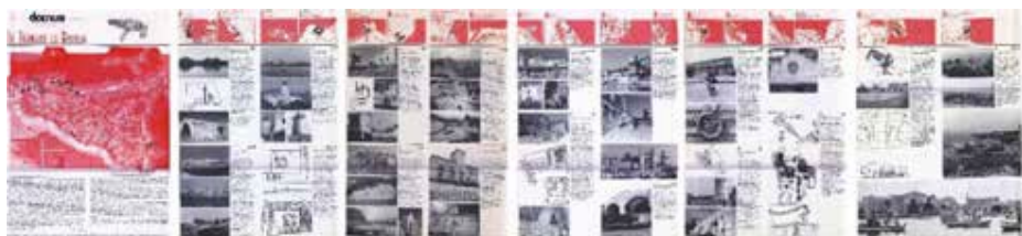
Figure 3 - Ernesto Scevoli’s reportage published on Domus in 1992. General map from Royal Commission Acts for the tuna fishing structures .

The latter point should be taken into consideration since the photographic reportage of Scevoli has focused mainly on tonnare along the West coast of the island. For this reason, this conducted analysis concerned the buildings of Torretta Granitola, Favignana, Nubia, San Giuliano, San Cusumano, Bonagia, San Vito Lo Capo, Scopello, Cinisi, Vergine Maria, Arenella e San Nicola l’Arena.