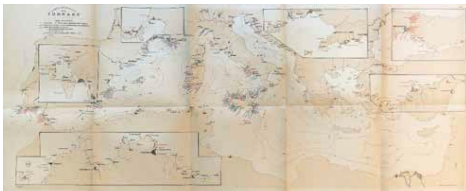
Figure 2 - General map from Royal Commission Acts for the tuna fishing structures .

The Royal Commission Acts are an exact description of the activity of tuna fishing at the end of the 19th century. The maps are a precise mapping of active and abandoned tonnare throughout the Mediterranean Coasts (fig. 2). The maps show that the highest concentration of tonnare is distributed along the Sicilian coasts and that the active ones at the end of the 19th century were located in in the current provinces of Trapani and Palermo.