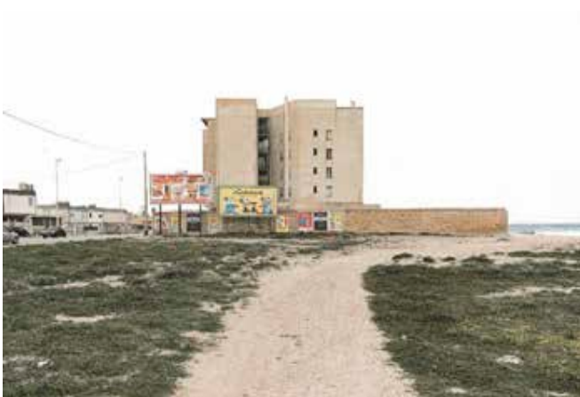
Figure 8 - Trapani. 2018, © Mauro Fontana.

Photography then becomes an instrument to discover, know, represent and understand reality, in a continuous dialogue between landscape and traces of man, between natural and built environment, an instrument to stimulate people to look at places in a