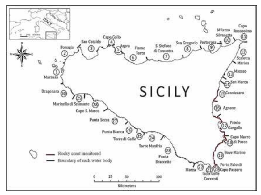
Figure 1 - Geographical distribution of the stretches of rocky coast monitored within the 24 water bodies (1-30) along the Sicilian coast.