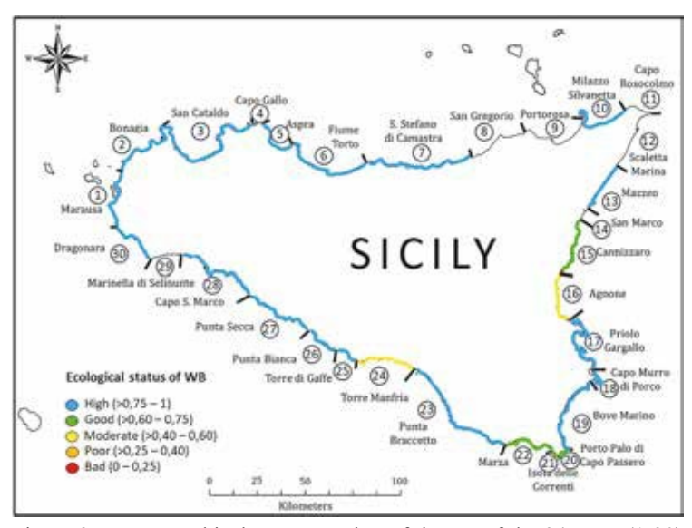
Figure 2 - Cartographical representation of the ES of the 24 WBs (1-30) monitored in the Sicilian coast through the CARLIT Index.

In the south-east side (WBs 20 to 25), the community was generally dominated by Cystoseira compressa (CC) that formed a mixed community with C. amentacea in four water bodies (WB 20-21-25-26) or with GA in other two water bodies (WB 22 and 24). Other less sensitive photophilic algae, such as species belonging to the orders Dictyotales and Sphacelariales (DS) or to the Laurencia complex group represented the dominant community in some stretches of coast (WB 6-20-21).