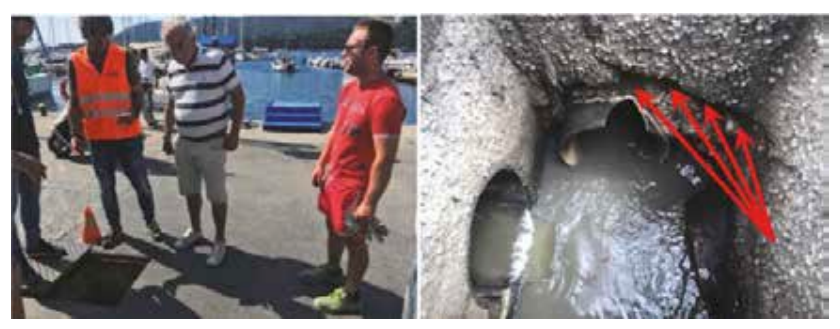
Figure 5 - Infiltration point.

At the end of all the administrative and technical checks carried out, the watertight integrity of the wells was reinstated.