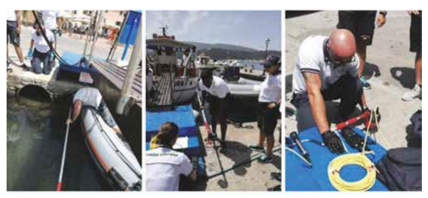
Figure 4 - Sampling operations.

On July 9, in the presence of a team of the L.A.M., it was decided to carry out further checks in the area through a sampling carried out within the aforementioned pipeline, which was also actively attended by the Official students in training.