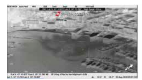
Figure 3 - Porto Azzurro Thermal anomaly.

A widespread thermal anomaly was also detected within the port of Porto Azzurro. That has triggered the insuing investigation activity by the personnel of the Coast Guard local maritime office (ACT phase).