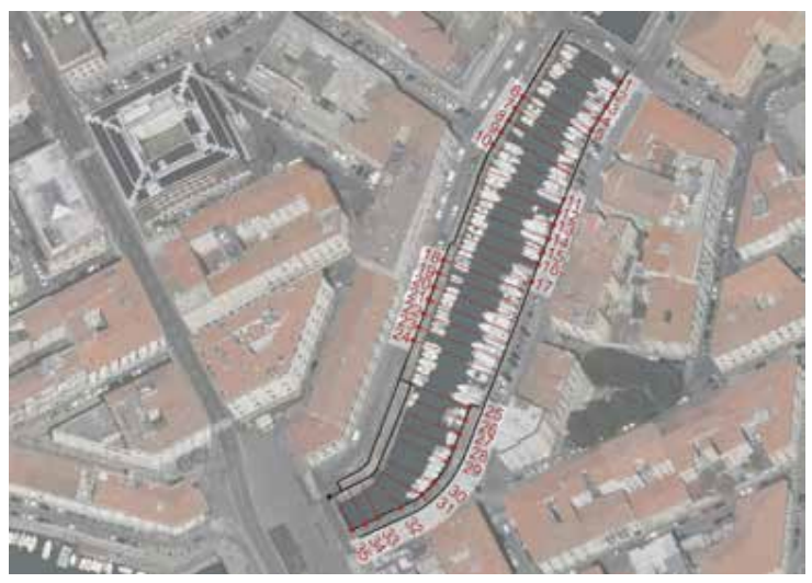
Figure 2 - Sections along stretch 16.

The first step for the realization of a scientific method to study the distribution of boats along the Fossi circuit was to analyze the size of the canals. Evaluating the size of the Fossi sections seemed to be an impossible mission without an ad hoc survey campaign. By studying the functions of QGIS instead, it was possible to evaluate the size of the section.