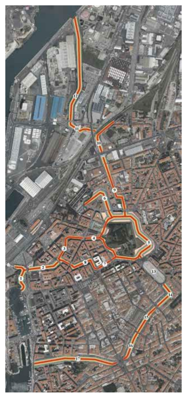
Figure 4 - Graphic analysis of the entire circuit and identification of stretches.