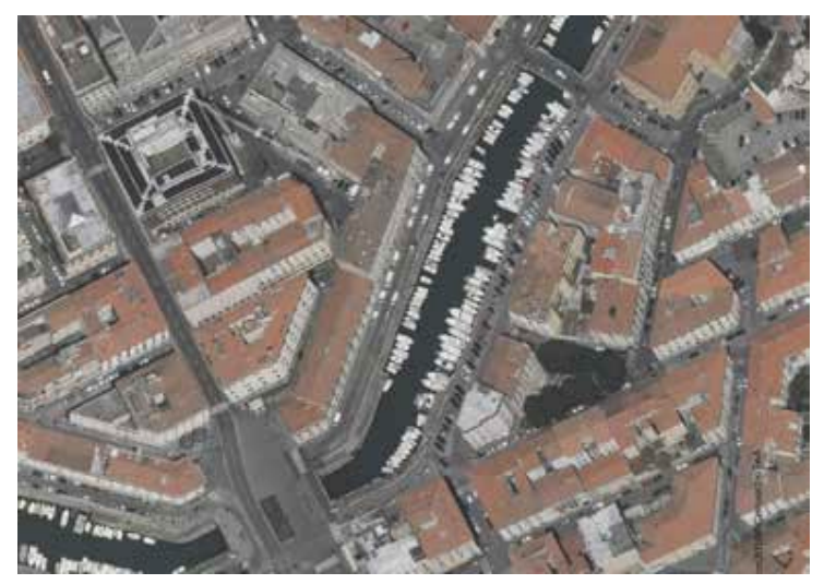
Figure 1 - Ortophoto stretch 16, between Via Augusto Novelli and Piazza Cavour.