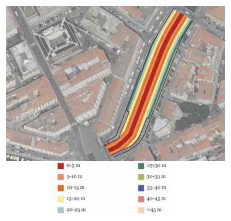
Figure 3 - Graphic analysis stretch 16 - the colour bands identify the distance from the hypothetical centre of the ditch.

In addition to a numerical analysis, a graphic analysis of the size has also been carried out. The axis of the ditch was used as a basis for creating coloured buffers that identify the increasing distance from the centre of the ditch. The central strip is 5 m wide and the adjacent strips each add 5 m to the central strip. A graphical analysis of this kind makes it possible to understand, at a glance, the size of the stretch and, in front of the complete map, to have an immediate picture of the homogeneous sections and the navigability of the circuit.