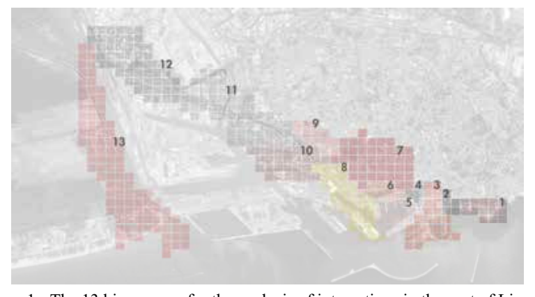
Figure 1 - The 13 hinge areas for the analysis of interactions in the port of Livorno.

First of all, the presence of elements resulting from the analysis of physical interaction: territorial planning, in particular in the PIT and PS of the municipalities in which the ports of the AdSP MTS are inserted, it is highlighted the presence of elements that constitute a statute of the port-city, both of an historical-patrimonial nature and of an emergency and critical nature with regard to the protection of the landscape and the environment. Moreover, the presence of factors resulting from the functional relationship between the city and the port: the urban functions present in the port area and the port functions present in the city fabric form intersections between the two systems, creating a sort of extension of the urban perimeter within the port, and the port perimeter within the city. Such links between city, port and territory create cross-cutting harmony: these presuppose an assessment of compatibility. In fact, the localization of urban functions in the port environment, and vice versa, requires adaptation to the laws and rules of the territory in which it is located, where the criteria for the localization of functions, organization, security and management can be very different. Functional compatibility between port and city is an element underlying the measure of interaction, and thus the balance between the two systems.