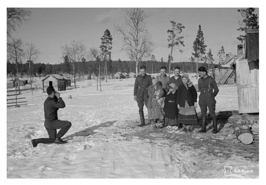
FIGURE 5.1. Germans photographing Skolt Sámi in Petsamo, April 1942. Seitsonen, Herva, and Koponen (2019) discuss this and other German photographs of Sápmi.

German demands, to active service with the Norwegian resistance, or to cooperation with the occupiers.<sup>2</sup>