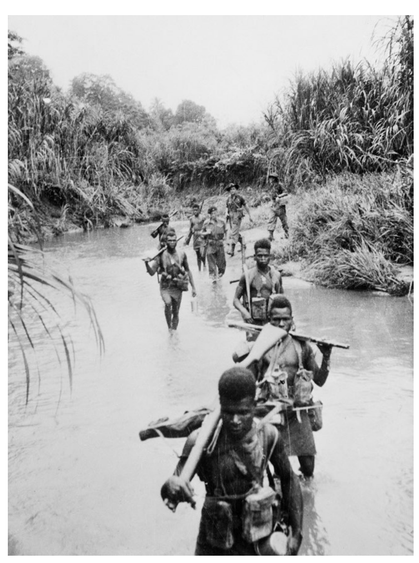
FIGURE 3.1. Soldiers of the New Guinea Infantry Battalion crossing stream in New Guinea en route to attacking a Japanese position, July 1945. (Australian War Memorial, Ref. No. 018919, photographer Terry Gibson).