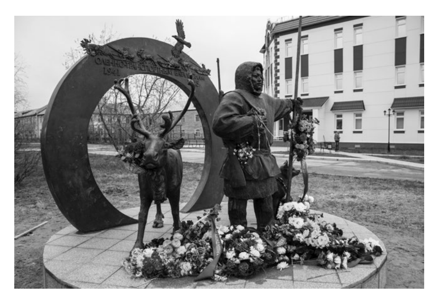
FIGURE 13.2. Memorial to reindeer fighting brigades, Naryan-Mar, Nenets Autonomous Okrug, Russia. Photograph by Stephan Dudeck. See discussion in Dudeck (2018).

included with other minorities in the national narrative of cooperation to achieve victory. A monument in Murmansk dedicated to ski and reindeer battalions acknowledges these special units. In Naryan-Mar, capital of Nenets Autonomous Okrug, one of the three war memorials displays a herder in traditional clothing flanked by a reindeer and a herding dog (figure 13.2). Its erection in 2012 marked official recognition of Nenets' patriotic sacrifice and also offered a place of mourning for soldiers' families. 46