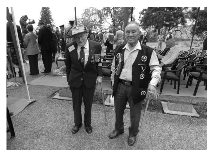
FIGURE 13.1. A British and a Naga veteran stand together at the 75th anniversary commemoration of the Battle of Kohima, Commonwealth War Graves Cemetery, Kohima, India, April 2019.