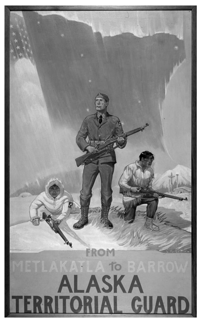
FIGURE 4.1. "Alaska Territorial Guard," by Magnus "Rusty" Colcord Heurlin (University of Alaska Museum of the North, UA1969–007–001; gift of Senator Ernest Gruening).