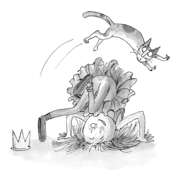
Figure 8.1 Emma somersaulting across the floor. Illustration from Skeers, L. and A. Wilsdorf. Tutus Aren't My Style . New York: Dial Books for Young Readers. 2010. With copyright permission by © Penguin Random House.

Regarding social distance, there is a predominance of long-shots (28), with full-length depiction of characters in every picture. Emma only seems to be a little closer in the illustration gazing at viewers (Figure 8.1), as her body size is bigger than in any other illustration. Direct eye contact, closer distance and frontal view all situate us at a vantage point for engagement in this crucial moment of the story, when Emma finds her own dancing style. This is the only illustration with a frontal view; the rest include an oblique angle, creating more detachment from characters. The