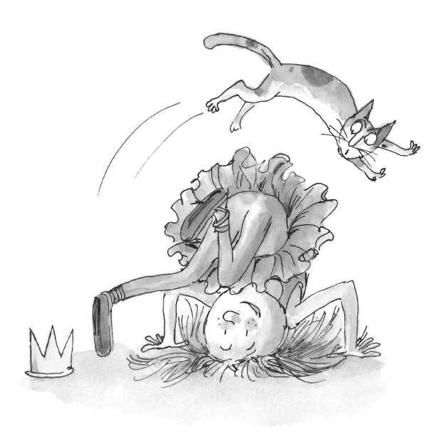
Figure 8.1 Emma somersaulting across the floor. Illustration from Skeers, L. and A. Wilsdorf. Tutus Aren't My Style. New York: Dial Books for Young Readers. 2010. With copyright permission by © Penguin Random House.

Regarding social distance, there is a predominance of long-shots (28), with full-length depiction of characters in every picture. Emma only seems to be a little closer in the illustration gazing at viewers (Figure 8.1), as her body size is bigger than in any other illustration. Direct eye contact, closer distance and frontal view all situate us at a vantage point for engagement in this crucial moment of the story, when Emma finds her own dancing style. This is the only illustration with a frontal view; the rest include an oblique angle, creating more detachment from characters. The