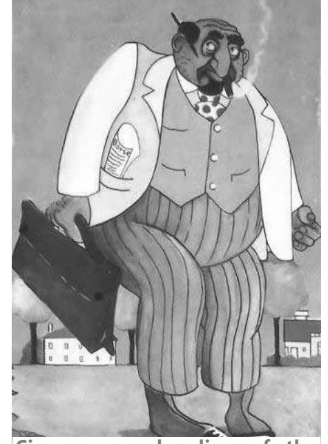
Cigar, saggy bending of the knees, protrusive eyes: this is not Bleistein, but the similarity suggests that the imagery was part of the public discourse.