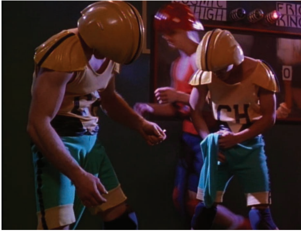
Still, Flesh Gordon and the Cosmic Cheerleaders (1990)

men could not perform their manly responsibilities. To put it bluntly all strange planet women became hornier than hell.