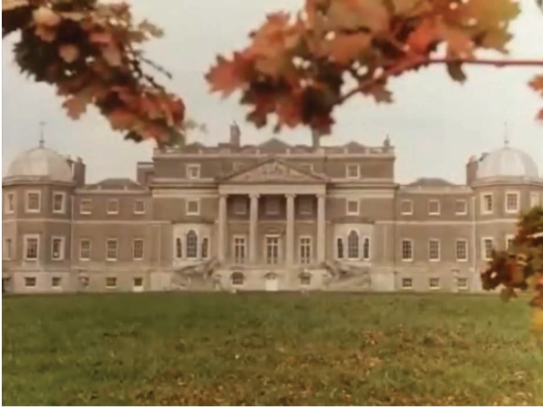
Still, Lady Chatterley's Lover (1992)

hard not to see that they are returning in the autumn and not the spring when everything returns to life. This becomes all the more telling once one has seen the film adaptation for television by Ken Russell (1993), wherein the scene of return is marked by dreariness and an overwhelming sense of brown taking up the bulk of the image, with autumnal leaves, orange and red, overhead.