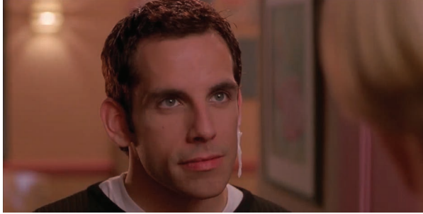
Still, There's Something About Mary

This is precisely the case in There's Something About Mary , in which Stiller's character masturbates before a first date and the ejaculate seemingly gets lost—not realizing that it is dangling from his ear. This semen is then mistaken for hair gel and is quickly applied to Cameron Diaz's character's hair.