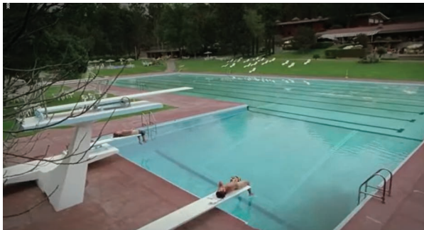
Still, Y tu mamá también

This scene is grotesque, it plays with the abject nature of semen, and it thrives on an audience knowing what a character does not. But it represents semen, that is, semen is made visible. The viewer of the film sees the semen dangling from Ben Stiller's earlobe like a long earring. In the Mexican film and box office success, Y tu mamá también , a scene includes two boys, each on his own diving board at a private club, masturbating and ejaculating into a swimming pool.