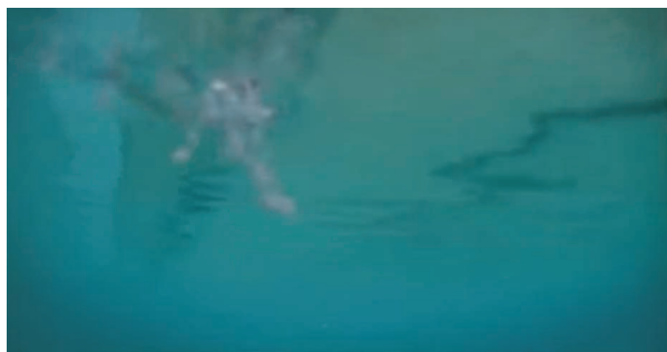
Still, Y tu mamá también