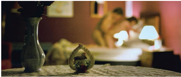
Still, Not Suitable for Sex (2012)

Viewers are witness to what Eve Kosofsky Sedgwick might call “the freshness of slow learners” (1999, p. 22). Once they begin to have sex, the sex is missionary. Stevie remains partially clothed—her polka-dot brassiere remains on. While the brassiere is undoubtedly sexy, as might be expected of the romantic comedy, it is still functional rather than merely aesthetic or erotic. The sex is quick; the scene itself lasts about 30 seconds. Afterwards they both appear sweaty, but it is clear to viewers that they are beginning to fall in love. This falling in love will be exemplified best by the remaining sex scenes, all of which happen during her period of ovulation—a relatively short window to be certain—and the sex becomes more playful and more pleasurable. They change positions, the sex is no longer, at least not only, the utilitarian reason of sex: procreation. Orgasms are achieved. Pleasure is had, an important reminder to the viewer that sex can be, and often is, pleasurable—even when procreative.