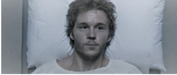
Still, Not Suitable for Children (2012)

When viewers see Jonah, now only six minutes into the film, they are not seeing the playboy, fun-loving guy to whom they were introduced in the previous scene. Instead, the scene has shifted away from the party house and Jonah is now in what seems to be a medical theatre—we see his head resting on a pillow as he faces directly towards the camera. Jonah looks sickly, he is made pale by the bright shining medical lights overhead; he is flush, his body is sweating, he hasn't shaved his face and has a rough beard. Jonah even looks older suddenly. In this scene, Jonah is undergoing an ultrasound, and the radiologist narrates what he is doing. The jump cut between the two scenes—from the party house to the medical theatre—does the work of highlighting the transition—a very sudden transition—from Guyland to the real world.