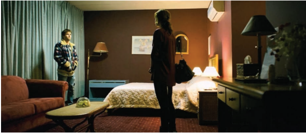
Still, Not Suitable for Children (2012)