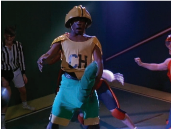
Still, Flesh Gordon and the Cosmic Cheerleaders (1990)

In Flesh Gordon and the Cosmic Cheerleaders , the explanation of the fallibility of the phallus continues. Viewers are witness to a sporting event, a cross between soccer and basketball, wherein the players use their penises to hit the ball. Their teams are replete with heroic penises that “stood high and proud.”