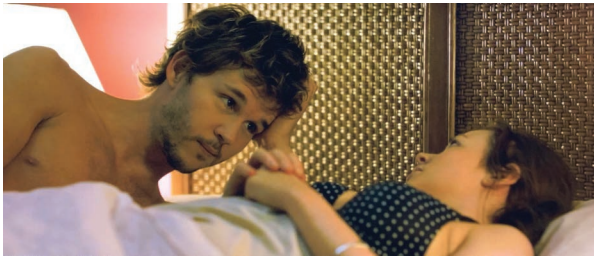
Still, Not Suitable for Children (2012)