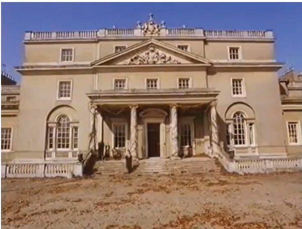
Still, Lady Chatterley's Lover (1992)

Minutes later, following a discussion amongst townsfolk about how Sir Clifford's father had died when Clifford returned home paralyzed and how it will be so tragic for the parish to no longer have Chatterleys, once more Wragby is shown as being brown, the branches climbing the pillars dead, the ground covered in refuse.