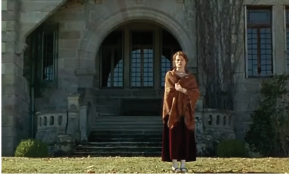
Still, Lady Chatterley (2006)