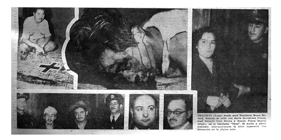
FIGURE 3.2 Crime Scene Images. La Prensa , 8 January 1953.

of the political impact of murder. Around or below the image, the headlines contain a pun, convey moral outrage, or synthesize the crime in the most direct words. They characterize victims or criminals in memorable ways: "The plumber who killed a cobbler in an absurd fight"; "He wanted to have fun and they destroyed his face with bottles"; or the famous "Violóla, matóla, enterróla" (He raped her, he killed her, he buried her). 24 The text of the article usually contains a wealth of detail that might contradict the moralizing bent of the photographs, captions, and headlines. When readers bought Alarma!, the most popular magazine in the country since the 1960s, we can assume that they planned to take some time to go through the abundant copy, coming to associate one shocking image with one complex story. Figure 3.2 exemplifies the combination of narrative and images in the nota roja . Closely cropped we see, clockwise from right, the female suspect, held by a police officer; the administrator and owner of the hotel where the events took place; the two other suspects, also surrounded by police agents; the exact place where the victim fell; and the body of the victim. The ensemble combines gore, the objectivity of crime scene investigation, and the shaming of mug shots. Events, consequences,