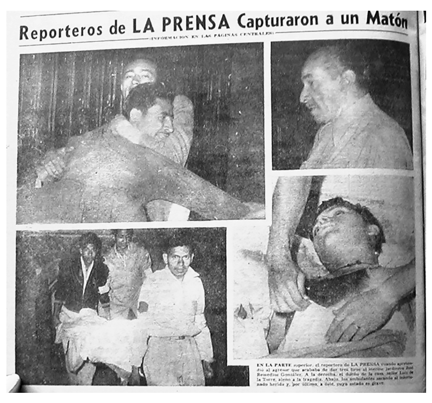
FIGURE 3.3 Reporter Captures Suspect. La Prensa , 17 March 1959.

and responsibility could not be depicted in a more economical way. The story explained the circumstances of the crime in considerable detail.<sup>25</sup>