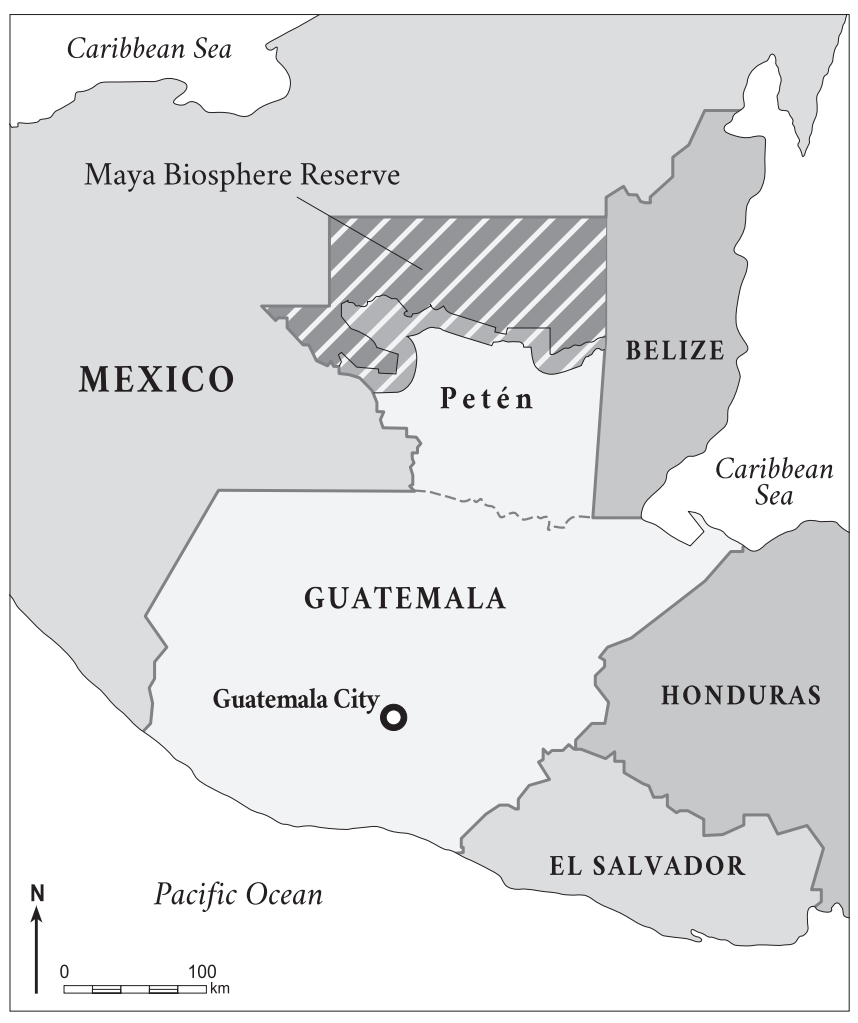
Figure 4.1: The Maya Biosphere Reserve

This 'illegal' population growth in the national parks can only be explained by a critical reading of the past, by excavating the multiple trajectories of globalisation that have produced this contemporary critical conjunction that I am describing as a conservation paradox. These multiple trajectories include centuries of indigenous land dispossession (Grandia 2012), the reversal of the 1952 land reform, state-sanctioned