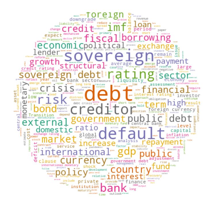
Figure 2: Most Important Terms in the Sovereign Default Risk Library. The figure shows the terms with the highest tf-idf scores in our Sovereign Default Risk Library. Font size is proportional to term weight.

Indeed, our algorithm assigns higher CS scores (Column (2)) to the default risk-related articles in Panel A compared to the rest (Panels B and C). Furthermore, as expected, the articles in Panel B are on average scored higher than the miscellaneous articles in Panel C. Comparing the sentiment scores (Column (3)) to the CS scores in (Column (2)), it is clear that CS is markedly different from sentiment, indicating that our algorithm does not simply capture negative news sentiment. Finally, Column (3) shows that our topic model correctly classifies news articles into reasonable topics, providing strong support for our reliance on the model for reducing noise.