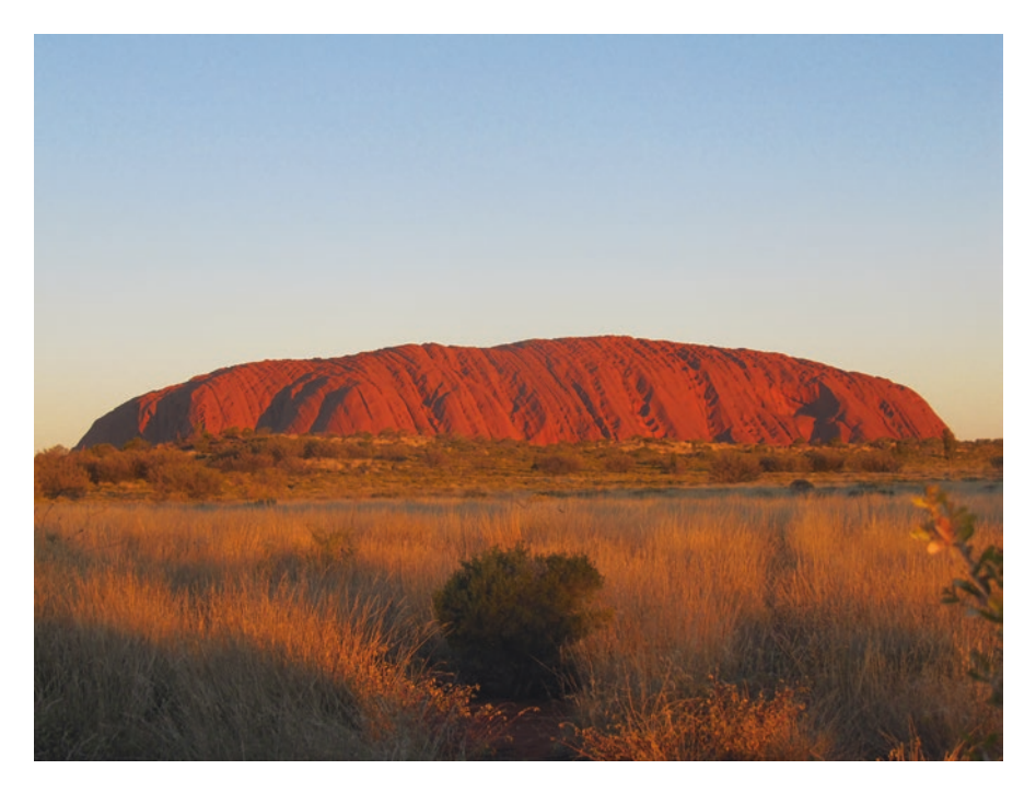
Photo 6.2 Uluru, a famous Anangu site, will be affected by climate change.

Uluru, in central Australia is another example. Predicted to experience even hotter weather, drought, fire and flash floods, these factors will combine to affect the morphology of the rock in such a way that it may 'weather' the rock so that it will cause caverns, that will lead to a honeycomb effect, literally changing the face of Uluru. This impact will have profound implications for the Anangu people for whom Uluru is a sacred site (Hughes et al., 2018) (Photo 6.2).