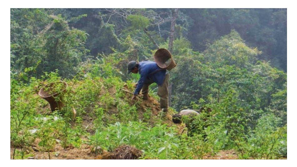
Photo 3.3 Indigenous people in the Chittagong Hill Tracts use their Indigenous knowledge in traditional shifting cultivation to adapt to climate change.

Therefore, any endeavours to enhance the adaptive capacity (or resilience) of Indigenous peoples to climate change in Bangladesh must also uphold their traditional ownership, tenure and management of agricultural and forestlands. In turn, this will strengthen their capacities to adapt to uncertainties including those associated with climate change. Bottom-up approaches can enable critical and culturally sensitive approaches that will document and integrate Indigenous understandings in climate change adaptation policy, planning and programs. Such tenure rights would enable the Indigenous communities of Bangladesh to be recognised and incorporated into climate adaptation policy and practices, to protect both nature and traditional livelihood practices (Photo 3.3).