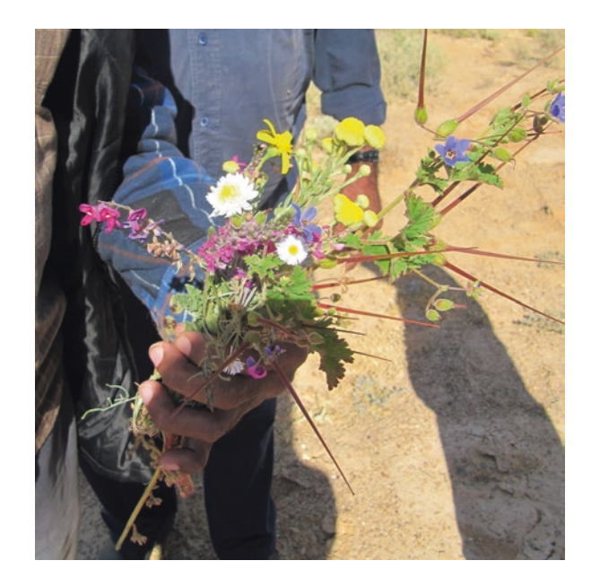
Photo 6.3 Wildflowers such as these in Arabana country are scarcer due to fewer rainfall events.

Many Australian Indigenous groups have also observed the impact of climate change on 'bush tucker' species, which now flower at different times, or not at all. In many cases, increased heat, or changes to precipitation and water regimes have restricted the distribution of key and important species. In turn these changes are affecting traditional knowledge as these species are the 'signs' by which people read the landscape and which are embedded within millennia old knowledge systems, are now changing (Photo 6.3).