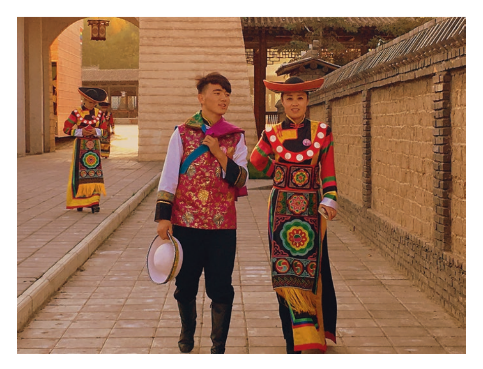
Photo 5.1 The Huzhou people where cultural and eco -tourism is an alternative mode of adaptation.

Indigenous people like the Tu will be forced to adapt rapidly by both traditional and contemporary means, including the use of traditional knowledge, agro-pastoral innovation, and the further development of tourism-based economies. The switch from being dependent on the highly variable, and often inadequate, precipitation to produce subsistence food crops, to a higher level of income and an expansion of opportunities that come from involvement in cultural and eco-tourism, is a major adaptation to climate change (Photo 5.1).