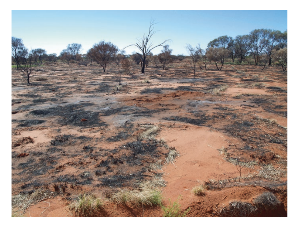
Photo 7.1 Patch burn in the Anangu Pitjantjatjara Yankunytjatjara (APY) Lands.

Traditional knowledge is important, but we also argue that the effective incorporation of Indigenous perspectives requires an embracing of all forms of knowledge, notably Indigenous Knowledge (IK) in all its manifestations. Indigenous knowledge is not just the form and types of information that Western policy makers may find culturally palatable but embraces all forms of knowledge that is understood as knowledge and relevant by the respective Indigenous group. For example, in Australia, historical knowledge, gathered after/as a result of colonisation, is used by Indigenous groups to inform climate adaptation, and has become part of their cultural domain (Nursey-Bray et al., 2020). In so doing, cultural dynamism and knowledge maintenance and revival is exercised.