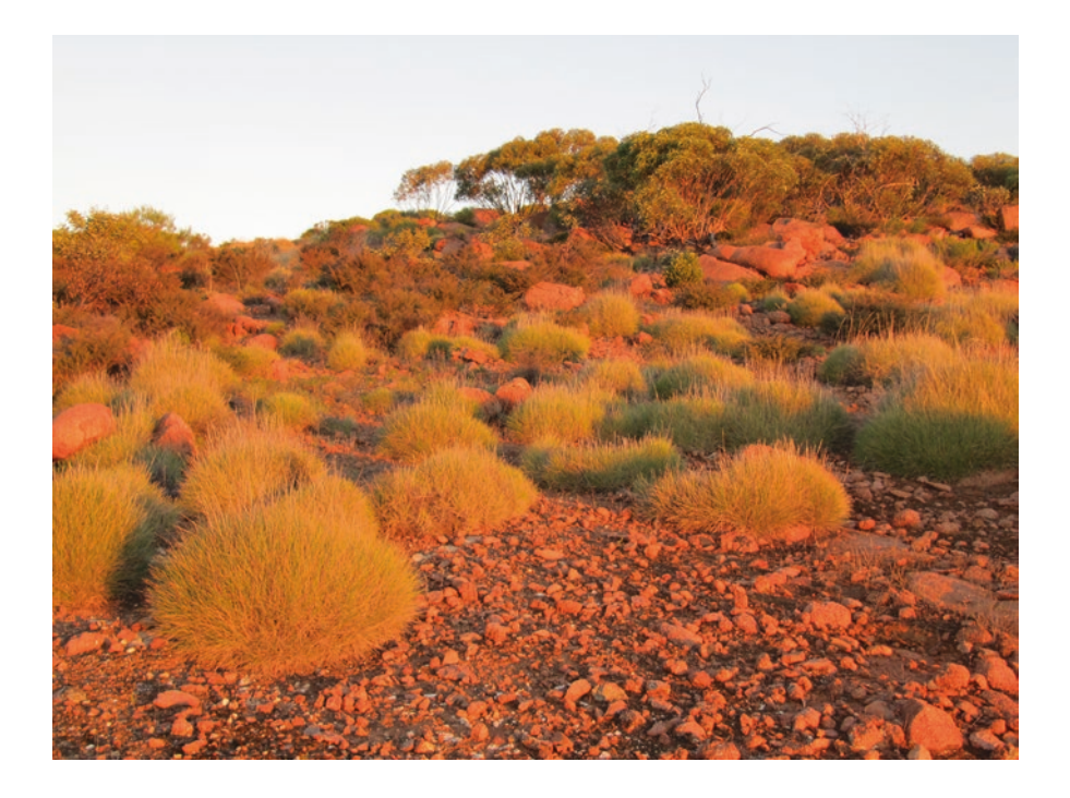
Photo 1 Gawler Ranges, South Australia.