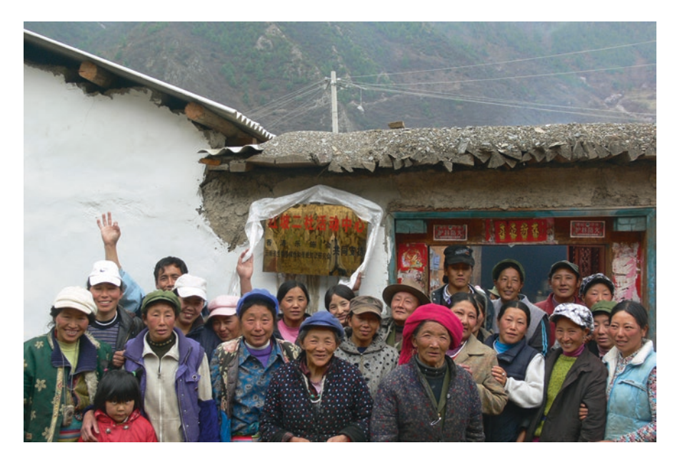
Photo 5.2 Climate field school – learning about traditional knowledge for climate change.

Although there are many studies that investigate the impact of climate change on agriculture, including the traditional modes of agriculture used by ethnic minorities, they usually rely on Western scientific data, models and formulas to draw 'objective' and scientific conclusions. Yet the traditional knowledge of the ethnic minorities, especially their perception of climate change, has not been given due attention. Ethnic minorities in China however, are the practitioners of traditional agriculture. Their observation and perceptions come from real life and while they may not be 'scientific', they directly reflect the impact of climate change on local livelihoods and further contain wisdom in implementing adaptations to climate change. All the forms of agriculture described above have been built on intimate knowledge of the local environment, including climate. In fact, different climatic conditions have been one of the factors that explain agricultural farming diversity. Ethnic traditional knowledge systems encompass local knowledge about water, forest, weather and climate systems. The next section describes some elements of this knowledge for each of the agricultural modes (Photo 5.2).