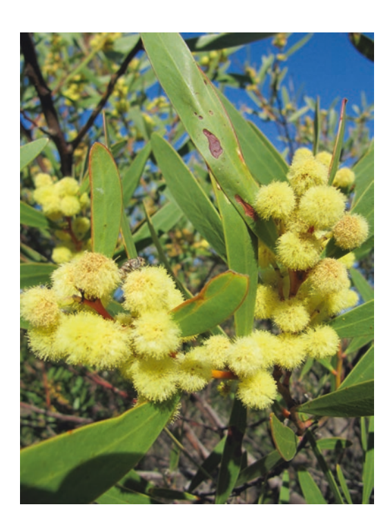
Photo 2.1 Wattle in flower tells Indigenous groups what times various fish species are running.

have offered guidance about when to hunt and care for the reef and rainforest Country<sup>1</sup> of the Kuku Yalanji for millennia (Photo 2.1).