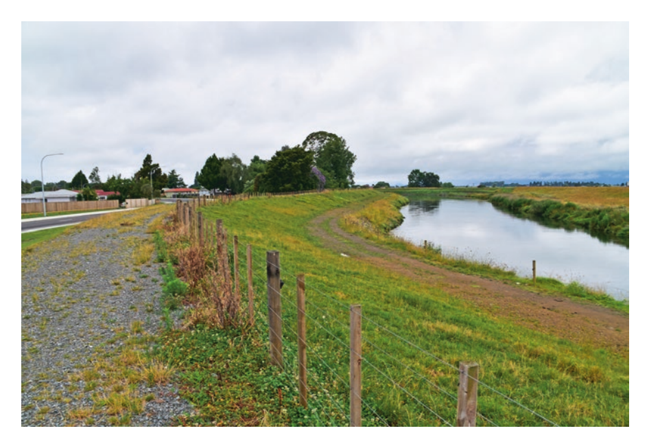
Photo 2.2 Rebuilt Flood levee in Edgecumbe, New Zealand.

We need to consider how Mātauaranga Māori can be made central (rather than marginal) to climate change adaptation policies and plans. Mātauranga Māori (the Māori knowledge system) is a relational ontology underpinned by the concept of whakapapa (genealogical connections) which binds humans together with non-humans actors (the land/whenua, rivers/awa, seas/moana, biota, climate, and super-natural beings), not only through their daily activities but also through their whakapapa to all things (Harmsworth & Awatere, 2013; Makey & Awatere, 2018; Salmond et al., 2014). Embedded within Mātauranga Māori , then, is the principle that what affects the individual (the part) affects the collective (the whole). Further, we need to ensure that poverty-reduction and violence-reduction strategies are similarly at the heart of discussions of sustainable climate change adaptation strategies for Ōpōtiki and elsewhere in Aotearoa. We need to decolonise how we think about climate change adaptation and Indigenous climate change adaptation in particular (Photo 2.2).