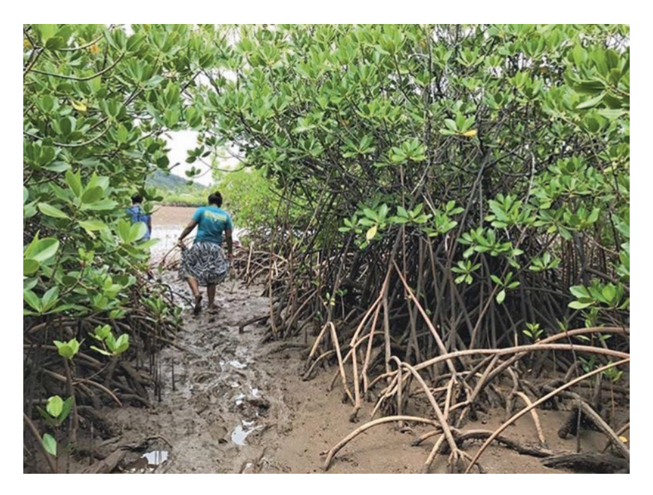
Photo 3.4 Pacific women adapting to climate change.

Women's Indigenous knowledge is distinct, relevant and valuable, extending from resource management to cultural maintenance and identity (Bryant-Tokalau, 2018). Failure to acknowledge the gendered nature of Indigenous knowledge in climate policy and programs will minimise outcomes, and potentially jeopardise the long-term survival of such knowledge. This is critical for many Pacific Island communities affected by climate change, compromising both their resource base and coping capacities. The latter is being exacerbated by COVID-19 and the growing need for cashless adaptation (Bryant-Tokalau, 2018; Nunn & Kumar, 2019). Understanding Indigenous resilience and unpacking its gendered components is vital for enabling effective and sustainable adaptation solutions. The challenge now is how to promote women's Indigenous knowledge in climate change adaptation without up-ending the customary and cultural dynamics that exist in Pacific Island societies (Photo 3.4).