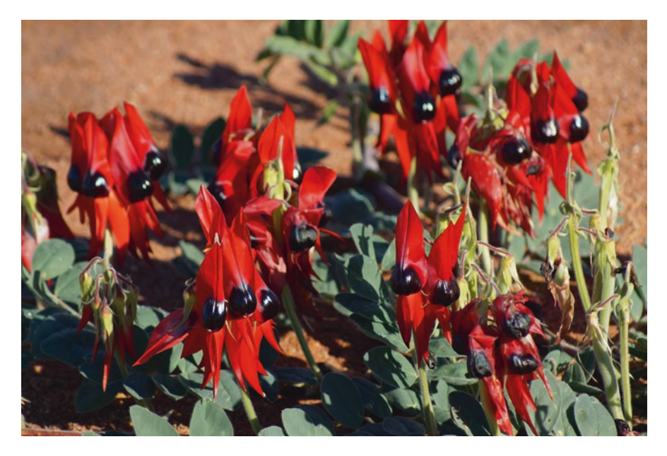
Photo 7.2 Sturt Desert Pea, Arabana Country, Australia.