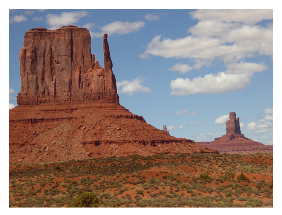
Photo 4.1 Monument Valley, part of the tribal territories of the Navaho Nation.