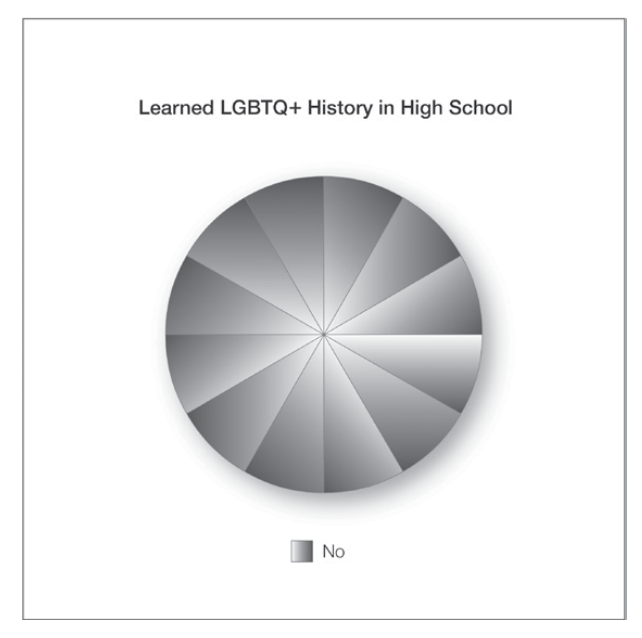
Figure 8.3 Teachers' background with LGBTQ+ history

Casey Sinclair, whose LGBT history course came about based on student requests, stated,