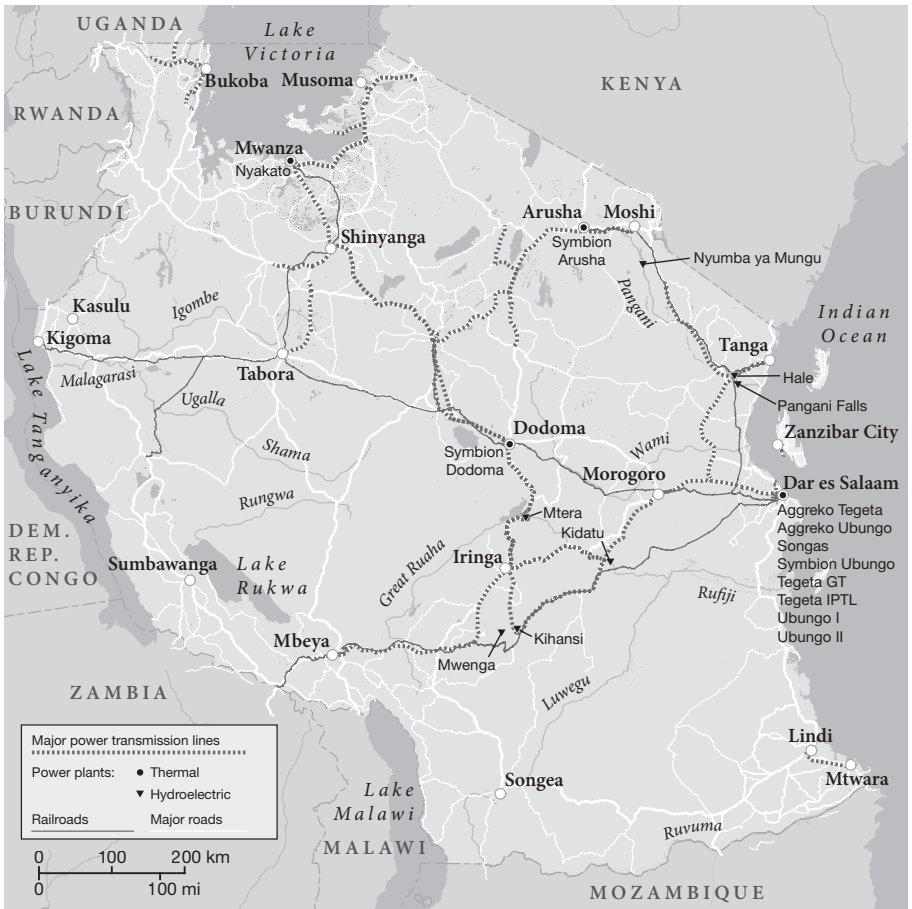
MAP 1.1 The National Grid, ca. 2015.

Daresco, of which EAP&L owned a minority share, was responsible for Dar es Salaam, supplying its government administrative centers and segregated white neighborhoods (Ghanadan 2008, 55). As elsewhere in the first decades of the twentieth century, electricity in East Africa was harnessed to a racialized, extractivist mode of colonial rule that could hardly imagine “natives” as consumers or beneficiaries of electricity (Shamir 2018).