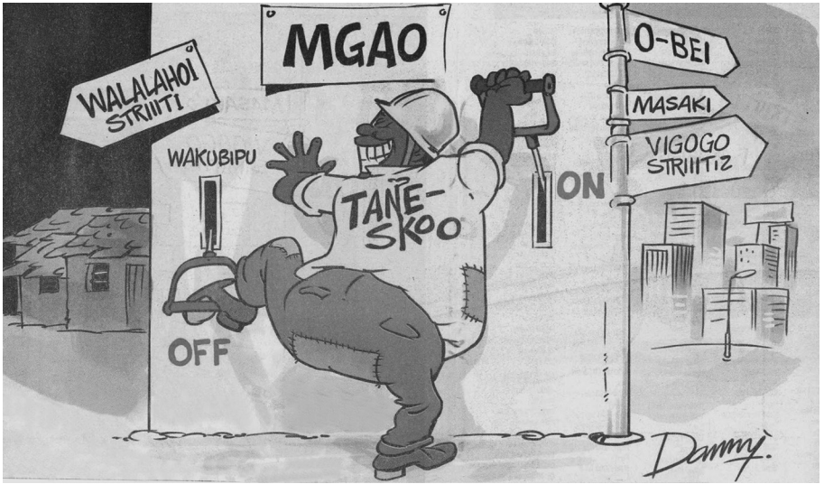
FIGURE 2.1 A Tanesco worker redirects current from “Walalahoi Street” (neighborhoods of the poor and dead-tired) to “Vigogo [Oligarch] Street”—wealthy neighborhoods like Oyster Bay and Mesaki.

quences would not be those of a gift” (quoted in Hénaff 2013, 76). Giving, in other words, “is only possible if one assumes that giver and receiver are not the same person. I cannot be the beneficiary of a gift (or more generally of a prestation) that I give to myself” (Hénaff 2013, 76). Outages turn that logic inside out and upside down. Elites can “gift themselves” by shuffling public money from the state’s right hand to its left (via fuel tenders, budgetary allocations, and emergency power contracts) rather than reciprocating it back outwards, as electricity. In turn, residents—especially poorer residents—are no longer autonomous persons to be respected but extensions of elite desires, reduced to conduits of that self-giving, to mere props or playthings.