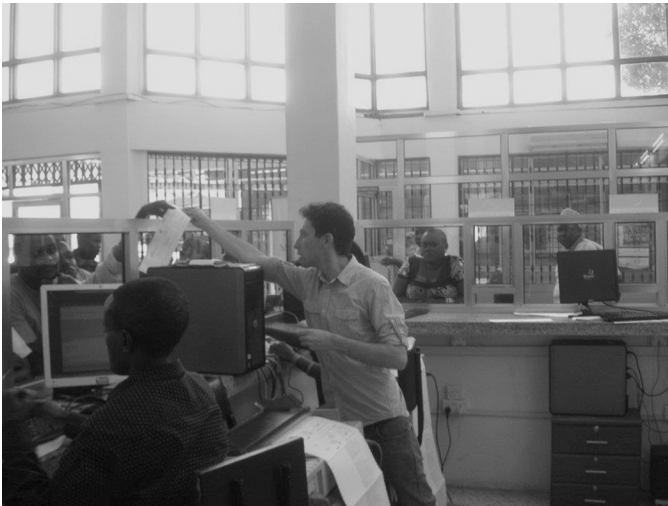
FIGURE 3.1 The author hands out electricity bills at a Tanesco branch office.

This is not to say that residents in uswahilini prefer the conventional metering system. To the contrary, they overwhelmingly prefer the prepaid “LUKU”