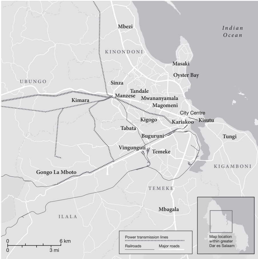
MAP I.1 Map of Dar es Salaam.

For Simon and his colleagues, dressed in collared shirts and dusty business shoes, the kijiwe offered a line of sight onto customers entering and exiting the building over the course of the day. Some looked beleaguered, perhaps angry about bills or broken equipment. Others clutched telltale oversized green folders holding applications for new “service lines” that would connect them to the grid. Should they cross the street, among Simon and his colleagues, they would find a pool of “drawers” ( vichoraji ) who, for a modest price, would provide properly formatted diagrams of their household wiring, endorsed by the stamp of a licensed contractor’s seal. More conspiratorially, they might find electricians willing to repair or otherwise modify their existing service lines. Occasionally, a Tanesco employee would walk over to confer with a