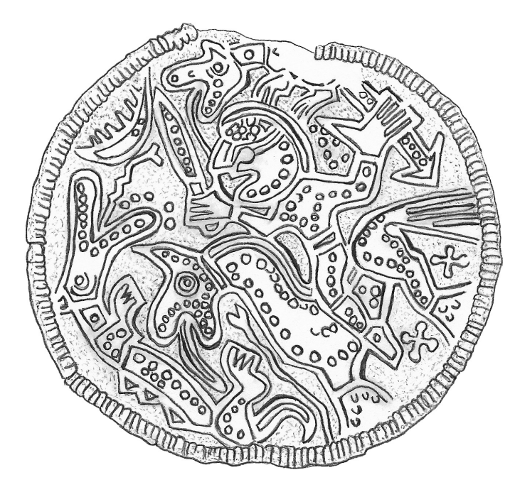
FIGURE 1.2 Bracteate from Gudbrandsdalen, Oppland, Norway [after Hauck 1985, 1,3, 77, 65b], ©2019 Drawing by Nina Zerkich.

times. 98 Surely such occasions often involved ceremony and heroic exposition. If ever we would expect monster stories to have been current in Germanic Europe, it would have been then. To the period of production and circulation of the D-bracteates, therefore, it is possible to look for the origin of the Beowulf poem. 99 Chadwick thought Beowulf derived from "stories ... preserved by recitation in a more or less fixed form of words" that were "acquired [by the poet] before the end of the sixth century." 100