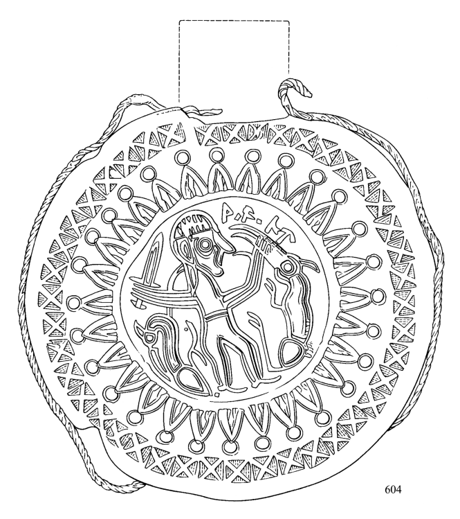
FIGURE 1.1 Bracteate from Binham, Norfolk, England [after Axboe, with Behr and Düwel, "Katalog der Neufunde," Taf. 66]

Different interpretations have been offered for them, but that they represent a heroic conflict with monsters seems likely. ^{92}