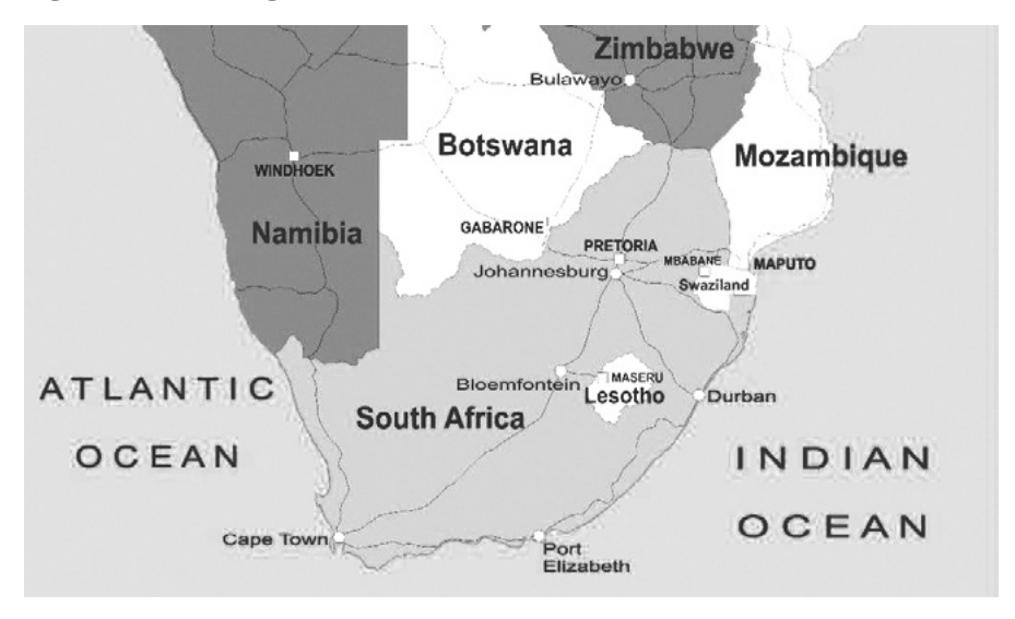
Figure 1. Positioning of Lesotho.

Lesotho's position as a landlocked country inside South Africa makes it a unique case study by which to study borders and border crossings. Lesotho is the only UN member "entirely enclosed by another member" (SAMP 2002:9).