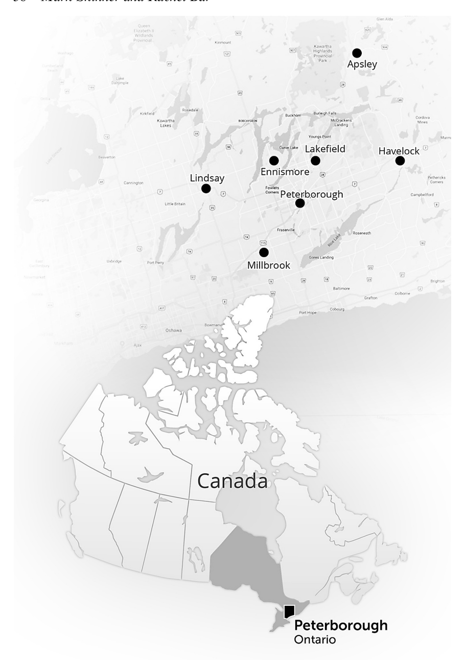
Figure 3.3 Peterborough pilot study sites.

involved five phases of qualitative data collection in the form of observations, diaries, focus groups, and interviews with program participants, including people living with dementia, carers, facilitators, dance teachers, and volunteers as well as critical reflections among research investigators and