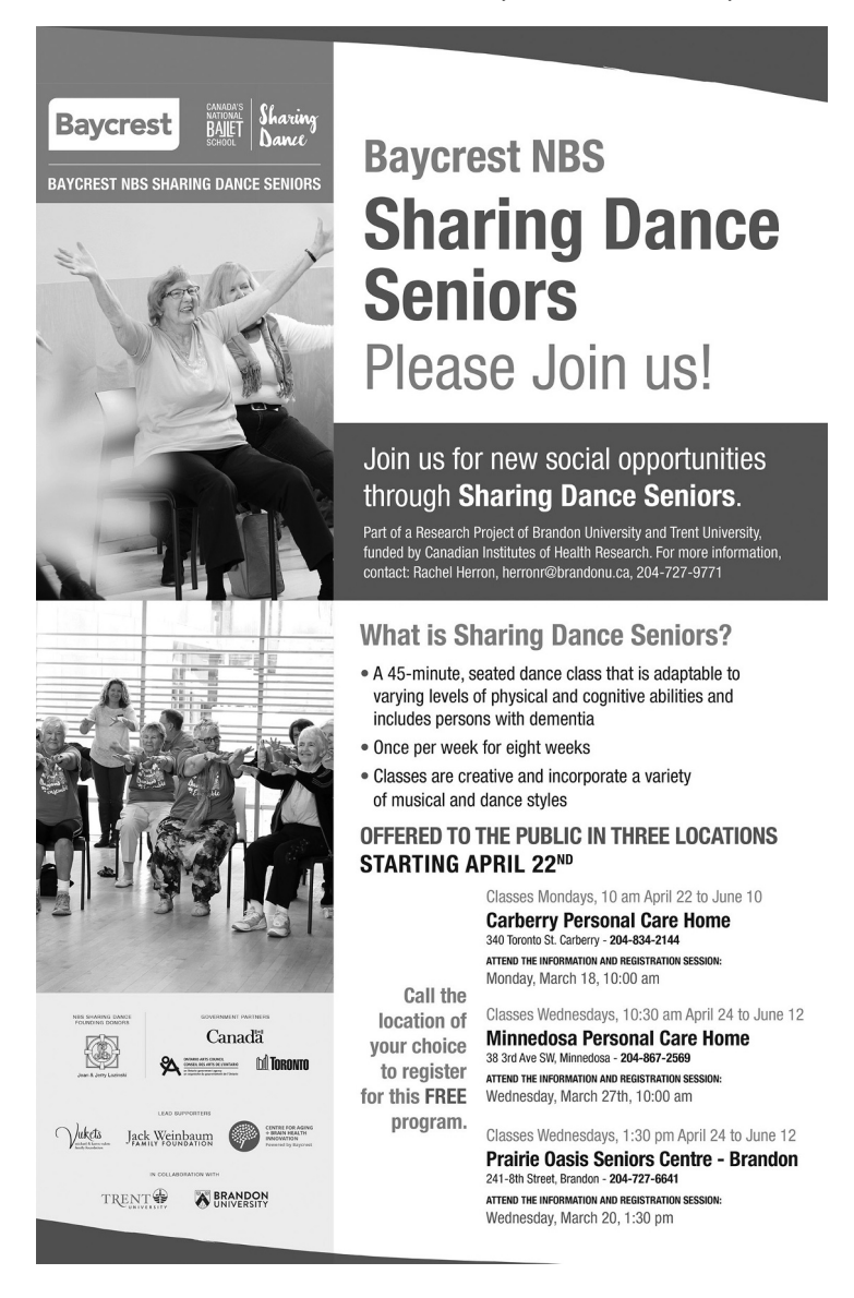
Figure 9.2 Sharing Dance recruitment poster, Brandon pilot study.