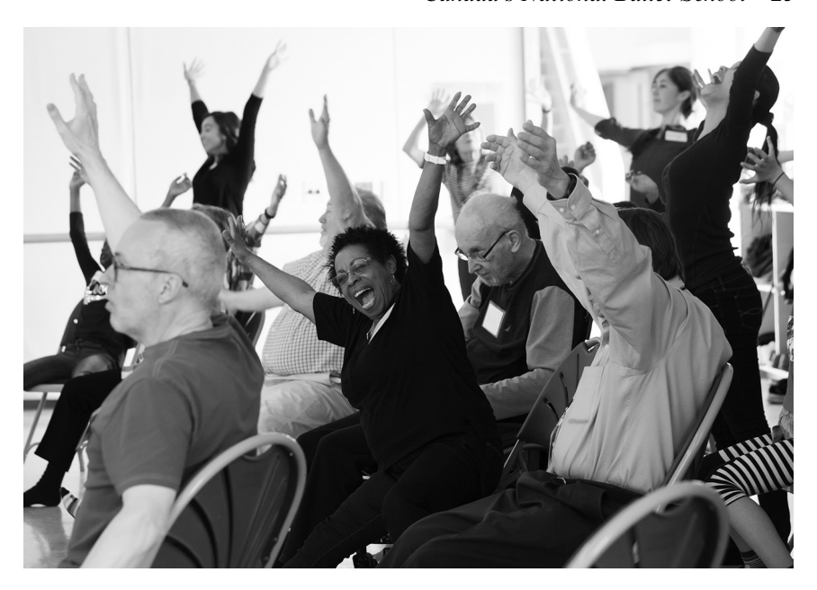
Figure 2.3 Community dancers in class at Canada's National Ballet School.

encouraged in the approach to reflect traditional dance experiences (e.g., social dances). To further support participants' opportunities to experience the many gratifying experiences associated with dance, dances are usually kept for several weeks before changing class material. This provides opportunity for participants to build familiarity and confidence performing a dance and resembles the confidence and often enhanced enjoyment dancers experience as they rehearse a dance in preparation for performance (Figure 2.3).