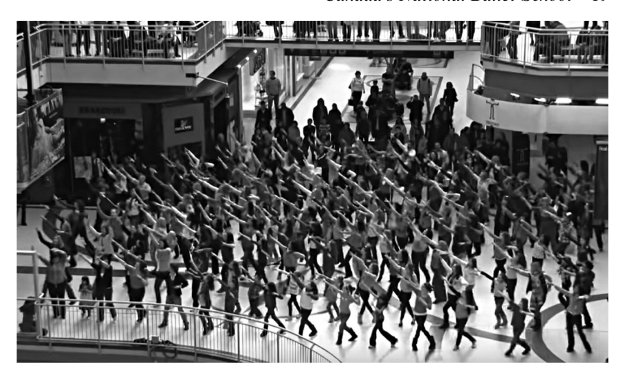
Figure 2.2 Canada's National Ballet School flash mob at the CF Toronto Eaton Centre, April 29, 2010.

funding and fundraising results that were stagnating. As the cost to deliver programming increased steadily each year, revenue was not keeping up. Facing a growing annual income gap, Staines was intent on developing a strategy that would see the School expanding its societal relevance and impact as a means to broaden its base of support, both from public and philanthropic sources.