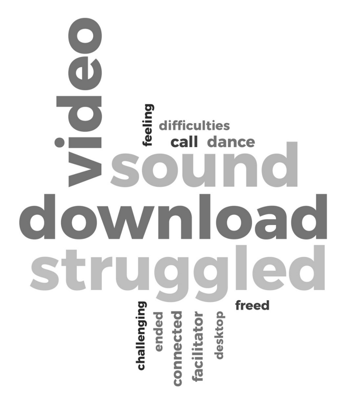
Figure 8.1 Word frequency in mode of delivery/technology node for Peterborough pilot study.

Using the NVivo12 software, we determined that glitches were a prominent feature of the described experiences of technology during the research project. Looking more closely at examples of when and how the word "glitch" was uttered, we identified varying perspectives on and approaches to the influence of technology on the Sharing Dance program. In the following section, we look first at what was said about the technical glitches by research participants when they were asked directly in interviews about their