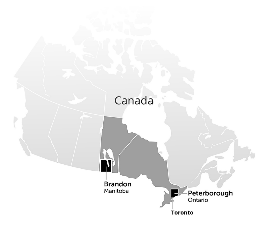
Figure 3.2 The Canadian pilot study regions.

Canada, 2022) are typical of what is considered non-metropolitan Canada where NBS was seeking to expand the reach of its Toronto-based programming. These two regions were also selected due to their proximity to researchers based at Trent University (located in Peterborough) and Brandon University (located in Brandon) whose network of research partners, such as Alzheimer Society, Community Care, and LTRC organizations, were keen to participate in the Sharing Dance program.