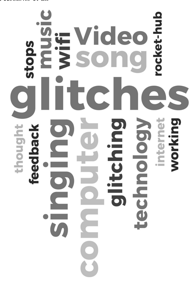
Figure 8.2 Word frequency in mode of delivery/technology node for Brandon pilot study.

experiences. We then look at what the program participants did in situ – how they responded to situations when the described glitches were observed.