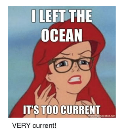
Figure 3.1 "Hipster Ariel". (Anonymous online creator, 2016a)

yet again from the masses, and slight adoptations of fashion emerge. This continues and is an expression of class society.