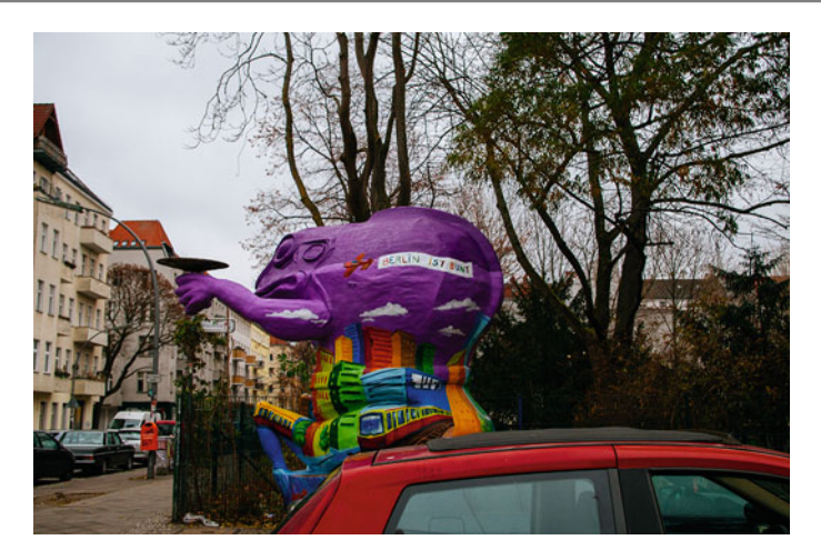
Figure 3.8 Youth Centre on Weserstrasse. (Semple, 2016d)

After understanding this conception of Kreuzkölln as a colourful space and celebrated as such, I perceived the space in its materiality. So, what is physically happening, how is the space used, what can we see?