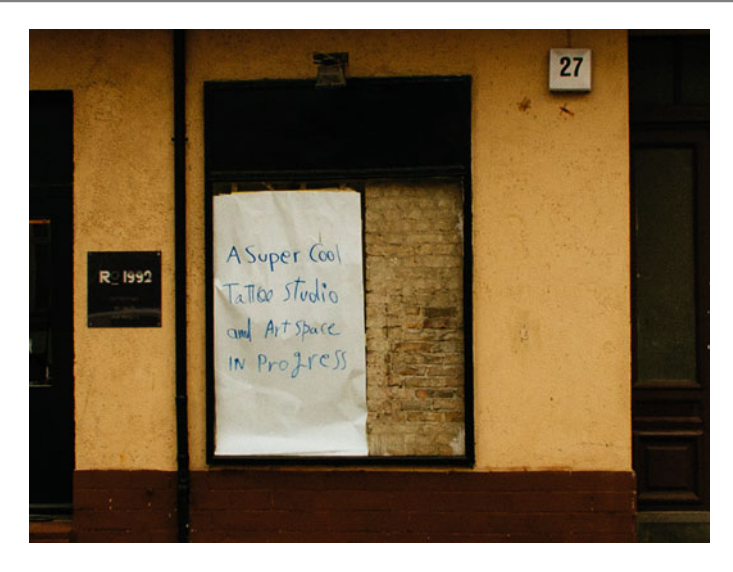
Figure 3.3 Seen near Sonnenallee, demonstrating that hipsterism prioritises affectivity and subjective involvement of the subject over rational advertising. (Semple, 2018b)

capital, we acquire it through our habitus. This poses the question whether those who have a lot of this cultural capital should all come from a similar socio-economic background. Assuming his theory, they should come from families with high (at least cultural) capital. If unique taste, distinction from the masses and the value of authenticity are part of their self narrative, it is interesting to analyse my respondents' biographies. Do individuals associated with this notion of a Hipster all come from similar backgrounds, are they all academics or artists? Analysing this as one dispersion in our prism of understanding modern, western societies, helps understand the workings of cultural capital in liquid societies, as described by Bauman (2015). Some of the the individuals I met came from working class background but had through some means or other acquired significant cultural capital.