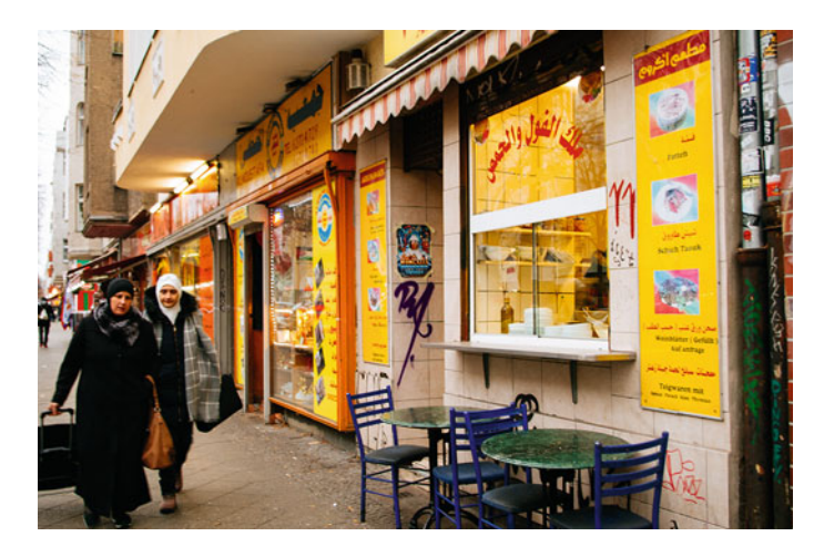
Figure 3.9 Bakery and Restaurant on Sonnenallee (Semple, 2018a)

Anna, the Berlin local, who is mentioned in the field note above, showed me Weserstrasse and said that this street is what people actually mean when they say