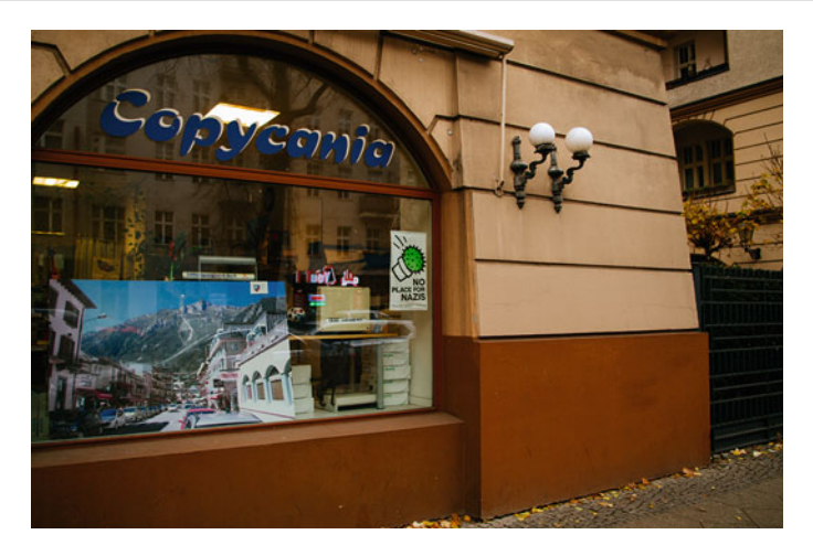
Figure 3.10 Often seen around Kreuzkölln, the sign "No Place for Nazis" in a copy shop. (Semple, 2017b)