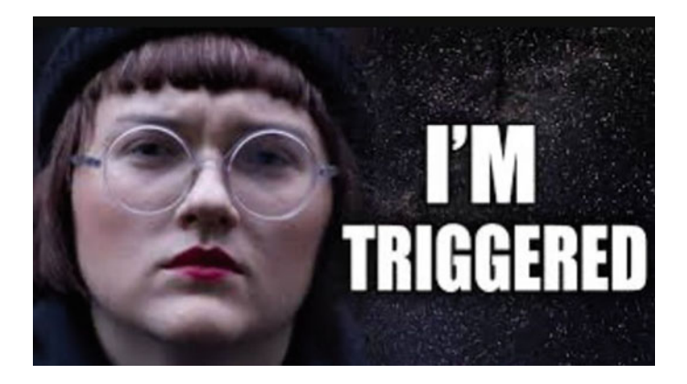
Figure 3.13 Image from a petition to remove SJW from the Internet. (Anonymous online creator, 2017)

The idealtypes labeled as "social justice warrior" and "Hipster", are often depicted very similarly in discourses on popular social media platforms such as Reddit, Facebook and 9gag. The image chosen to accompany this petition is just one example of portrayals of "social justice warriors" with temporarily trending hipster fashion symbols, such as the micro-bangs (a hairstyle with a very short fringe) and round, transparent glasses. This is one of many examples of how Hipsters and "social justice warriors" are portrayed similarly in social media and also shows an ironic stance against them and what they stand for.