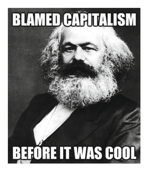
Figure 3.2 "Hipster Marx". (Anonymous online creator, 2016b)