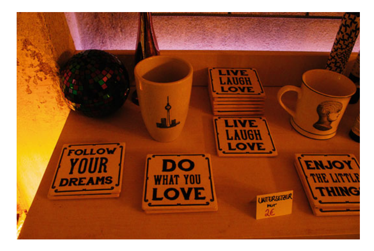
Figure 3.4 Buying Do-What-You-Love. (Semple, 2016a)

topic. Again this seems to express a kind of secret worry of becoming the neoliberal antitype. As such, while hipster fashion or lifestyle can be commercialised very well, it is not the milieu I was observing that actually consumed those items. I visited the store depicted in 3.4, amongst a few others, various times and always just observed tourists there. As this area is becoming popular for tourists because of this milieu, my respondents feel more of an urge to distance themselves from such behaviour.