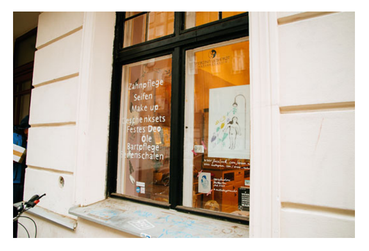
Figure 4.1 One of the shops close to Wesestreet selling organic cosmetics. (Semple, 2017c)

In 4.1 one can see one of the many shops on Weserstrasse. It had purely no waste cosmetics and organic products. The image in the window depicts a woman showering in twigs and leaves and feathers, demonstrating a bathing in nature. The image also portrays the woman with average porportions, as opposed to many advertisements in cosmetic shops that use skinny and photoshopped flawless models on the posters and pictures. While the image is purposefully simple in style, using only few brush strokes, there are lines on the legs emphasising unshaved legs. There seems to be special emphasis on the idea that the lady portrayed is not only connected closely to the nature, and has average proportions, but especially that her legs are not shaved. As such, she is not adhering to expectations of beauty pushed by commercial capitalism.