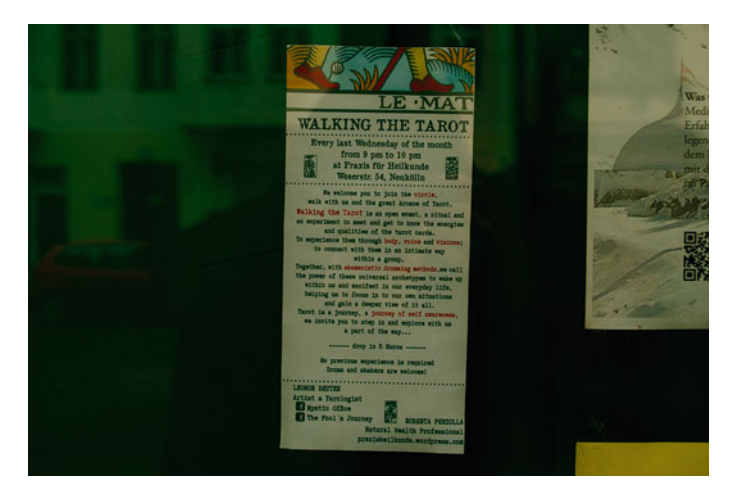
Figure 3.6 Also on Weserstrasse, an offer to a tarot seminar. (Semple, 2018d)

Though I did not meet any people actually using such forms of therapy, in one conversation a group of friends excitedly discussed the possibility of going to a session together, where the psychedelic drug ayahuasca, which stems from spiritual medicine of indigenous nations around the Amazon, would be used as a method to get rid of the self and ego and live in pure consciousness.