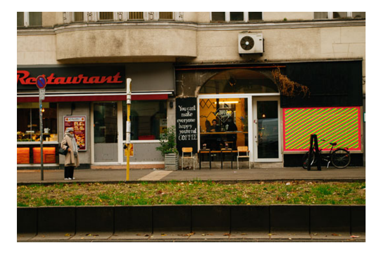
Figure 3.7 "In Coffee we trust". (Semple, 2018c)

Image 3.7 shows the slogan is "In coffee we trust", a mockery of the motto "In God we trust".