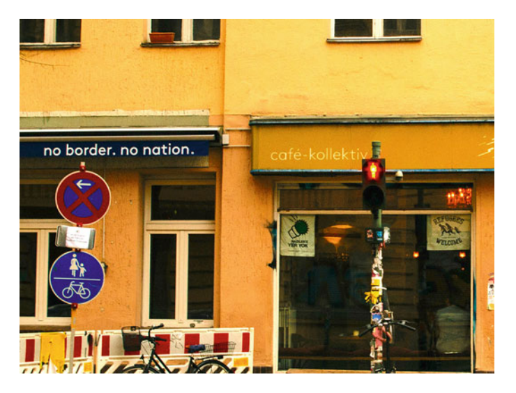
Figure 3.11 On Weserstrassse: K-Fetish café on the right and a bar on the left. (Semple, 2016c)