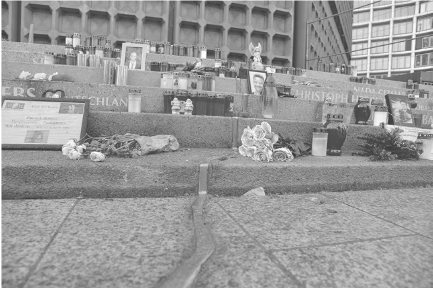
Fig. 5: Memorial to the victims of a terror attack on 19th December 2016, 2018, Berlin, Germany.

the grief and sorrow of the immediate family, friends and survivors is one way to counter the perpetrator's dominance of the images, however difficult it sometimes seems to bear. Yet the release of names and images lies solely in the hands of those directly affected. No state government, no advocacy group and no media concern has the right to circulate information and visual material that is not provided on a voluntary basis. One can only hope that the memory of the victims' fate will be remembered despite and beyond the short-term success of political manipulations.