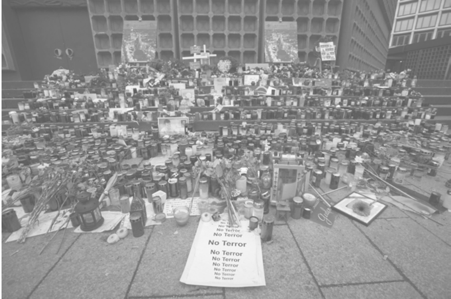
Fig. 3: Spontaneous memorial to the victims of a terror attack on 19th December 2016, 2017, Berlin, Germany.

maintained order. The day following the attack a memorial service was held in the church that was attended by numerous politicians including the German Chancellor, the President of the Bundestag, the German Federal President, and Berlin’s mayor. One month later the victims were commemorated in the Bundestag and on two separate occasions in January and February 2017 Chancellor Angela Merkel attended the site during official state visits with the Presidents of France and Tunisia.