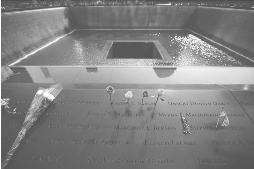
Fig. 2: National September 11 Memorial to the victims of 9/11, 2011, New York, USA.

lost their lives on this day (Fig. 2). American flags flutter over the engraved names and security guards are responsible for placing roses beneath the names of the dead to commemorate their birthdays. Organized and orchestrated by the government agencies Port Authority of New York and New Jersey and the World Trade Center Memorial Foundation , a culture of remembrance has been created that is deeply reminiscent of U.S. war memorials at graveyards, including names, flags, and fresh flowers. 21