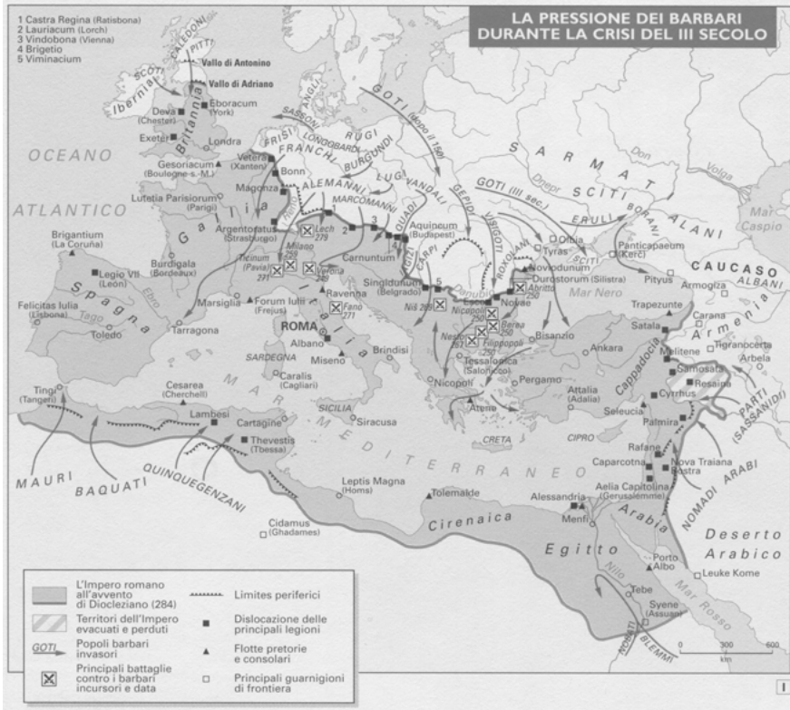
Fig. 1: “The Barbarian immigration pressure during the crisis of the 3rd century” (from an Italian historical atlas of 1997)

Romans: in the East Parthians as well as Arabs and in the South Nubians, Blemmyes and Berbers find their way into the empire.