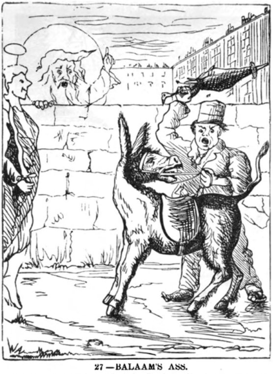
And the ass saw the angel of the Lord standing in the way, and his aword drawn in his hand. . . . And the Lord opened the mouth of the ass, and she raid unto Balaam, What have I done unto thee, that thou hast said to me these three times?—Numbers xxii. 28, 28.

now being cared for by the recently founded Royal Society for the Prevention of Cruelty to Animals.<sup>19</sup>