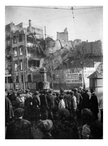
Fig. 17: A crowd observes destruction during the Tragic Week.