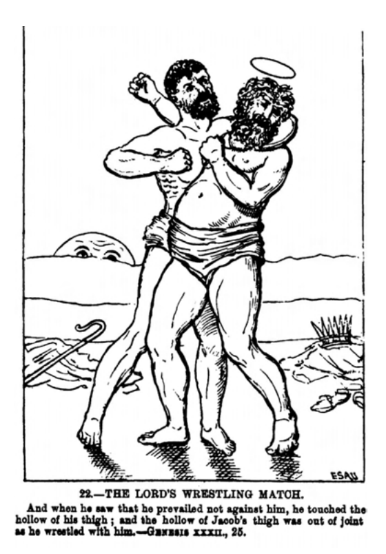
Fig. 10: Plate 22 'The Lord's Wrestling Match,' published in G.W. Foote, Comic Bible Sketches (London: Progressive Publishing Company, 1885).

Isaac, all constructed upon the idea of a supposedly necessary 'sacrifice'. The cartoon, entitled 'Abraham's Ordeal', showed God reaching down from the clouds to hand Abraham a shotgun. A perplexed Abraham looks apprehensively at the firearm arguably feeling hemmed in by the biblical text emblazoned underneath the image.<sup>17</sup> In two other instances, Foote repeated depictions from the same book of the Bible to display images of the Christian God wrestling semi-naked with Jacob and the latter also wrestling with an angel.<sup>18</sup>