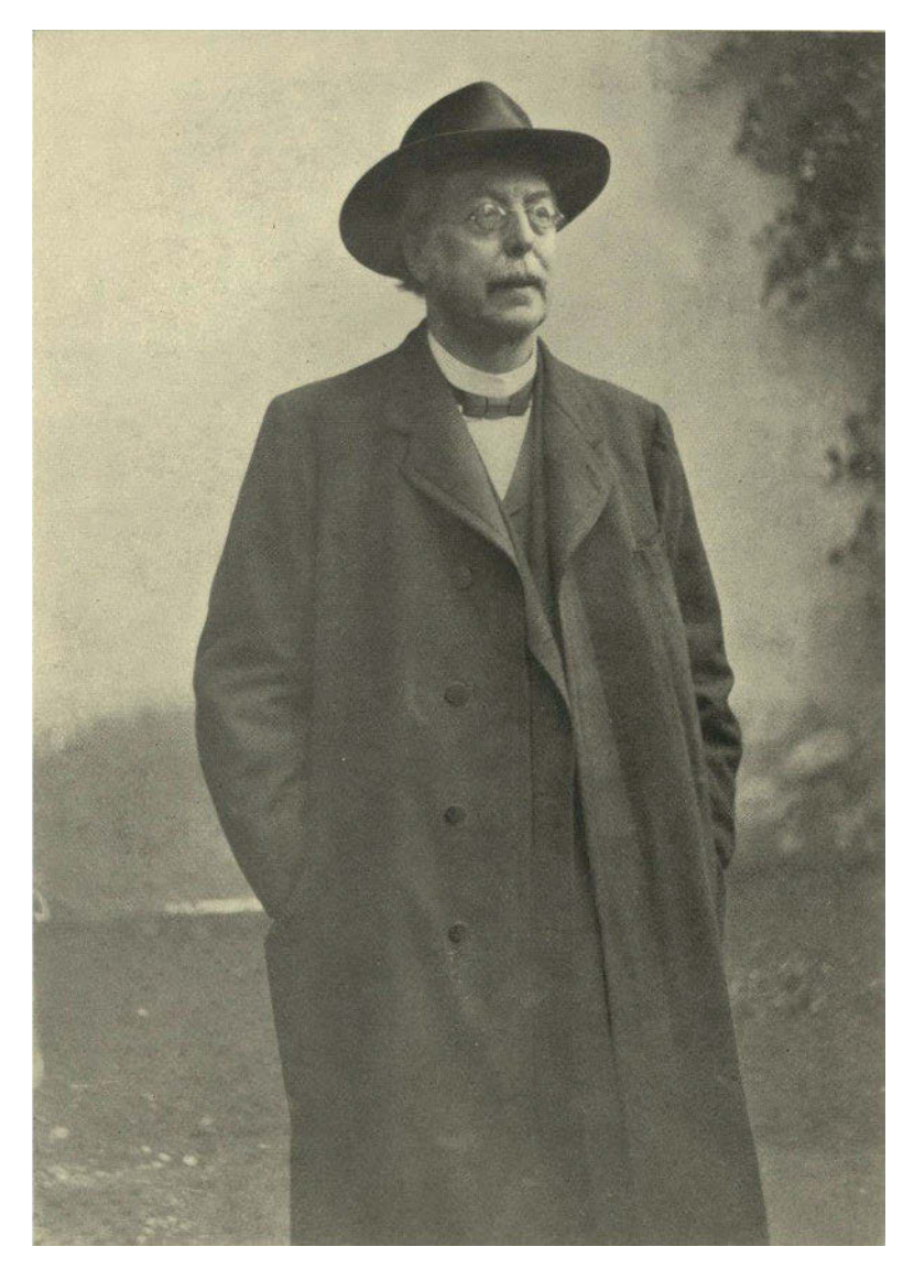
Fig. 6: 'Portrait of Carl Jatho,' published in Carl Jatho: Briefe (Jena: Eugen Diederichs, 1914).

tremely popular among a bourgeoisie alienated from Lutheran orthodoxy. Eugen Diederichs, a famous publisher of avantgarde literature, printed multiple volumes of these sermons and thus helped Jatho become a well-known and popular figure in social reform circles. The latter also wrote numerous books on religious