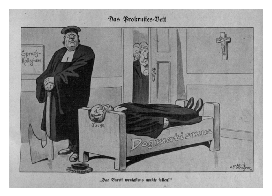
Fig. 8: Arthur Krüger, 'The Bed of Procrustes,' published in Kladderadatsch 64, no. 28, July 9, 1911.

the accusations of the Lutheran Church.<sup>53</sup> The term also served to allude to Jatho's courage in sticking to his unorthodox views and challenging the authority of the Church. A satirical poem from 1912, published in Kladderadatsch , recalled with bitter irony how the local church council ( Gemeinde-Kirchenrat ) of Barmen had banned Jatho from preaching at the funeral of a friend, citing his allegedly blasphemous views: