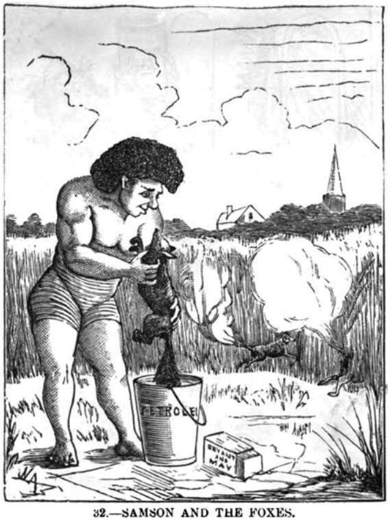
And Samson went and caught three hundred foxes, and took firstbrands, and turned tail to tail, and put a firebrand in the midst between two tails. And when he had set the brands on fire, he let them go into the standing corn of the Philistines.—JUDGES xv., 4, 5.