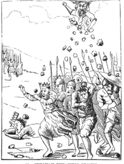
28.-JEHOVAH THROWING STONES. The Lord cast down great stones from heaven upon them unto Azekah and they died.-Josu. x., 11

Fig. 11: Plate 28 'Jehovah Throwing Stones,' published in G.W. Foote, Comic Bible Sketches (London: Progressive Publishing Company, 1885).