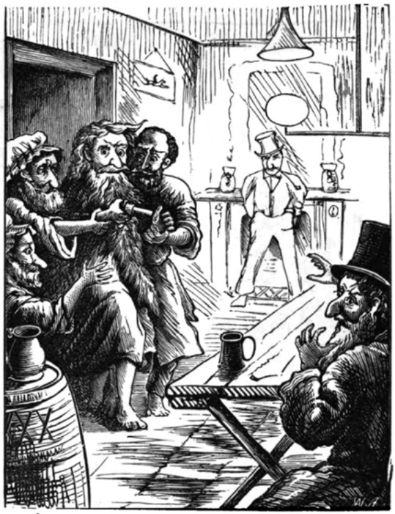
24.—ATTEMPTED ASSASSINATION OF MOSES BY JEHOVAH. And it came to pass by the way in the inn, that the Lord met him, nd sought to kill him.—Exopus Iv., 24.

church in the distance beyond the cornfield. The event is also enabled through the thoroughly modern touches of a visible tin of kerosine and a packet of Bryant and May matches.