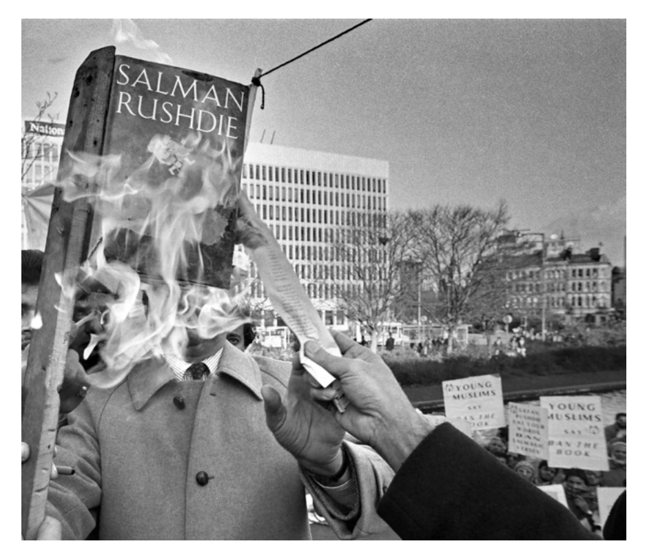
Fig. 19: Muslim protesters organised a book burning at an anti-Rushdie demonstration in Bradford in January 1989, attracting international attention to their cause and provoking a public outcry in liberal media.

ican Cultural Center in Islamabad, in which the first deaths among the demonstrators occurred.<sup>8</sup>