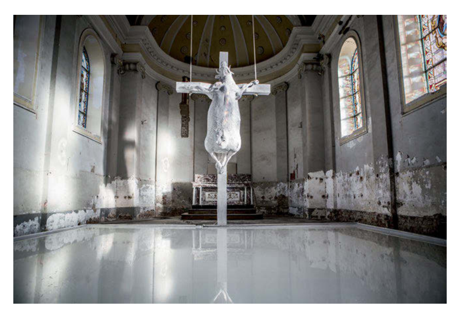
Fig. 1: Tom Herck's installation 'Holy Cow' in the former parish church of Kuttekoven in the Belgian province of Limburg, 2017. Despite its abysmal state, the building's function as a previous place of worship is evident. Kindly reproduced with permission of the artist.

An altar and stained-glass windows were the only religious symbols left in Kuttekoven's church. With the plaster on the walls displaying the results of a merciless humidity and without a pulpit, confessional chair or prayer bank in sight, the building bore all the hallmarks of desertion. In November 2017, however, this parish church in the eastern Belgian province of Limburg suddenly became a focal point for Catholic attention. The reason for this sudden interest was an installation that artist Tom Herck had placed in the nave.<sup>1</sup> It consisted of a mas-