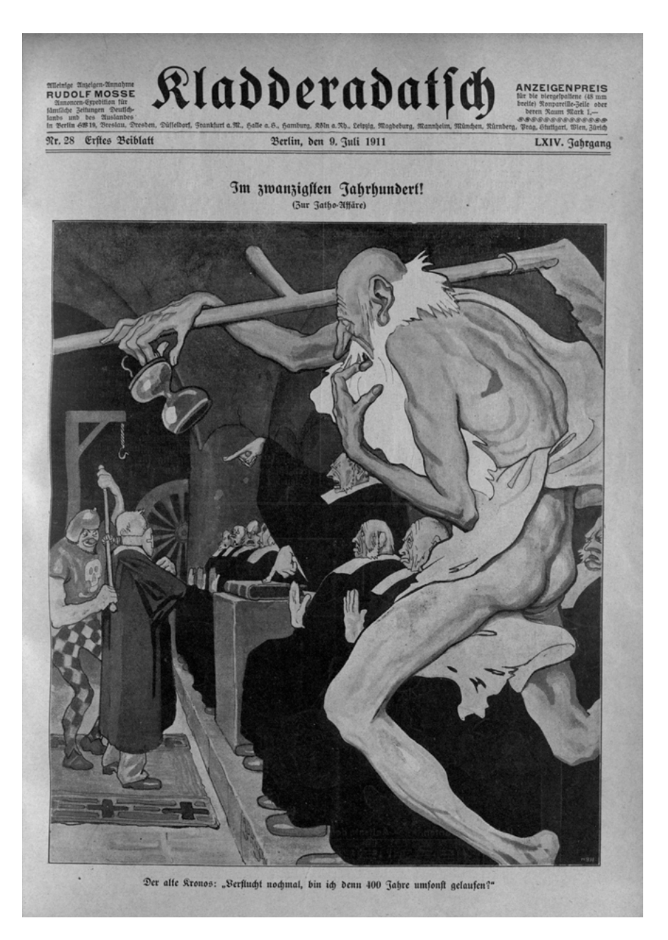
Fig. 7: 'In the Twentieth Century! (On the Jatho Affair),' published in Kladderadatsch 64, no. 28, July 9, 1911.