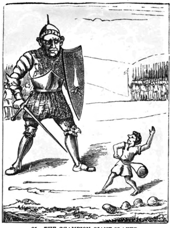
35.—THE CHAMPION GIANT-SLAYER. So David prevailed over the Philistine with a sling and with a stone and smote the Philistine, and slew him.—1 Saw. xvii., 50,