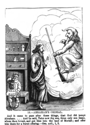
Fig. 9: Plate 18 'Abraham's Ordeal,' published in G.W. Foote, Comic Bible Sketches (London: Progressive Publishing Company, 1885).

What emerges from an in-depth analysis of Foote's work is quite how many of his cartoons exhibit themes of violence within them. They often depict Christianity as the product of barbarism and, all too often, as the chief unhelpful encouragement to its persistence. In many of these images, the figure of the Christian God is depicted as both destructive and violent. Such behaviour, whilst obviously irrational, was frequently shown as the product of arbitrariness and even active malevolence to humankind. The God of these cartoons was vengeful and abusive towards his defenceless creation, apparently taking pleasure and joy in the suffering of humans and animals alike.