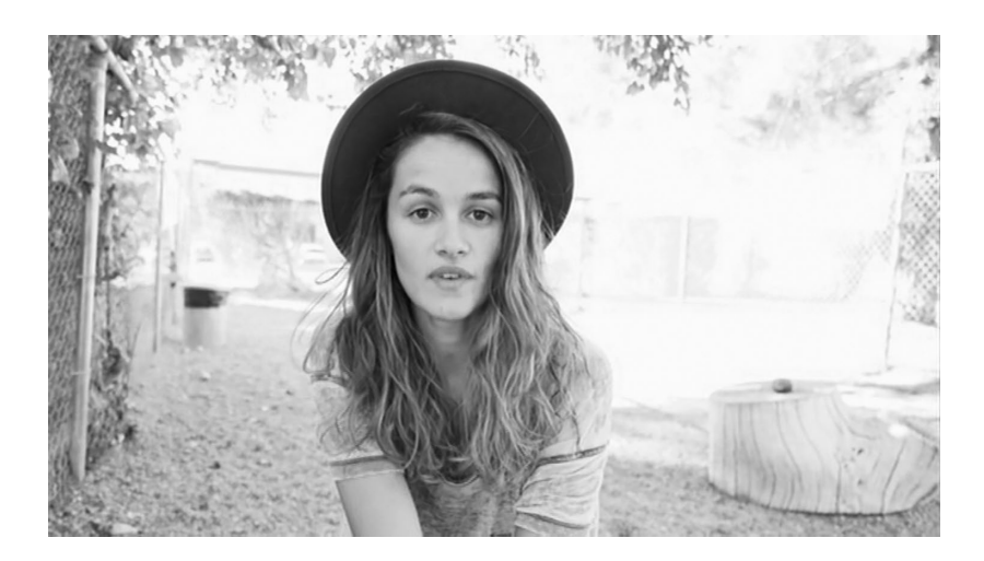
Figure 9.25 Screenshot from Expedition Happiness, 34:19.

the United States. In Figure 9.26, she is vlogging about the health issues of their dog. In my opinion, this shows another significant media convergence effect: not only do the filmmakers use the same visual practices that are used to present themselves on social media channels, and not only do they use the same aesthetics that Instagram uses, but they also integrate the format of the vlog, which is more typical of the online platform YouTube.