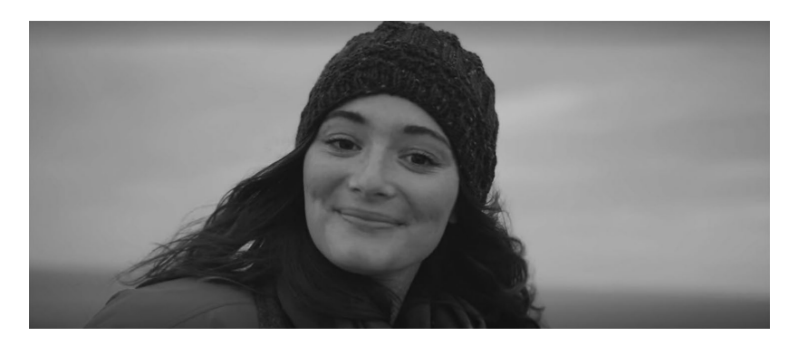
Figure 9.23 Screenshot from Leaving the Frame, 1:28:28.