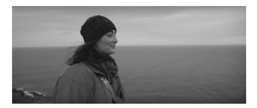
Figure 9.13 Screenshot from Leaving the Frame, 1:28:09.