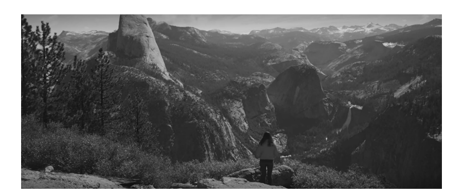
Figure 9.11 Screenshot from Leaving the Frame, 49:58.

showing the face in front of a famous sight and (3) the traveller taking a distinctive body pose (shoulder glance, crossed naked legs and crosslegged seat).