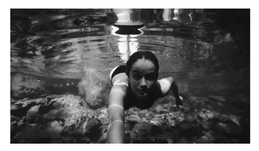
Figure 9.27 Screenshot from Expedition Happiness, 1:28:53.