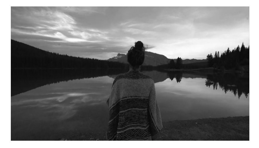
Figure 9.8 Screenshot from Expedition Happiness, 16:10.