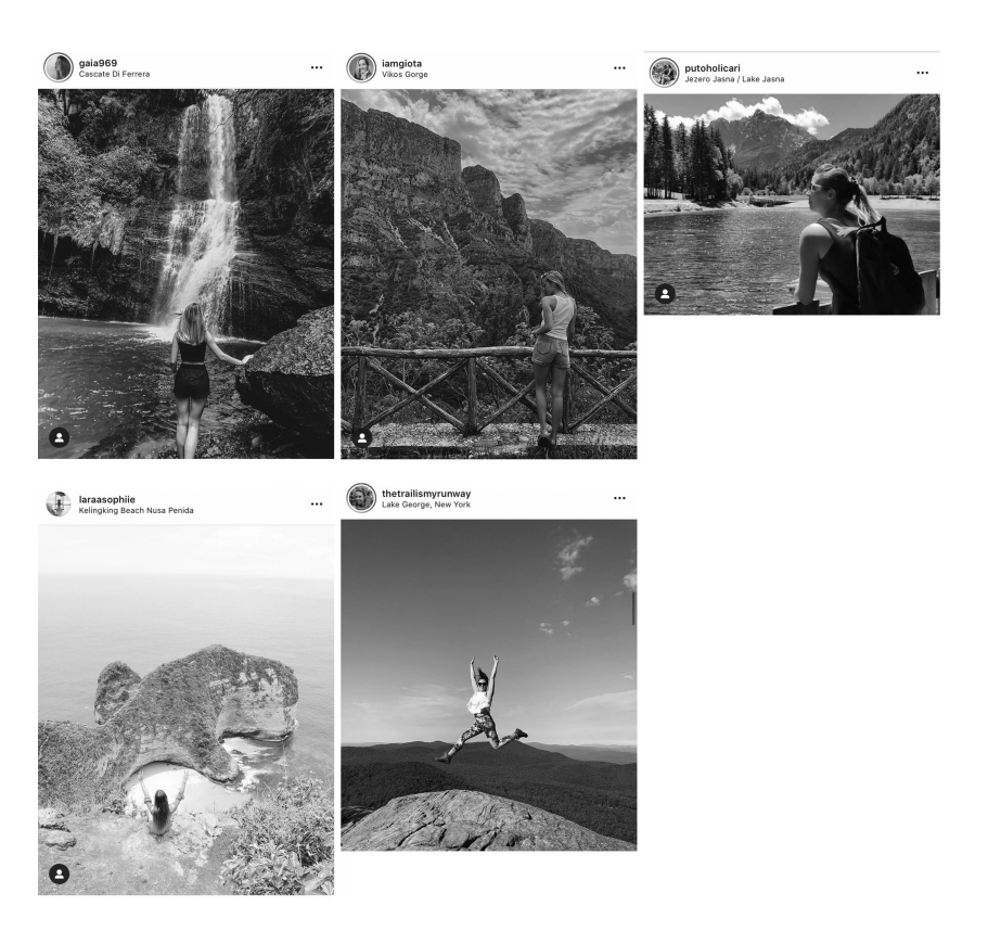
Figure 9.3 Selfie from @gaia969, courtesy of the Instagram account holder. Figure 9.4 Selfie from @iamgiota, courtesy of the Instagram account holder. Figure 9.5 Selfie from @putoholicari, courtesy of the Instagram account holder. Figure 9.6 Selfie from @laraasophiie, courtesy of the Instagram account holder. Figure 9.7 Selfie from @thetrailismyrunway, courtesy of the Instagram account holder.

the third group (5,000–100,000 followers) with six permissions. Four permissions were given by the persons with 0–1,000 followers, and only one by the Instagrammers with more than 100,000 followers, <sup>12</sup> indicating that Instagrammers with a small to middle-sized number of followers had a greater interest in responding to a first contact request than those who had a very small or a very large number of followers. The images for which I was granted permission are reprinted as screenshots, therefore showing the usual Instagram menu icons. The image analysis proposed here will consider both the image and the travel-related hashtag.