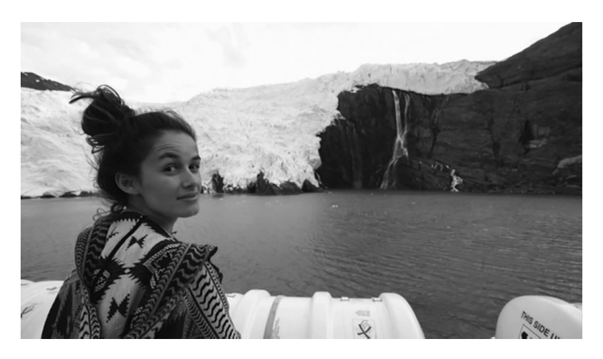
Figure 9.9 Screenshot from Expedition Happiness, 29:45.

Looking at the randomly assembled selfies from Instagram allows a surprisingly easy classification in terms of three picture motifs that will be discussed and compared to the screenshots from the travel documentaries: (1) picturesque landscapes, with the travelling women shot from behind; (2) the 'classical' selfie, showing mainly the traveller's face, often with some specific clothing accessory (hat, sunglasses or headlamp) or