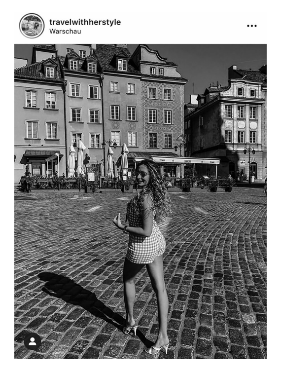
Figure 9.28 Selfie from @travelwithherstyle, courtesy of the Instagram account holder.

which comes from an account with more than 100,000 followers is also the one that reproduces the discussed body clichés most clearly, and this is in line with Malisa's aforementioned study (2019).