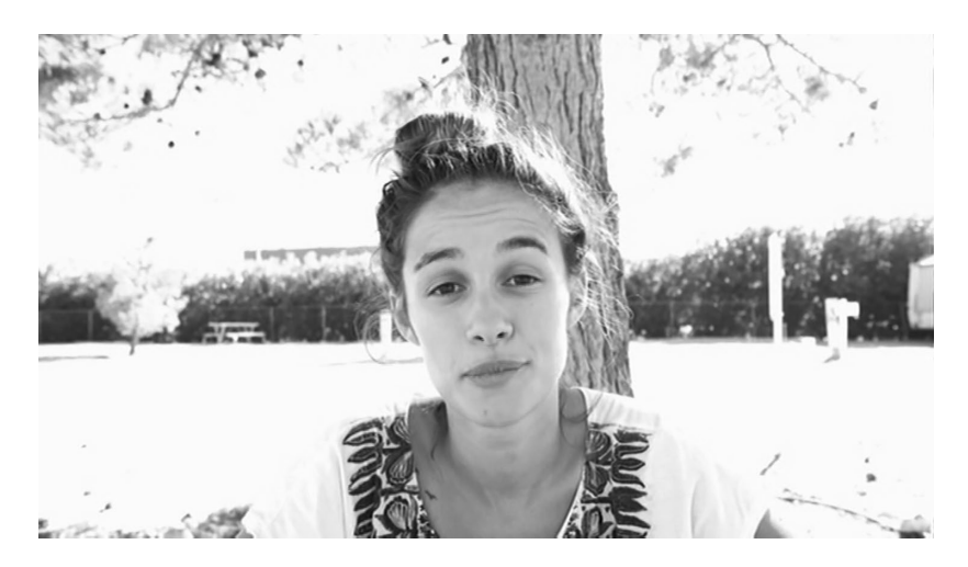
Figure 9.26 Screenshot from Expedition Happiness, 45:11.