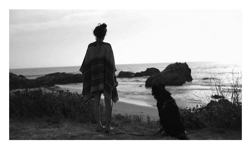
Figure 9.10 Screenshot from Expedition Happiness, 41:53.