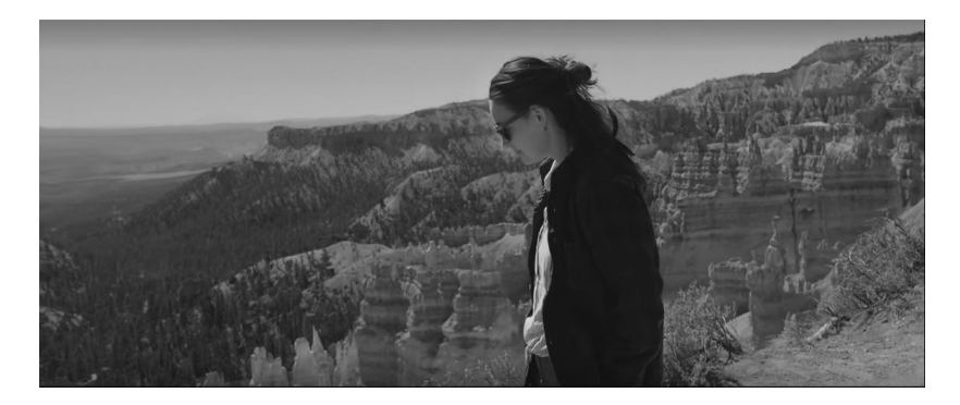
Figure 9.12 Screenshot from Leaving the Frame, 1:02:00.