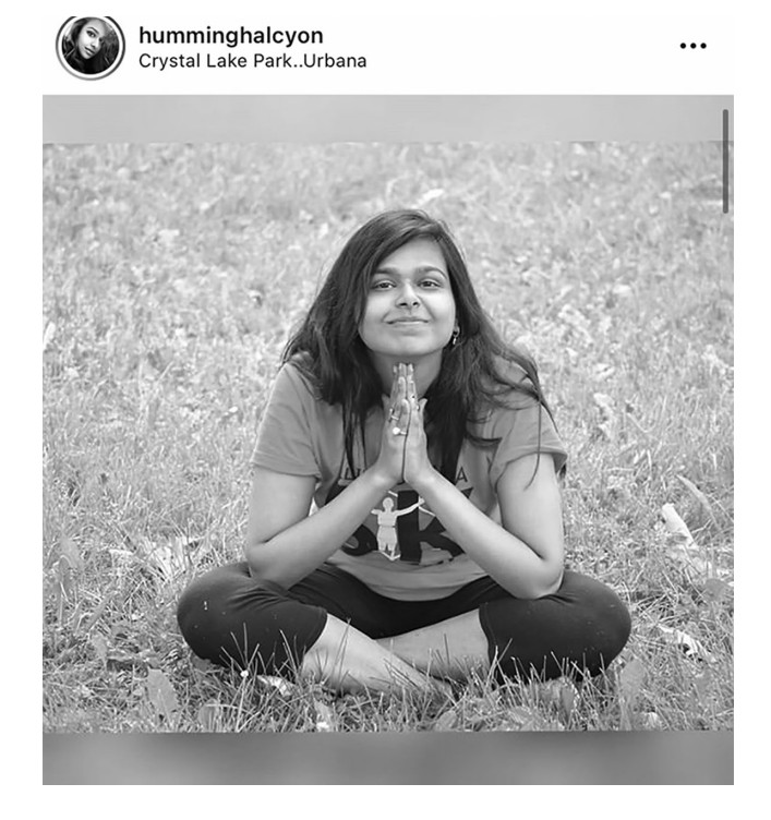
Figure 9.30 Selfie from @humminghalcyon, courtesy of the Instagram account holder.