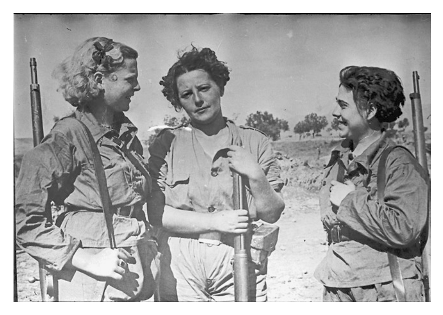
Fig. 4.2 Agustí Centelles. Militiawomen, Aragon front, October 1936.

174-177). She challenges Sontag's attack on feeling as a response to war photography on the supposition that emotion is incompatible with critical reflection (2010, xiv-xv). Linfield argues that this mistrust of emotion disregards the feelings that have motivated the practitioners of documentary photography. She notes that, although Capa was billed by Picture Post as 'the greatest war photographer in the world', his best photos are not of battles but of ordinary people in the Republican zone, whether soldiers or civilians; Capa's talent, she contends, is for communicating to spectators his own affective engagement with his photographic subjects (2010, 177). The photograph chosen by her shows a couple of POUM militiamen on the Aragon front dancing a lively Aragonese jota, with their comrades looking on enthusiastically.<sup>7</sup> She singles out this photograph for its ability