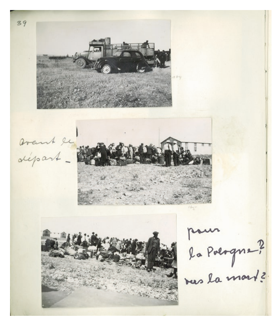
Fig. 5.3 Page from Bohny-Reiter's photo album showing Jews awaiting deportation from Rivesaltes.