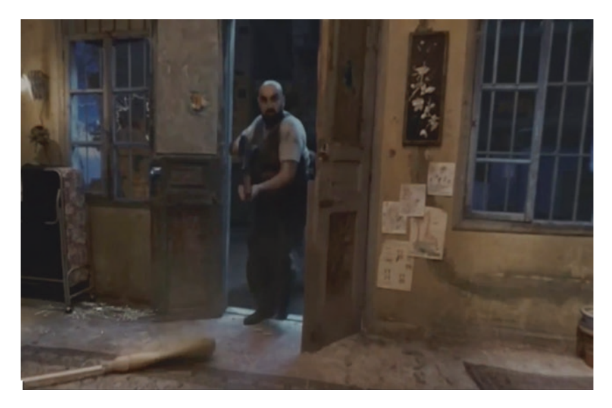
Fig. 7.1 Two armed combatants entering a family house. The Right Choice, 2018