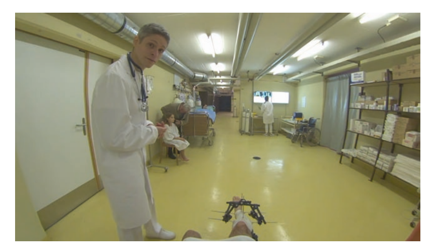
Fig. 7.2 A doctor greets the viewer/patient in a wheelchair before the blast. Not A Target , 2016

confrontation with the audiovisual evidence without any explanation given or character to follow.