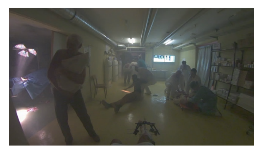
Fig. 7.3 An elderly man carries a wounded baby as civilians run into the hospital after the blast. Not A Target , 2016