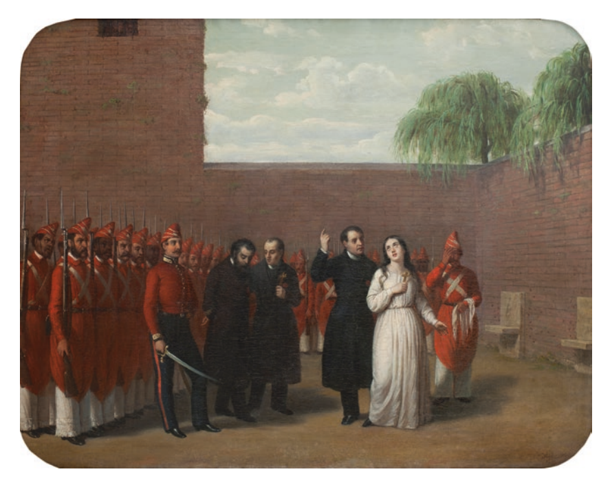
Fig. 2.4 Francesco Augero, La ejecución de Camila O'Gorman (1858), oil on canvas, 49 cm × 63 cm, courtesy of the Mario López Olaciregui Collection