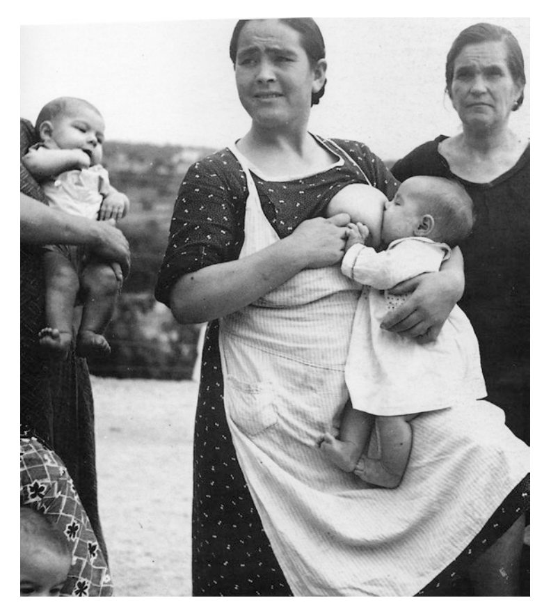
Fig. 4.4 Kati Horna. Maternity centre, Vélez Rubio, Almería, August 1937.

this invisible off-frame space. A similar effect is produced by a further photo by Horna, part of a set taken in August 1937 at a maternity centre at Vélez Rubio (Almería) for mothers-to-be evacuated from Madrid and reproduced in an October 1937 double-page photo feature in Umbral (see Fig. 4.4). The nursing mother in the centre gazes anxiously at something to her right that we cannot see but whose presence affects us through the transmission of her anxiety. Horna's ability to convey bodily vitality—in this photo, through the nursing mother's sturdy physique—allows her to affirm life in the midst of precarity.