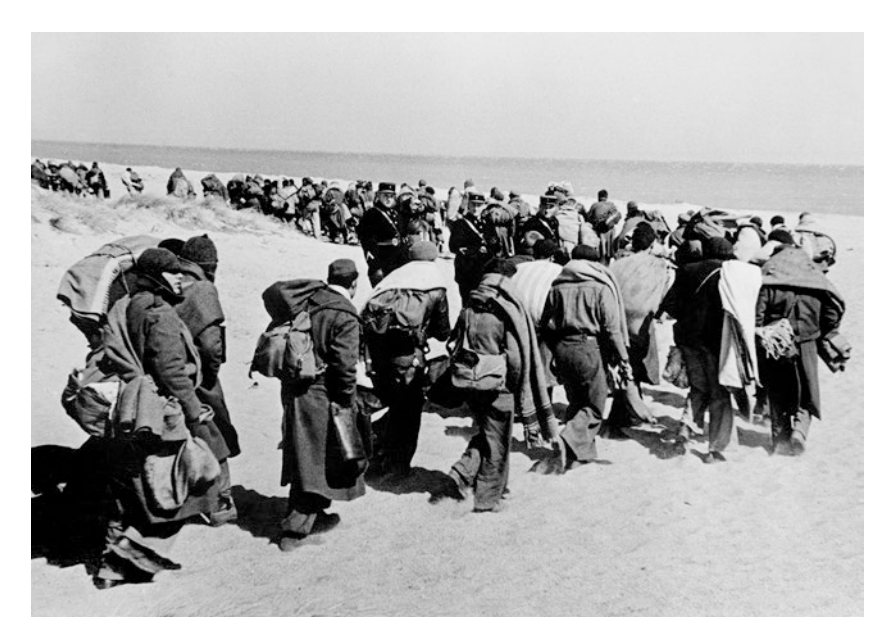
Fig. 4.3 Robert Capa. Republican refugees, Le Barcarès internment camp, southern France, March 1939.

Particularly interesting, but much less well known, are the photos taken in the French camp at Argelès in May 1939, just over a month after Franco declared victory, by the American woman photographer Ione Robinson, on behalf of the Republican Emigration Service in France which was arranging boats to take Republican refugees to Mexico. Robinson avoids depicting the abject conditions of the camps, preferring to convey the bodily vitality of the Republican internees. One photo depicts a handsome young Republican leaning out of the window of his wooden barracks; another captures two athletic males, one with naked torso seated on a crate and the other in a vest leaning towards him, both of them smiling. When Robinson subsequently visited an internment camp for Spanish Republican refugees in Algeria, again for the Republican Emigration Service, she took only one photo because she did not want to convey the despondency into which the internees had fallen (Cate-Arries 2004, 414). Robinson may have felt it important to give a positive image of the