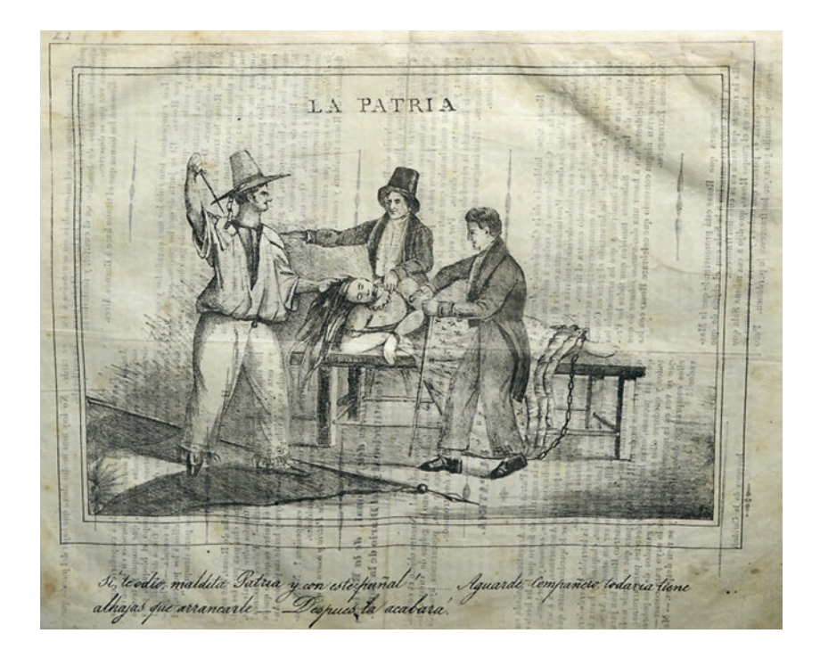
Fig. 2.1 Unknown author, La Patria, El grito arjentino , 24 February 1839 (Creative Commons 2.0)

A similar image appears in the issue from 25 May 1839, in a drawing structured with before and after examples. On the left side, it shows the state of the motherland in 1810, when independence was proclaimed. An allegorical Argentina sits on a throne, holding the national flag in one hand and broken chains in the other. A lion lays at her feet while General Manuel Belgrano (1770–1820) is crowning her with a laurel wreath. The right side then shows the situation as it stands in 1839, from the perspective of the unitarian enemies of Rosas. He is again depicted in the company of the Anchorena brothers, acting as his hangmen (Pradère 1914, 180).