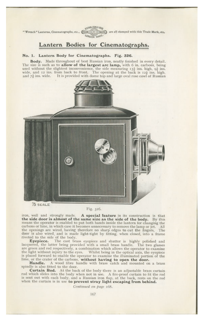
Fig. 3.2 'Wrench' series lanterns, cinematographs, and accessories (1908): 167. EXEBD 36621/3.