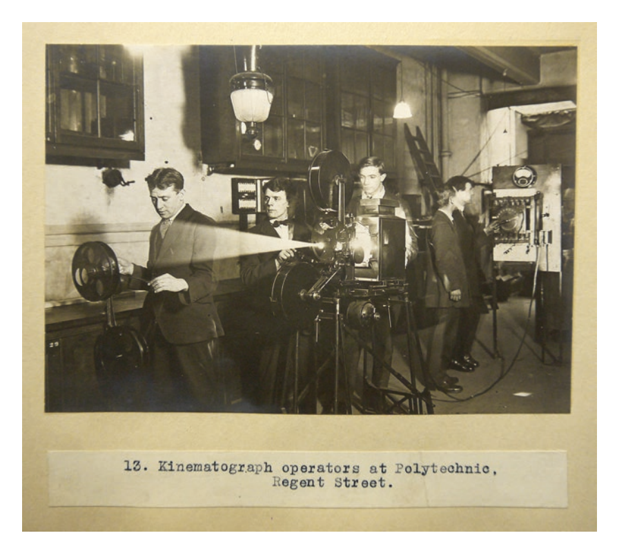
Fig. 3.1 Group of disabled ex-servicemen training as cinematograph operators at the Regent Street Polytechnic, Westminster, circa 1918. Photographer unknown. From an album of photographs of disabled ex-servicemen receiving training in various workshops in London, 1918–29. RSP 9/49. (Reproduced by kind permission of the University of Westminster Archive)

training programmes were not considered to be complete until a man had actually been placed in a job'.<sup>2</sup> This narrative thus opened up the opportunity to envision a classroom environment where disabled soldiers