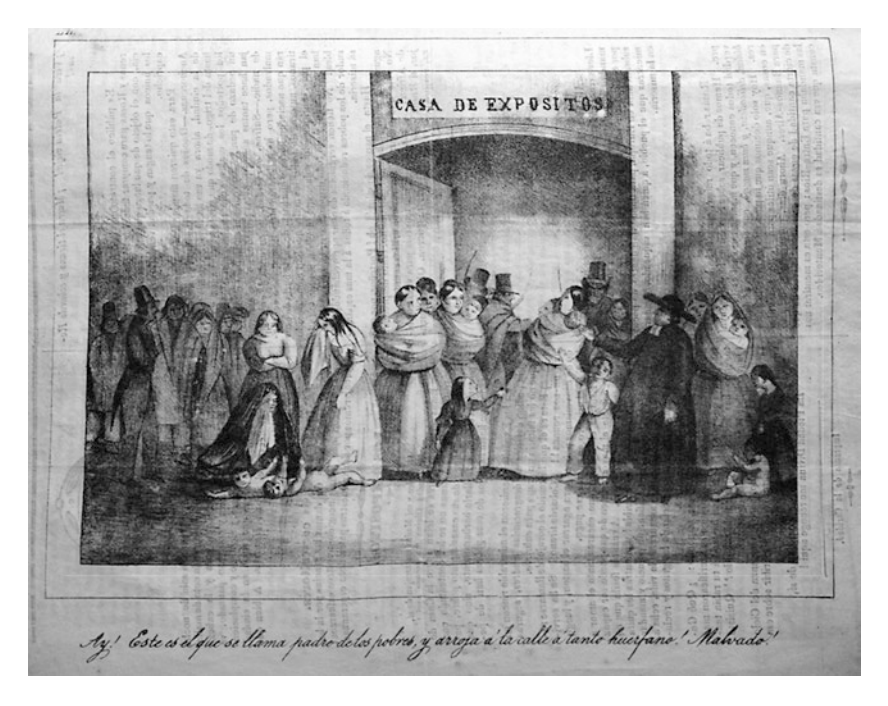
Fig. 2.2 Anonymous, El grito arjentino , 28 February 1839 (Creative Commons 2.0)

for the United States or Marianne for Republican France (Braun 1999, 64-65); however, in this particular case, the female figure serves to draw attention to grievances and, in this way, functions to inspire humanitarian sensibility. As Taithe has shown in his focus on visual representations of the 1860s, 'women and children had key symbolic roles in representations which sought to define open-ended humanitarian aims' (Taithe 2007, 126; see also Hutchison 2019, 224). This aspect was emphasised in particular through the topos of widows and foundlings and their fate under Rosas's rule. War casualties and the mass executions of opponents resulted in a considerable number of widows and orphans without means of subsistence. Rosas had closed foundling hospitals, apparently due to a budget shortage (Prieto 2021). El grito arjentino raised this topic at least twice. In the second issue from 28 February 1839, an engraving represents the Casa de expósitos which women and children were forced to leave. The engraving shows toddlers lying in the street, naked (Fig. 2.2). The caption reads: