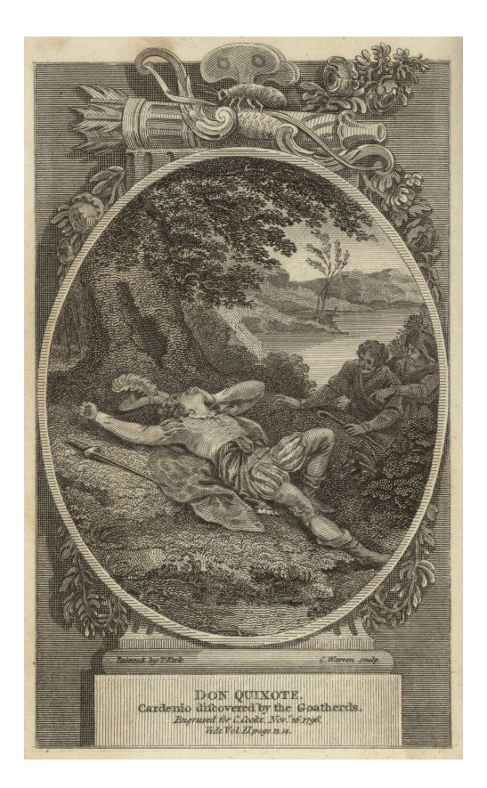
Figure 4: Cardenio Discovered by the Goatherds, Thomas Kirk (il.); Charles Turner Warren (eng.). London: C. Cooke, ca. 1796.

with the Captive, which, furthermore, shows the Romantic predilection for Orientalist settings. This scene had been illustrated for the first time in Carteret's edition and instantly became a must-have for English editions, especially during the Romantic period, due to its evocative character. A similar interest is shown in The Disastrous Situation of Sancho & His Ass , whose ancient ruins and mysterious atmosphere must be connected to one of the aesthetic developments of Romanticism: the picturesque.