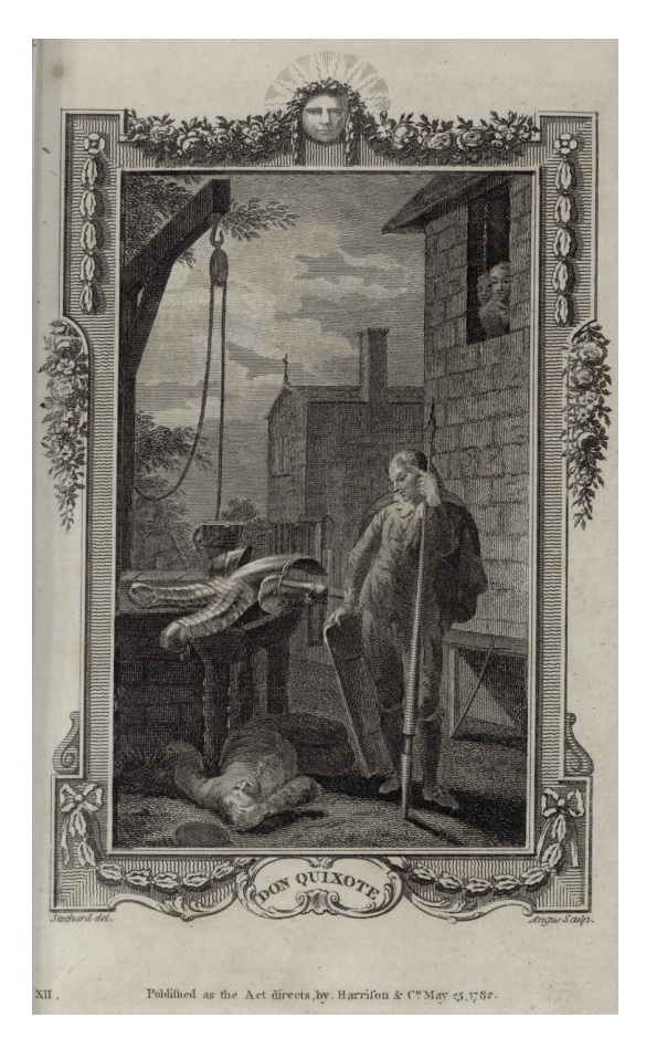
Figure 3: Don Quixote's Night Vigil of Arms , Thomas Stothard (il.); William Angus (eng.). London: Printed for Harrison and Co., 1784.

The composition is completed with the allegory of Folly, a buffoon, underneath. Another consequence of unrequited love, despair, is depicted in the scene in which Cardenio is observed by the goatherds; in this case, the meaning of the scene is completed with an ornamental frame that includes Cupid's attributes (bow and arrows), a butterfly and roses (Figure 4). All these are references to foolish love, the kind based on fleeting beauty that frequently overcomes the young man. The interest in this sort of melodramatic love scene is also represented in Zorayda