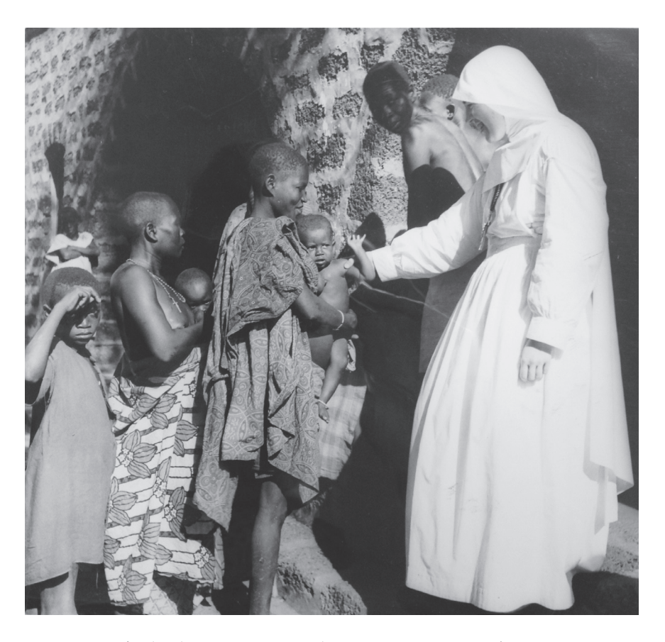
Figure 1.2 I 'The dispensary at Nandom gives an average of 37,000 consultations each year. Here a White Sister chats with a mother who is waiting her turn in the queue with her baby' (c.1950s).

extra £26,000 earmarked for 1955-56.<sup>118</sup> Unlike the government, who struggled to staff large institutions in the far-flung reaches of the colony (especially lacking medical officers and nursing Sisters to meet increased demand), missionary bodies were at a zenith of recruitment from Europe and America.<sup>119</sup> However, there also many that chose not to capitalise on the money and those who were unable to gain any funding. Medical missions in this period were formalising but they remained complex, varied, and independent in many regards.