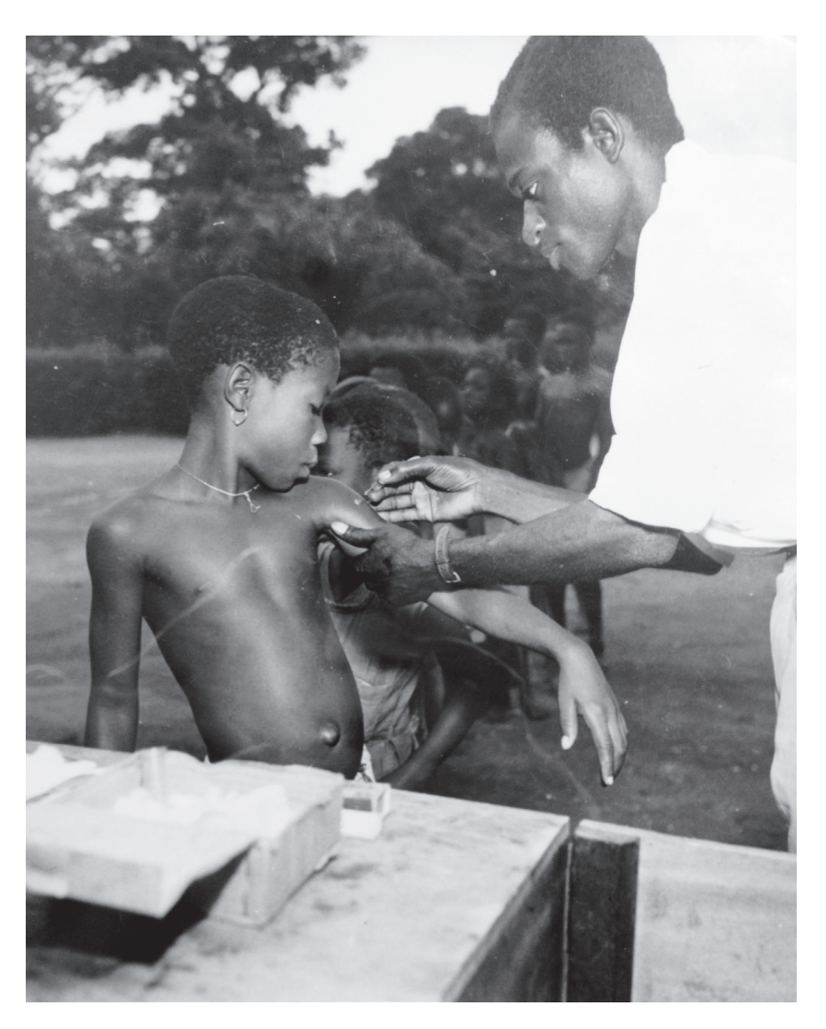
Figure 4.2 | 'Children are vaccinated against smallpox by the Mobile Medical Field Unit working in the Trans-Volta-Togoland Region' (19 October 1954).