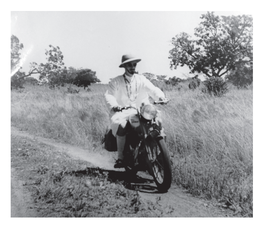
Figure 1.4 | 'White Fathers in the Northern Territories of the Gold Coast. The White Fathers – are responsible for a great deal of welfare work among the people of the Northern Territories of the Gold Coast ... The motor cycle – which can get through narrow tracks which no four-wheeled vehicle could tackle – is the favourite means of transport among White Fathers in the North. A large number of remote villages are regularly visited'.

force some people to follow their catechism-classes'. The chief was also backing their move to place a Presbyterian teacher in their middle school by getting him to write to the Education Department at Tamale saying that there was no Builsa teacher capable of the post. The head teachers in the district attempted to force the chief to retract his letter regarding the lack of capacity. 'Needless to say', the White Father concluded, 'the Presbyterians are looked upon with more and more suspicion by all the teachers and literate people'. The White Father noted that the Presbyterian pastor was giving milk to women and selling